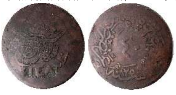
542. TURKEY: AE 40 para, Wilski-G19-03, Telonia, Antissa (Lesbos), on Turkey, 1255 year 20, bold countermark, attractive VF on Fine host $80 - 100