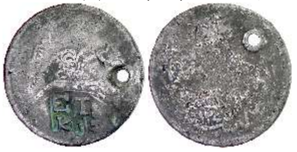
532. TURKEY: AE 40 para, Wilski-G05-03, Agia Sofia (Lemnos), on Turkey 1255 year 18, clear countermark, pierced and lightly silver-washed, perhaps for decorative purposes, VFon VG host $80 - 100