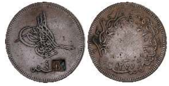
530. TURKEY: AE 40 para, Wilski-G2-02a, Vatousa (Lesbos), 1881, on Turkey 1277 year 1 (F-VF), date divided in two sections, with the letter B between, VF-EF $80 - 100