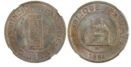
1448. FRENCH COCHINCHINA: cent, 1884-A, KM-3, lovely chocolate surfaces with traces of original red, NGC graded MS64 BR