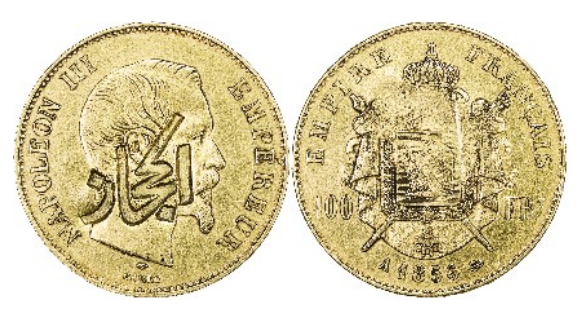
1450. HEJAZ: AV 100 francs (32.13g), NM, ND, KM-—, countermarked al-hijaz on France, 100 francs, 1856-A, type KM-786.1, EF on VF-EF host, RR $4,000 - 5,000

Modern fantasy countermark, probably made during or shortly after the 1960s. Still, these fantasies are very rare in gold.