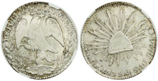
2003. MEXICO: AR 8 reales, 1838-Pi, KM-377.12, assayer JS, NGC graded MS61 $100 - 150