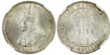
1646. BRITISH WEST AFRICA: George V, 1910-1936, AR shilling, 1918-H, KM-12, NGC graded MS63 $110 - 150