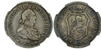
2010. NICARAGUA: Fernando VII, 1808-1821, AR real, 1808, KM-M1, Medina-312, proclamation issue struck to proclaim the accession of Fernando VII in the city of León, Nicaragua, and with the denomination, 1 R, flanking the coat of arms on the reverse, NGC graded EF45, S $500 - 600