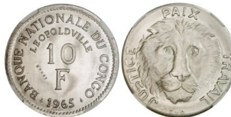
1680. CONGO (DEMOCRATIC REPUBLIC): aluminum 10 francs, 1965, KM-E1var, ESSAI, regarded as a trial strike for the silver & gold essais released for this type (KM-E1 and E2), NGC graded MS66, RR $500 - 600