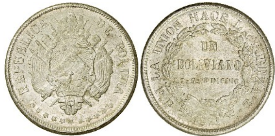
1953. BOLIVIA: AR boliviano, Potosi, 1871, KM-155.3, assayer FP, UNC $120 - 160