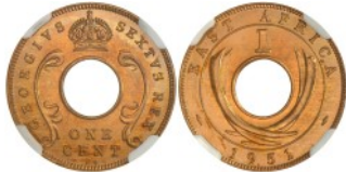
1618. BRITISH EAST AFRICA: George VI , 1937-1952, 1 cent, 1951-KN, KM-32, specimen strike, NGC graded Specimen 66 RB, RR $225 - 275