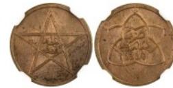
1732. MOROCCO: Yusuf , 1912-1927, muzuna, Paris, AH1330, Y-26, NGC graded MS63 RB $100 - 120