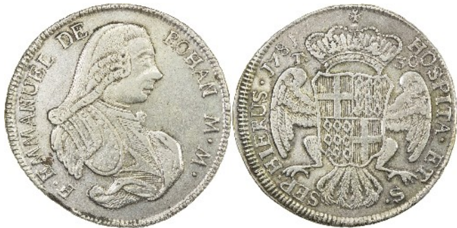
1911. MALTA: Emmanuel de Rohan, 1775-1797, AR 30 tari (29.41g), 1781, KM-327, nice strike, strong VF-EF $400 - 500