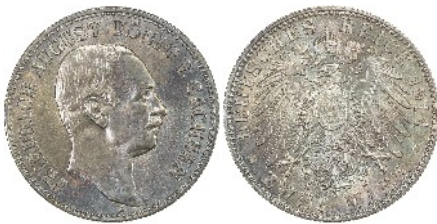
1845. SAXONY: Friedrich August III , 1904-1918, AR 2 mark, 1914-E, KM-1263, nice multi-colored tone, gem UNC $250 - 300

The reverse legend translates as "go to the bees, learn from them."