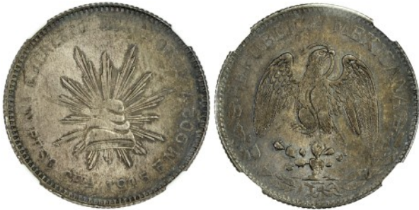
2006. CHIHUAHUA: Revolution, 1910-1920, AR peso, 1915-CHa, KM-619, Ejercito del Norte (Army of the North) issue of Francisco 'Pancho' Villa, lovely toning, NGC graded MS62 $175 - 250