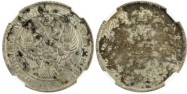
1932. RUSSIAN EMPIRE: Nicholas I, 1825-1855, AR 25 kopecks, 1838, Cr-166, EA# mint, = mintmaster, NGC graded MS61 $150 - 250