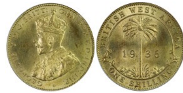
1651. BRITISH WEST AFRICA: George V, 1910-1936, shilling, 1936-KN, KM-12a, specimen strike, PCGS graded Specimen 66, RR $500 - 600