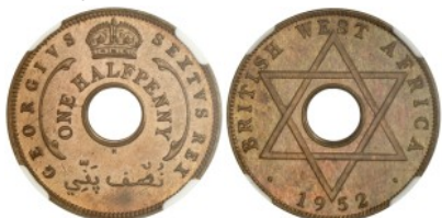
1672. BRITISH WEST AFRICA: George VI, 1937-1952, 1/2 penny, 1952-H, KM-27a, specimen strike, NGC graded Specimen 65 Red Brown, RR $200 - 250