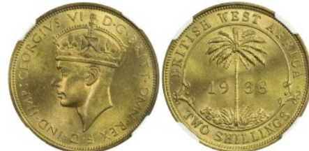
1668. BRITISH WEST AFRICA: George VI , 1937-1952, 2 shillings, 1938-KN, KM-24, NGC graded MS64 $100 - 140