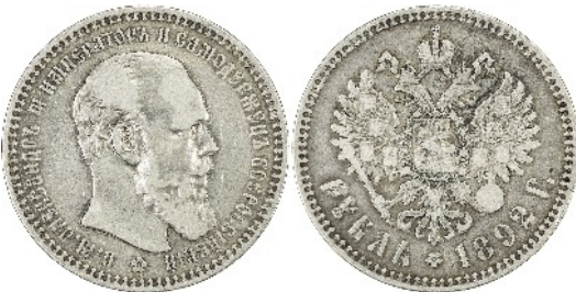
1936. RUSSIAN EMPIRE: Alexander III, 1881-1894, AR rouble, 1892, Y-46, EA# mint, ! mintmaster, F-VF $160 - 200

1937. RUSSIAN EMPIRE: LOT of 35 pieces: ¼ kopeck 1841, ½ kopeck 1840, 1 kopeck 1840, 1841, 1854, 1859, 2 kopeck 1811, 1841, 1862, 1865, 3 kopeck 1881, 5 kopeck 1875, 1889, 10 kopeck 1764, 1828, 15 kopeck 1789, 20 kopeck 1831, 1836, 1913, 25 kopeck 1829, 1855, 1857, 1859, 1894, 1896, 50 kopeck 1894, 1896 (2 pieces), 1897 (2 pieces), 1899, 1912, ½ rouble 1840, and rouble 1854, also USSR 50 kopeck 1926, mostly F-VF, several EF, fun lot for a beginner, retail about $700, lot of 35 pieces $300 - 500