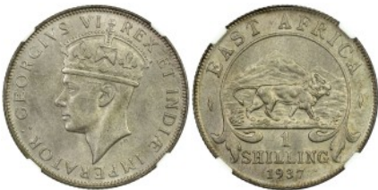
1616. BRITISH EAST AFRICA: George VI , 1937-1952, shilling, 1937-H, KM-28.1, NGC graded MS66 $180 - 200