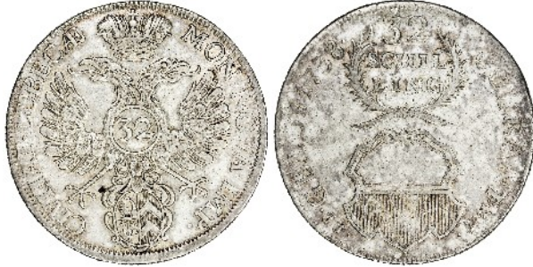
1843. LÜBECK: Freie und Reichsstädte , AR 32 schilling, 1738, KM-154, Dav-627, small reverse spot and mottled tone with some obverse luster, VF ex Oldenburg Auction 18/III/94 Lot 1155 $140 - 160