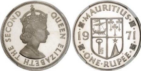
1723. MAURITIUS: Elizabeth II , 1952-1987, rupee, 1971, KM-35.1, NGC graded Proof 68 Ultra Cameo $100 - 120