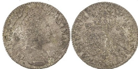
1828. FRANCE: Louis XIV , 1643-1715, AR ½ écu (15.07g), Lyon, 1709-D, KM-382.4, three-crown reverse, choice VF $130 - 170