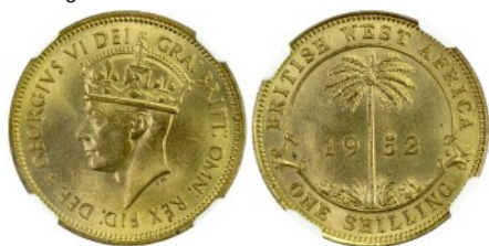
1674. BRITISH WEST AFRICA: George VI, 1937-1952, shilling, 1952-H, KM-28, NGC graded MS65 $100 - 120