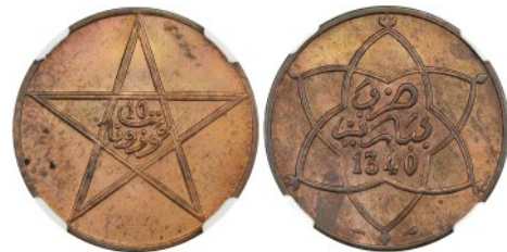
1733. MOROCCO: Yusuf , 1912-1927, 10 muzuna, Poissy, AH1340, Y-29.2, NGC graded MS63 RB $110 - 150