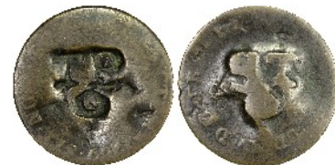
2012. TOBAGO: AE 2 1/2 pence, ND (1798), KM-6, countermarked TBO on France, Louis XV (1715-1774) 2 sous dated 1769 (clear), VF on Fair host, R $230 - 270