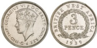
1662. BRITISH WEST AFRICA: George VI , 1937-1952, 3 pence, 1939-KN, KM-21, specimen strike, PCGS graded Specimen 64, RR $250 - 325