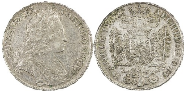
1866. HUNGARY: Karl VI , 1711-1740, AR taler (28.76g), Kremnitz, 1727 KB, KM-301, EF $500 - 700