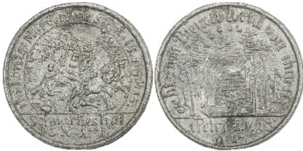
1844. NUREMBERG: medal (13.99g), 1771, Hut-Cza-3126, moralizing medal in cast pewter referring to the attempted murder of Stanislas August of Poland, murder scene with "Ihr Konigs Morder. Wie steht Ps.105.V. 15." around and "SchwartzegThal 23.No.1771." below / beehive in a cage under trees with "geht zum Bienen, lernt von ihnen.+." around and "1.Petri 2.v.13 .II .17." in exergue, somewhat crude, 38mm, EF $80 - 100

The reverse legend translates as "go to the bees, learn from them."