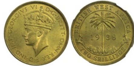
1666. BRITISH WEST AFRICA: George VI , 1937-1952, 2 shillings, 1938-KN, KM-24, NGC graded MS65 $130 - 160