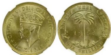
1675. BRITISH WEST AFRICA: George VI, 1937-1952, shilling, 1952-H, KM-28, NGC graded MS64 $80 - 100