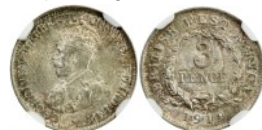
1627. BRITISH WEST AFRICA: George V , 1910-1936, AR 3 pence, 1919-H, KM-10, NGC graded MS65 $100 - 150