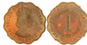
1956. BRITISH HONDURAS: Elizabeth II, 1952-1973, cent, 1959, KM-30, VIP Proof Record specimen, NGC graded PF64 Red Brown $350 - 450