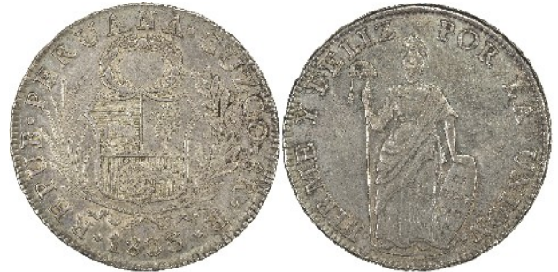
2011. PERU: AR 8 reales, Cuzco, 1833, KM-142.4, assayer B, lustrous EF-AU $200 - 240