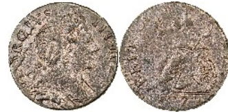
1848. GREAT BRITAIN: George III , 1760-1820, AE farthing, 1773, KM-602, contemporary imitation struck at the same time as the evasion coppers, crude AU $75 - 100