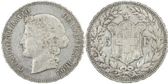
1947. SWITZERLAND: AR 5 francs, 1892-B, KM-34, attractive VF $180 - 220