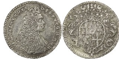
1894. MALTA: Ramon Despuig , 1736-1741, AR 4 tari (4.30g), 1737, KM-202, nice strike, couple very light scratches in obverse field, choice VF $200 - 240