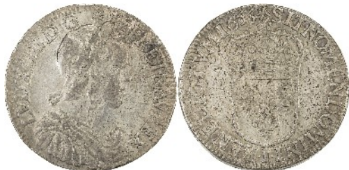
1823. FRANCE: Louis XIV , 1643-1715, AR ½ écu (13.57g), Limoges, 1655-I, KM-164.10, choice VF $110 - 140