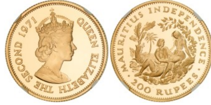
1728. MAURITIUS: Elizabeth II , 1952-1987, AV 200 rupees, 1971, KM-39, finest known, NGC graded Proof 69 Ultra Cameo $900 - 1,100