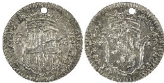
1887. MALTA: Antonio Manoel de Vilhena , 1722-1736, AR taro (1.27g), ND, KM-169, crowned arms of Vilhena / arms of the Order, pierced, EF-AU $80 - 100