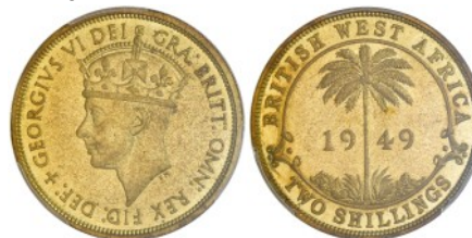
1677. BRITISH WEST AFRICA: George VI, 1937-1952, 2 shillings, 1949-KN, KM-29, specimen strike, PCGS graded Specimen 64, RR $250 - 325