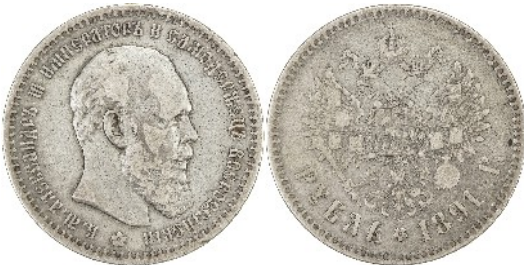
1935. RUSSIAN EMPIRE: Alexander III, 1881-1894, AR rouble, 1891, Y-46, EA# mint, ! mintmaster, F-VF $300 - 350