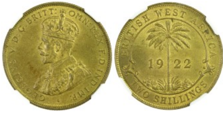
1657. BRITISH WEST AFRICA: George V , 1910-1936, 2 shillings, 1922, KM-13b, NGC graded MS64 $120 - 160