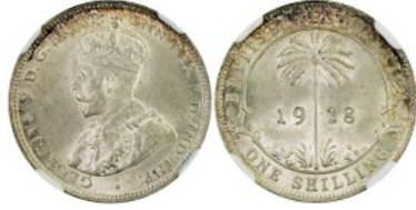
1645. BRITISH WEST AFRICA: George V, 1910-1936, AR shilling, 1918-H, KM-12, NGC graded MS64 $140 - 200