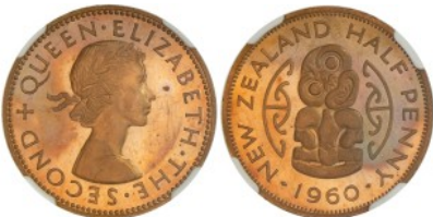
2083. NEW ZEALAND: Elizabeth II , 1952-, ½ penny, 1960, KM-23.2, VIP Proof Record specimen, NGC graded PF63 Red Brown $500 - 650