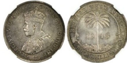
1654. BRITISH WEST AFRICA: George V, 1910-1936, AR 2 shillings, 1913, KM-13, lovely toning, finest grade (population 3), NGC graded MS63 $220 - 300