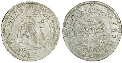
1864. HUNGARY: Leopold I , 1658-1705, AR 15 krajczar, Kőrmöczbánya (Kremnica) mint, 1682, KM-175, brilliant original mint luster, UNC ex Coin Galleries Auction 10-Nov 1999 Lot 792 $150 - 200