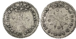
1893. MALTA: Ramon Despuig , 1736-1741, AR 2 tari, 1737, KM-201v, Sch-1, good Fine $200 - 250