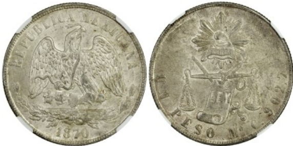
2005. MEXICO: AR peso, 1870-Mo, KM-408.5, assayer C, NGC graded MS63 $230 - 270