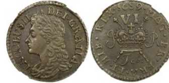
1871. IRELAND: James II , Pretender, 1689-1690, AE 6 pence, 1689 February, KM-93, S-6583K, "gun money" type, NGC graded AU53 $200 - 300 The name "gun money" stems from the idea that they were minted from melted down guns. However, many other brass objects, such as church bells, were also used.