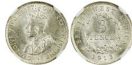
1624. BRITISH WEST AFRICA: George V , 1910-1936, AR 3 pence, 1913, KM-10, NGC graded MS64 $90 - 110