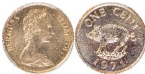
1950. BERMUDA: Elizabeth II, 1952-, cent, 1971, KM-15, PCGS graded PF65 RD, ex King's Norton Mint Collection $80 - 100