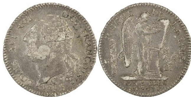
1830. FRANCE: Louis XVI , 1774-1792, AR écu, Montpellier, 1793-N, KM-615.11, also dated year 5 of Liberty, VF-EF $300 - 400