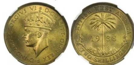
1669. BRITISH WEST AFRICA: George VI , 1937-1952, 2 shillings, 1938-KN, KM-24, NGC graded MS63 $90 - 110