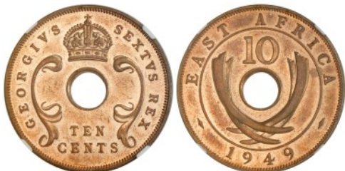
1619. BRITISH EAST AFRICA: George VI , 1937-1952, 10 cents, 1949, KM-34, VIP Proof Record specimen, NGC graded Proof 61 Red, RRR $400 - 500