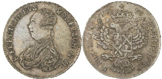
1915. MALTA: Ferdinand von Hompesch, 1797-1798, AR 15 tari (14.76g), 1798, KM-344, VF-EF $260 - 340