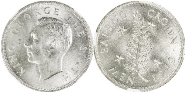
2082. NEW ZEALAND: George VI , 1937-1952, AR crown, 1949, KM-22, NGC graded MS65 $120 - 150