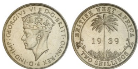
1670. BRITISH WEST AFRICA: George VI, 1937-1952, 2 shillings, 1939-KN, KM-24, specimen strike, PCGS graded Specimen 65, RR $275 - 350