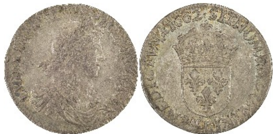
1825. FRANCE: Louis XIV , 1643-1715, AR ½ écu (13.42g), Bayonne, 1662-L, KM-202.9, struck on planchet adjusted for weight before striking, EF $200 - 300