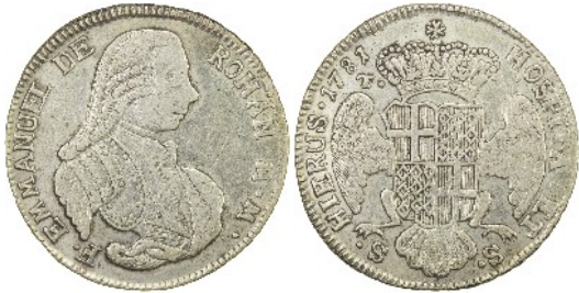
1910. MALTA: Emmanuel de Rohan, 1775-1797, AR 15 tari (14.61g), 1781, KM-325, VF-EF $250 - 300