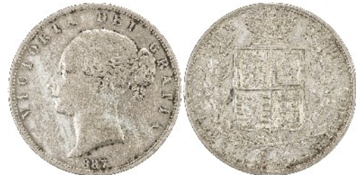
1852. GREAT BRITAIN: Victoria , 1837-1901, AR half crown, 1887, KM-756, young head, EF $200 - 260