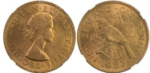
2087. NEW ZEALAND: Elizabeth II , 1952-, penny, 1953, KM-24.1, NGC graded MS65 RD $80 - 100