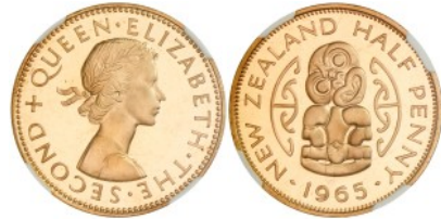
2086. NEW ZEALAND: Elizabeth II , 1952-, ½ pence, 1965, KM-23.2, mintage of only 10 pieces, NGC graded PF65 Red Cameo, RRR $850 - 1,000