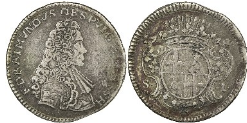
1895. MALTA: Ramon Despuig , 1736-1741, AR scudo (11.73g), 1738, KM-203, VF $360 - 440