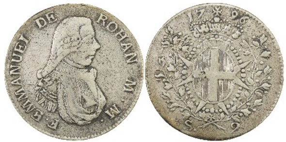
1913. MALTA: Emmanuel de Rohan, 1775-1797, AR 2 scudi (24 tari) (22.58g), 1796, KM-343, VF $200 - 260