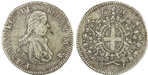
1912. MALTA: Emmanuel de Rohan, 1775-1797, AR scudo (12 tari) (11.98g), 1796, KM-342, attractive VF $180 - 220