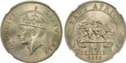
1617. BRITISH EAST AFRICA: George VI , 1937-1952, shilling, 1952, KM-31, NGC graded MS66 $80 - 100