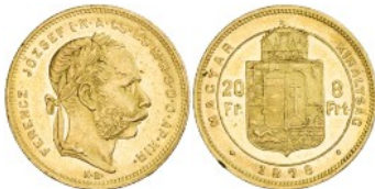
1867. HUNGARY: Ferenc József , 1848-1916, AV 8 forint, KM-455.1, UNC $300 - 350