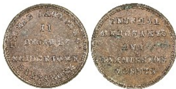
1949. BARBADOS: AE farthing token, ND (ca. 1847-1865), Lyall-88, Prid-29, Thomas Lawlor & Co., Bridgetown, Barbadoes, a few tiny verdigris spots on reverse, red and brown UNC $160 - 200