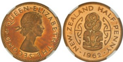
2084. NEW ZEALAND: Elizabeth II , 1952-, ½ penny, 1962, KM-23.2, VIP Proof Record specimen, NGC graded PF64 Red Brown Cameo $500 - 650