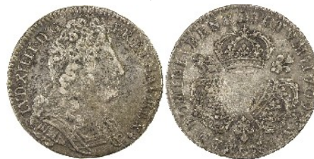
1827. FRANCE: Louis XIV , 1643-1715, AR ¼ écu (7.55g), Reims, 1709-S, KM-380.16, three-crown reverse, EF $230 - 270