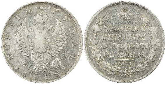
1931. RUSSIAN EMPIRE: Alexander I, 1801-1825, AR rouble, 1818, Cr-130, EA# mint, AE mintmaster, VF $150 - 200