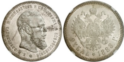
1934. RUSSIAN EMPIRE: Alexander III, 1881-1894, AR rouble, 1888, Y-46, Dav-292, EA# mint, ! mintmaster, NGC graded MS61 $3,000 - 4,000