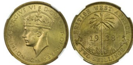
1667. BRITISH WEST AFRICA: George VI , 1937-1952, 2 shillings, 1938-KN, KM-24, NGC graded MS64 $100 - 140