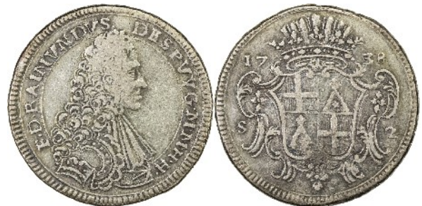
1896. MALTA: Ramon Despuig , 1736-1741, AR 2 scudi (24.27g), 1738, KM-204.3, without tassles on the ornamented shield, lovely F-VF $350 - 400