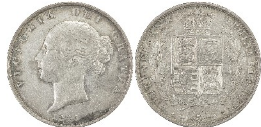
1851. GREAT BRITAIN: Victoria , 1837-1901, AR half crown, 1846, KM-740, VF-EF $300 - 400