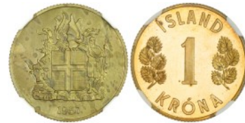
1869. ICELAND: króna , 1957, KM-12a, VIP Proof Record specimen, NGC graded Proof 62 $350 - 450 The obverse has a matte finish, while the reverse has a mirror-like proof finish.