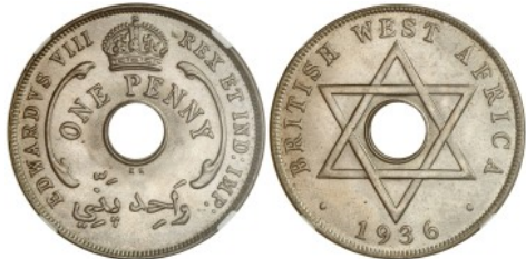
1661. BRITISH WEST AFRICA: Edward VIII , 1936-1937, penny, 1936-KN, KM-16, NGC graded MS65 $50 - 60