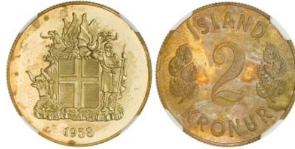
1870. ICELAND: 2 krónur , 1958, KM-13a.1, VIP Proof Record specimen, NGC graded Proof 62 $350 - 450