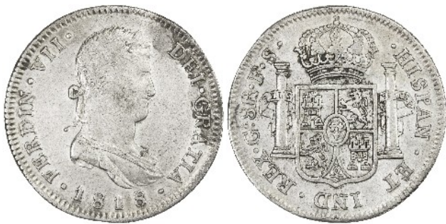
2007. GUADALAJARA: Fernando VII, 1808-1821, AR 8 reales, 1818-Ga, KM-111.3, assayer FS, VF $200 - 230