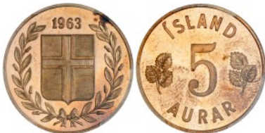
1868. ICELAND: 5 aurar , 1963, KM-9, VIP Proof Record specimen, PCGS graded PF63 CAM $350 - 450