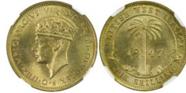
1665. BRITISH WEST AFRICA: George VI , 1937-1952, shilling, 1947, KM-23, rare in this quality, NGC graded MS65 $110 - 150