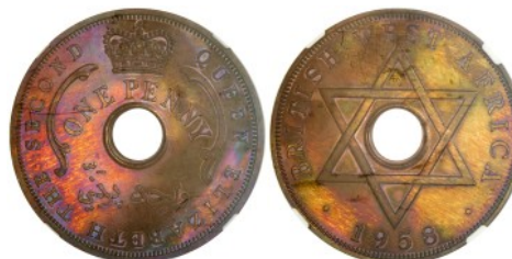
1679. BRITISH WEST AFRICA: Elizabeth II, 1952-1958, penny, 1958, KM-33, VIP Proof Record specimen, NGC graded Proof 63 Brown, RRR $400 - 500