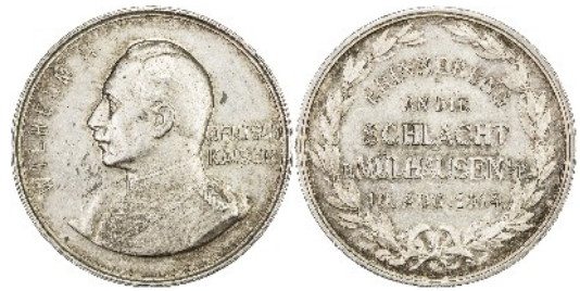
1847. GERMANY: AR medal (15.43g), 33.6mm, for the battle near Mülhausen, 19 August 1914, bust of Wilhelm II / text in wreath, AU $80 - 120