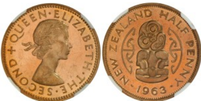
2085. NEW ZEALAND: Elizabeth II , 1952-, ½ penny, 1963, KM-23.2, VIP Proof Record specimen, NGC graded PF62 Red Brown Cameo $500 - 650