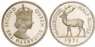
1724. MAURITIUS: Elizabeth II , 1952-1987, ½ rupee, 1971, KM-37.1, finest known (population 1), NGC graded Proof 69 Ultra Cameo $100 - 120