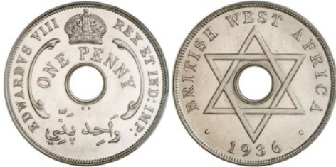
1660. BRITISH WEST AFRICA: Edward VIII , 1936-1937, penny, 1936-KN, KM-16, specimen strike, PCGS graded Specimen 66, RR, ex King's Norton Mint Collection $200 - 250