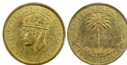
1676. BRITISH WEST AFRICA: George VI, 1937-1952, 2 shillings, 1949-KN, KM-29, specimen strike, NGC graded Specimen 65, RR, ex King's Norton Mint Collection $400 - 500