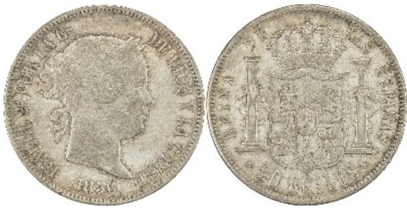
1946. SPAIN: Isabel II, 1833-1868, AR 20 reales, Madrid, 1856, KM-609.2, VF-EF $160 - 200