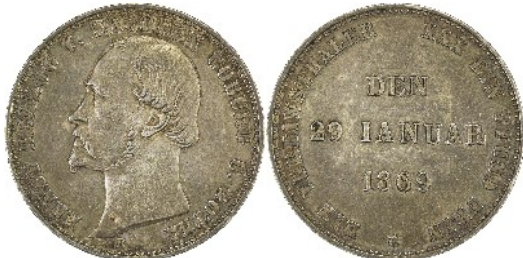
1846. SAXE-COBURG-GOTHA: Ernst II , 1844-1893, AR thaler, 1869-B, KM-152, issue for 29 January 1869, choice EF $150 - 200