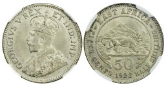
1614. BRITISH EAST AFRICA: George V , 1910-1936, AR 50 cents, 1922, KM-20, NGC graded MS65 $200 - 250