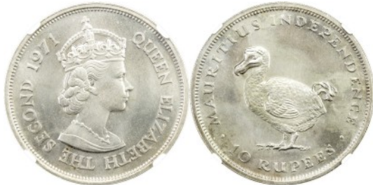
1725. MAURITIUS: Elizabeth II , 1952-1986, AR 10 rupees, 1971, KM-38, Independence, lovely toning, NGC graded MS67 $70 - 90