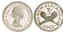
2091. NEW ZEALAND: Elizabeth II , 1952-, 3 pence, 1965, KM-25.2, VIP Proof Record Specimen, mintage of only 10 pieces, NGC graded PF65 Ultra Cameo, RRR $850 - 1,000