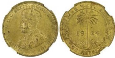
1649. BRITISH WEST AFRICA: George V, 1910-1936, shilling, 1924, KM-12a, NGC graded MS63 $130 - 170