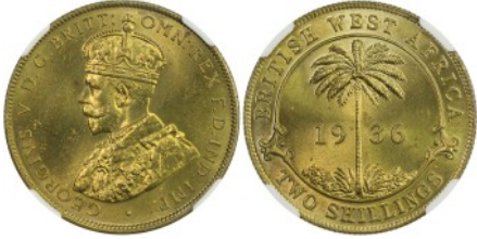
1658. BRITISH WEST AFRICA: George V , 1910-1936, 2 shillings, 1936-KN, KM-13b, gorgeous luster, NGC graded MS64 $120 - 150