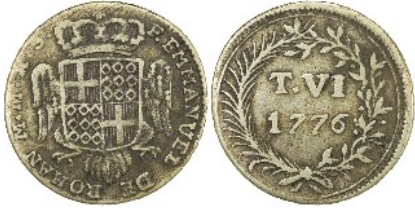
1909. MALTA: Emmanuel de Rohan, 1775-1797, AR 6 tari (5.65g), 1776, KM-303, F-VF $100 - 120