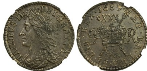
1873. IRELAND: James II , Pretender, 1689-1690, AE 1/2 crown, 1689 February, KM-95, S-6579K, "gun money" type, a superb example! NGC graded MS63 $300 - 400