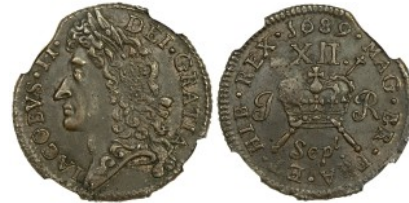
1872. IRELAND: James II , Pretender, 1689-1690, AE shilling, 1689 September, KM-94, S-6581D, "gun money" type, NGC graded AU53 $200 - 300