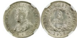
1625. BRITISH WEST AFRICA: George V , 1910-1936, AR 3 pence, 1915-H, KM-10, iridescent toning, finest known (population 2), NGC graded MS63 $140 - 160