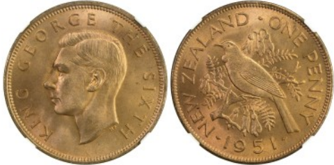
2081. NEW ZEALAND: George VI , 1937-1952, penny, 1951, KM-21, finest known (this piece only), NGC graded MS66 RB $100 - 140