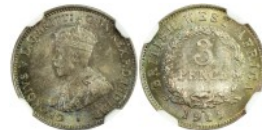
1626. BRITISH WEST AFRICA: George V , 1910-1936, AR 3 pence, 1919-H, KM-10, lovely iridescent toning, finest known (this piece, population 1), NGC graded MS67 $200 - 300