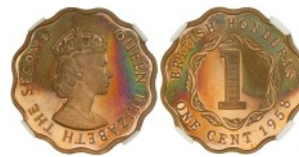
1955. BRITISH HONDURAS: Elizabeth II, 1952-1973, cent, 1958, KM-30, VIP Proof Record specimen, NGC graded PF63 Red Brown $350 - 450

This issue is considered a pattern by some authorities.