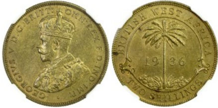
1659. BRITISH WEST AFRICA: George V , 1910-1936, 2 shillings, 1936, KM-13b, NGC graded MS64 $100 - 140