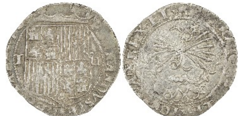
1945. SPAIN: Fernando V & Isabel II, 1474-1504, AR 2 reales (6.74g), Toledo, Cal-278, pleasing strike, VF-EF $160 - 200

1944. U.S.S.R.: Lot of 6 annual mint sets, each of 9 uncirculated specimens, including 1, 2, 3, 5, 10, 15, 20 and 50 kopecks, and 1 rouble, in the original plastic box, dated 1974, 1975, 1976, 1977, 1978 and 1989. All are in excellent condition, except for the common 1989 set, which has several pieces corroded and is thus of little value; plus the 7-coin set of 1962 in original cellophane wrapper, a "Coins of All Nations" 20 kopeck 1978 in stamped envelope (by the Franklin Mint), and a partial 1961 set in original packaging (missing 3, 5 and 15 kopeck), retail value of $600, lot of 9 items $300 - 400