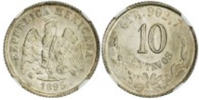
2004. MEXICO: AR 10 centavos, 1895-Go, KM-403.5, assayer R, NGC graded MS65 $120 - 160