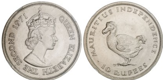
1726. MAURITIUS: Elizabeth II , 1952-1987, 10 rupees, 1971, KM-38, Independence, dodo bird on reverse, struck in copper-nickel, NGC graded MS66 $70 - 90