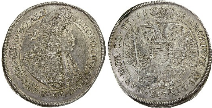
1865. HUNGARY: Leopold I , 1658-1705, AR thaler, Kőrmöczbánya (Kremnica) mint, 1691, KM-214.2, Dav-3261, 47mm, lovely well-centered strike, EF ex Coin Galleries Auction 18-Jul 2001 Lot 820 $350 - 450 Photo size slightly reduced.