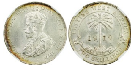
1655. BRITISH WEST AFRICA: George V, 1910-1936, AR 2 shillings, 1919, KM-13, surface hairlines, NGC graded UNC details $100 - 120