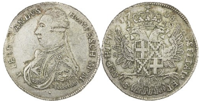
1916. MALTA: Ferdinand von Hompesch, 1797-1798, AR 30 tari (29.61g), 1798, KM-345.3, pellet below bust on obverse, lovely VF-EF $400 - 500