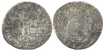
1885. MALTA: Juan de Homedes , 1536-1553, AR tari (2.48g), ND, Azz-633, lamb on ground line, holding flag, Fine $100 - 120