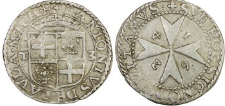
1886. MALTA: Antoine de Paule , 1623-1636, AR 3 tari (7.80g), 1624, KM-47, Maltese cross, date between the limbs, choice VF, R $500 - 600