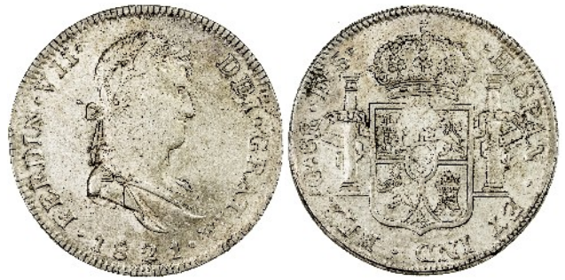
2008. GUADALAJARA: Fernando VII, 1808-1821, AR 8 reales, 1821-Ga, KM-111.3, assayer FS, light tone, EF $250 - 350