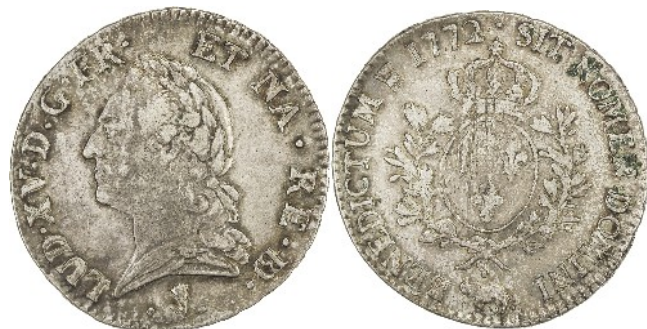
1829. FRANCE: Louis XV , 1715-1774, AR écu (28.94g), Pau, 1772, KM-555, cow mintmark, choice VF $130 - 170