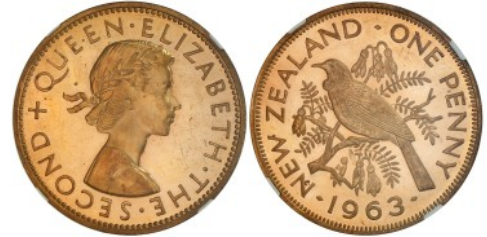
2089. NEW ZEALAND: Elizabeth II , 1952-, penny, 1963, KM-24.2, VIP Proof Record specimen, NGC graded PF64 Red $500 - 650