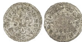
1826. FRANCE: Louis XIV , 1643-1715, AR sol (0.79g), Strasbourg, 1683, KM-245, lustrous AU, R $180 - 220