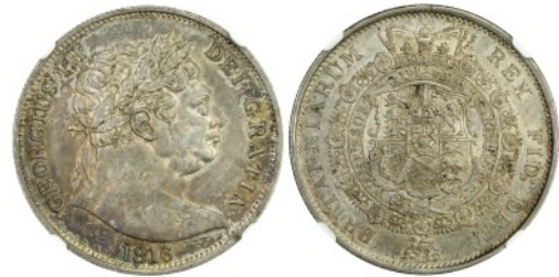
1850. GREAT BRITAIN: George III , 1760-1820, AR 1/2 crown, 1816, KM-667, iridescent toning, NGC graded AU58 $200 - 250