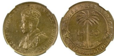
1656. BRITISH WEST AFRICA: George V, 1910-1936, 2 shillings, 1920-KN, KM-13b, NGC graded MS63 $100 - 120