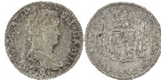
1952. BOLIVIA: Fernando VII, 1808-1825, AR real, Potosi, 1824-PTS, KM-87, assayer PJ, lovely toning, choice AU $120 - 160