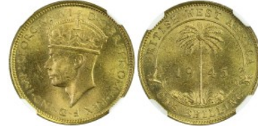
1664. BRITISH WEST AFRICA: George VI , 1937-1952, shilling, 1945-H, KM-23, rare in this quality, NGC graded MS64 $100 - 140