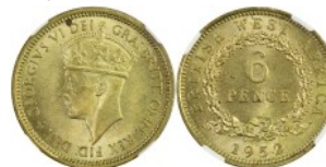
1678. BRITISH WEST AFRICA: George VI, 1937-1952, 6 pence, 1952, KM-31, finest known (population 1, with 35 others graded by NGC at lower numbers), NGC graded MS65, R $350 - 450

This type was never released into circulation, and it is reported that only 167 pieces escaped the melting pot in New Jersey.