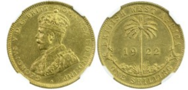
1647. BRITISH WEST AFRICA: George V, 1910-1936, shilling, 1922-KN, KM-12a, struck in tin-brass alloy, surface hairlines (very minor), NGC graded UNC details $100 - 120