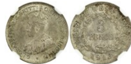
1623. BRITISH WEST AFRICA: George V , 1910-1936, AR 3 pence, 1913, KM-10, attractive toning, NGC graded MS65 $140 - 160