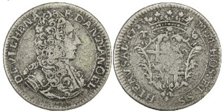
1890. MALTA: Antonio Manoel de Vilhena , 1722-1736, AR 6 tari (6.67g), 1723, KM-179, pleasing F-VF, R $400 - 500