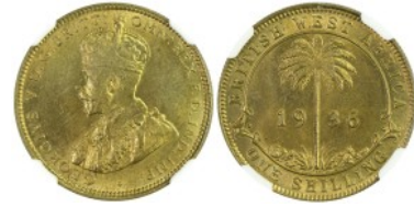
1652. BRITISH WEST AFRICA: George V, 1910-1936, shilling, 1936-H, KM-12a, NGC graded MS65 $140 - 200