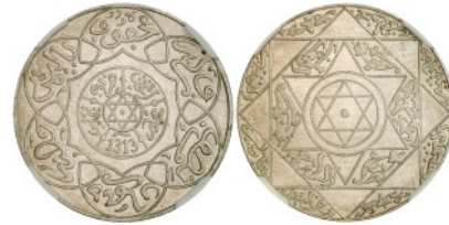
1730. MOROCCO: Abd al-Aziz , 1894-1908, AR 2½ dirham, Berlin, AH1313, Y-11.1, NGC graded MS64 $120 - 160