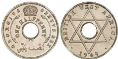
1671. BRITISH WEST AFRICA: George VI, 1937-1952, 1/2 penny, 1949-KN, KM-27, specimen issue, NGC graded Specimen 64, RR $200 - 250