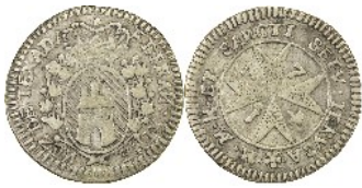
1908. MALTA: Francisco Ximenez de Texada, 1773-1775, AR 2 tari (1.91g), 1774, KM-290, VF $100 - 120