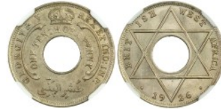
1621. BRITISH WEST AFRICA: George V , 1910-1936, 1/10 penny, 1926, KM-7, NGC graded MS66 $50 - 60