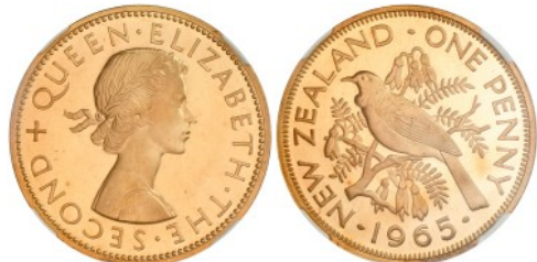
2090. NEW ZEALAND: Elizabeth II , 1952-, penny, 1965, KM-24.2, mintage of only 10 pieces, VIP Proof Record specimen, NGC graded PF65 Red Cameo, RRR $850 - 1,000