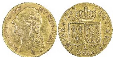
1820. FRANCE: Louis XVI , 1774-1792, AV louis d'or (7.62g), Paris, 1787-A, KM-591.1, VF $400 - 450