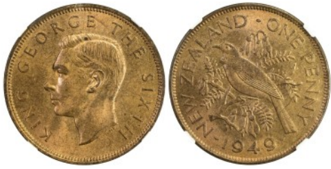
2080. NEW ZEALAND: George VI , 1937-1952, penny, 1949, KM-21, NGC graded MS65 RB $80 - 100