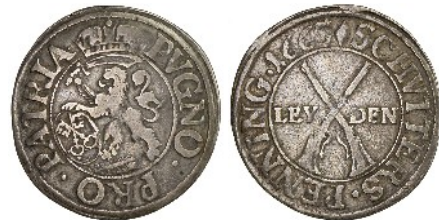
1918. LEYDEN: AR shooting penny (4.53g), 1665, Peltzer-2097, lion with shield / crossed rifles, VF $120 - 150