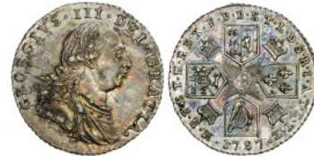
1849. GREAT BRITAIN: George III , 1760-1820, AR 6 pence, 1787, KM-606.2, iridescent and lustrous, UNC $90 - 110