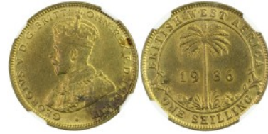
1653. BRITISH WEST AFRICA: George V, 1910-1936, shilling, 1936-H, KM-12a, NGC graded MS63 $100 - 130