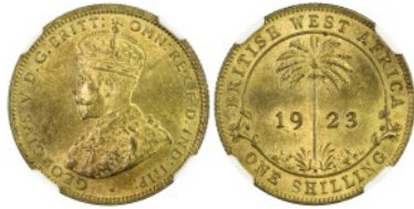
1648. BRITISH WEST AFRICA: George V, 1910-1936, shilling, 1923-H, KM-12a, NGC graded MS63 $100 - 140