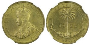
1650. BRITISH WEST AFRICA: George V, 1910-1936, shilling, 1925, KM-12a, superb quality for this type, NGC graded MS65 $160 - 200