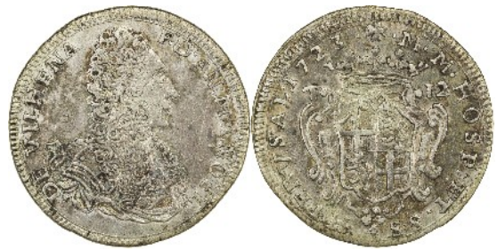
1891. MALTA: Antonio Manoel de Vilhena , 1722-1736, AR 12 tari (scudo) (13.65g), 1723, KM-180, bold strike, lovely VF-EF, R $900 - 1,100