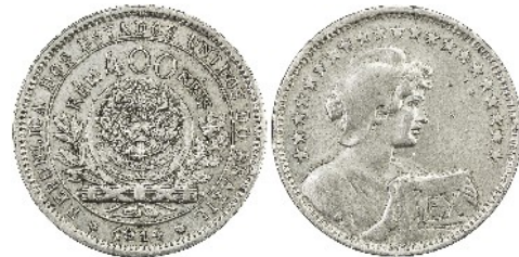
1954. BRAZIL: 400 reis, 1914, KM-515, Y-A14, long neck variety, choice EF $220 - 300

This issue is considered a pattern by some authorities.