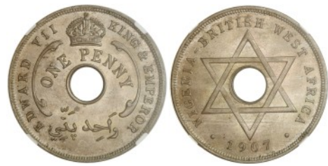
1620. BRITISH WEST AFRICA: Edward VII , 1901-1910, penny, 1907, KM-2, NGC graded MS64 $50 - 60