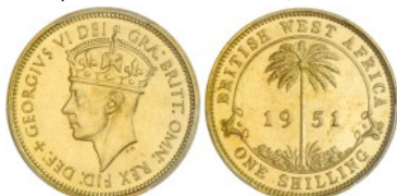
1673. BRITISH WEST AFRICA: George VI, 1937-1952, shilling, 1951-KN, KM-28, specimen strike, PCGS graded Specimen 65, RR, ex King's Norton Mint Collection $250 - 325

This type was never released into circulation, and it is reported that only 167 pieces escaped the melting pot in New Jersey.