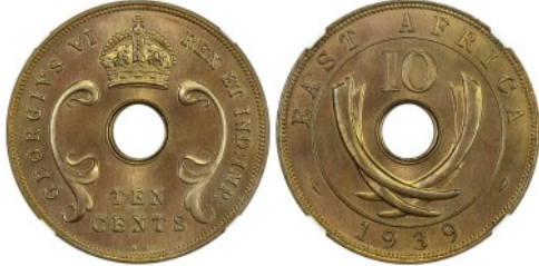
1615. BRITISH EAST AFRICA: George VI , 1937-1952, 10 cents, 1939-KN, KM-26.1, attractive example, NGC graded Specimen 64 Red Brown, R $150 - 200