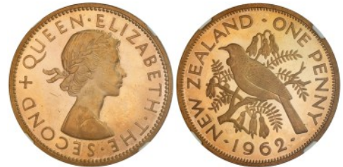
2088. NEW ZEALAND: Elizabeth II , 1952-, penny, 1962, KM-24.2, VIP Proof Record specimen, NGC graded PF64 Red Cameo $500 - 650