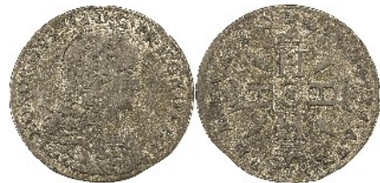
1917. MONACO: Honore III, 1733-1795, BI 3 sols (4.15g), 1734, KM-85, VF $240 - 300