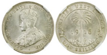
1644. BRITISH WEST AFRICA: George V, 1910-1936, AR shilling, 1916-H, KM-12, NGC graded MS63 $110 - 150