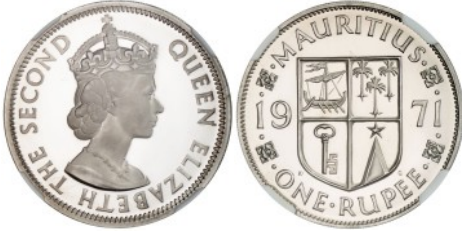
1722. MAURITIUS: Elizabeth II , 1952-1987, rupee, 1971, KM-35.1, finest known (population 1), NGC graded PF69 Ultra Cameo $200 - 250