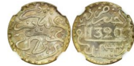
1731. MOROCCO: Abd al-Aziz , 1894-1908, AR 1/20 rial, London, AH1320, Y-18.1, appealing iridescent toning, NGC graded MS62 $130 - 170