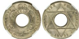
1622. BRITISH WEST AFRICA: George V , 1910-1936, 1/10 penny, 1933, KM-7, NGC graded MS66 $50 - 60