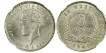
1663. BRITISH WEST AFRICA: George VI , 1937-1952, 3 pence, 1940-KN, KM-21, NGC graded MS64 $100 - 120