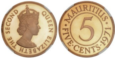
1721. MAURITIUS: Elizabeth II , 1952-1987, 5 cents, 1971, KM-34, NGC graded PF67 Red Ultra Cameo $70 - 90