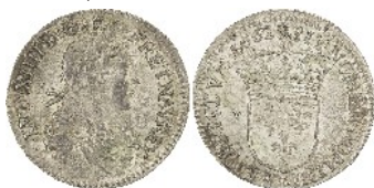
1824. FRANCE: Louis XIV , 1643-1715, AR ½ écu (13.57g), Limoges, 1655-I, KM-199.5, few adjustment marks, AU, R $180 - 220