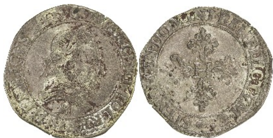
1822. FRANCE: Henri III , 1574-1589, AR franc (13.66g), Toulouse, 1582-M, Dupl-1130a, entitled King of France and Poland, EF $250 - 350