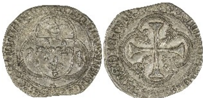
1821. FRANCE: Louis XII , 1498-1515, AR blanc de Bretagne (2.62g), Rennes, Dy-666, arms of France / cross pattée, slightly irregular flan, lovely strike, VF-EF $170 - 200