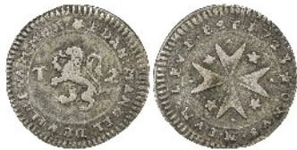
1888. MALTA: Antonio Manoel de Vilhena , 1722-1736, AR 2 tari (2.24g), 1723, KM-178, lion rampant / Maltese cross, VF $100 - 120