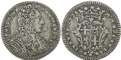
1889. MALTA: Antonio Manoel de Vilhena , 1722-1736, AR 4 tari (4.53g), 1723, KM-170, VF $200 - 260