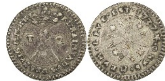
1892. MALTA: Ramon Despuig , 1736-1741, AR 2 tari (2.35g), 1737, KM-201, arms of Despuig / Maltese cross, VF $180 - 220