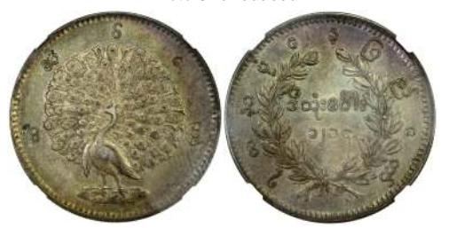
This is the finest example we have handled of this rare type. Photo size reduced

BURMA: Mindon, 1853-1878, AR kyat (rupee), CS1214 (1853), KM-10, peacock, NGC graded AU58 $100 - 150