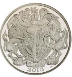
2411. GREAT BRITAIN: Elizabeth II, 1952-, AR 5 pounds, 2013, KM-—, piéfort, mintage of 2,700, NGC graded PF70 Ultra Cameo