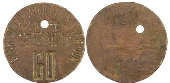
2063. BURMA: brass token (16.47g), Chinese Bank of Communications Rangoon, large number 60 at bottom, Chinese text in center, uniface, pierced for hanging, VF, R ex Wéiduoliya Collection $80 - 100