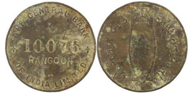
2064. BURMA: AE token (26.46g), The Central Bank of India Limited Rangoon, with incuse number 10076 / bank symbol, Bengali text around, much light encrustation, F-VF, RRR ex Wéiduoliya Collection $80 - 100