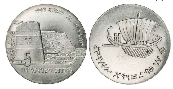
2087. ISRAEL: AR 5 lirot (Rome), 1963, KM-39, 15th Anniversary of Independence-Seafaring, ancient ship, Brilliant UNC $80 - 100