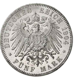
2336. LÜBECK: AR 5 mark, 1904-A, KM-213, J-83, superb prooflike surfaces, choice Brilliant UNC $1,200 - 1,600