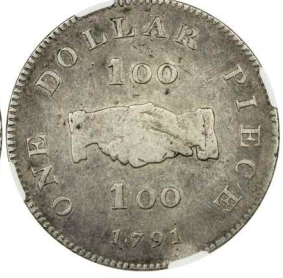
2257. SIERRA LEONE: AR 100 cents, 1791, KM-6, lion / handshake, struck in Birmingham by James Watt, NGC graded VF20, R $900 - 1,100