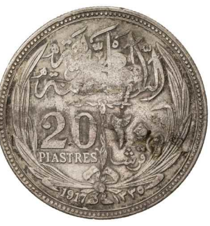
NEJD: AR 20 girsh, KM-X12.3, fantasy countermark, on 20 qirsh of Egypt, 1916/AH1335, slight weakness in counterstamp, VF