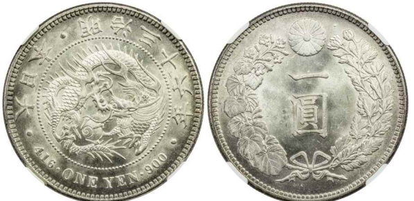
2097. JAPAN: AR yen, Meiji 36 (1903), Y-A25.3, NGC graded MS65