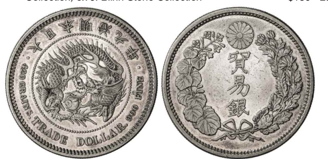
2096. JAPAN: AR trade dollar, Meiji year 9 (1876), KM-14, JSDA-01-12, lustrous surfaces, choice AU