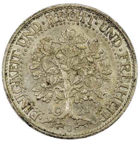
2345. GERMANY: Weimar Republic , AR 5 mark, 1931-J, KM-56, Jaeger-331, oak tree, AU $100 - 15

2346. GERMANY: LOT of 8 coins, Prussia 1856-A 2½ groschen AU, Prussia 1829 taler VF, Saxe-Meissen 1324-49 AR groschen VF, Saxony 1827 1/6 taler AU, Westphalia 1813 10 centimes VF, Saarland 1954 10 franken essai AU-UNC and 1954 20 franken essai AU-UNC, East Germany 1974 AR 10 mark Friedrich AU rim nick, retail value $325, lot of 8 coins $150 - 250