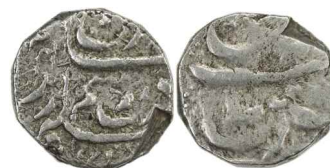
1125. JIND: Raghbir Singh, 1864-1877 , AR rupee (10.96g), "Sahrind", VS[19]24, KM-5, SS—, Temple-19/20, struck from worn dies, Fine, R $100 - 120