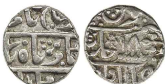
1122. JHALAWAR: AR rupee (11.19g), year 18, Cr-28, in the name of Bahadur Shah, EF $80 - 100