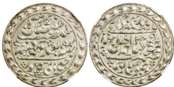
1119. JAIPUR: Madho Singh II, 1880-1922 , AR nazarana rupee, Sawai Jaipur, 1903 year 24, KM-147, NGC graded MS62 $140 - 180