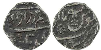
1124. JIND: Sarup Singh, 1837-1864 , AR rupee (10.54g), "Sahrind", VS(18)93, KM—, SS-277, Temple-21var, rosette of 6 dots within the S of jalus , VF, R $250 - 300 Struck from the coronation nazarana rupee die (reference: Fitzwilliam Collection CM.IN.1267-R).