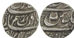
1128. KAITHAL: Bhai Lal Singh, 1781-1819 , AR rupee (11.10g), "Sahrind", ND, KM-10, SS-291, in name of Durrani Ahmad Shah, group of 4 pellets below S of jalus , lovely strike, EF, R $200 - 250