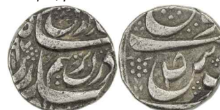
1127. KAITHAL: Bhai Lal Singh, 1781-1819 , AR rupee (11.18g), "Sahrind", AH1197, KM-10, SS-291, in name of Durrani Ahmad Shah, group of 4 pellets below S of jalus , bold strike, choice VF, RR $250 - 350

Ranbir Singh is known for his machine-struck nazarana rupee dated VS1993 honoring his 50th year of reign. This piece was struck from the nazarana dies for his coronation 49 years earlier, and is believed to be unique, published here for the first time.