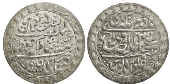
1120. JAIPUR: Madho Singh II, 1880-1922 , AR nazarana rupee (11.34g), Sawai Jaipur, 1913 year 34, KM-147, choice AU $100 - 150