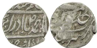
1123. JIND: Gajpat Singh, 1764-1789 , AR rupee (11.03g), "Sahrind", ND, KM-1, SS-271, Temple-15, with Kalgi plume below the S of jalus , struck from worn reverse die, VF, R $120 - 150