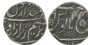
1126. JIND: Ranbir Singh, 1887-1949 , AR rupee (10.88g), "Sahrind", VS1944, KM—, SS—, Temple—, annulet within the S of jalus , lovely bold strike, EF, RRR $400 - 500

Ranbir Singh is known for his machine-struck nazarana rupee dated VS1993 honoring his 50th year of reign. This piece was struck from the nazarana dies for his coronation 49 years earlier, and is believed to be unique, published here for the first time.