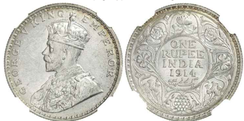
1570. BRITISH INDIA: George V, 1910-1936, AR rupee, 1914(b), KM-524, S&W-8.27, NGC graded MS61 $60 - 80