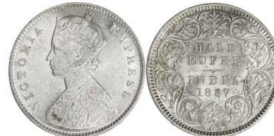
1551. BRITISH INDIA: Victoria , Empress, 1876-1901, AR 1/2 rupee, 1887-C, KM-491, A/I, C incuse, AU $110 - 130