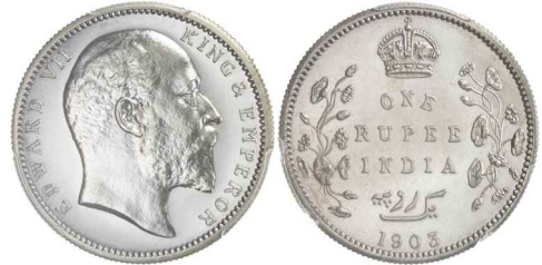
1560. BRITISH INDIA: Edward VII , 1901-1910, AR rupee, 1903(c), KM-508, S&W-7.15, proof restrike, PCGS graded MS63 $1,500 - 2,000

Known as a "lakh" error in India, based on the assumption that 1 piece in 100,000 is a brockage!