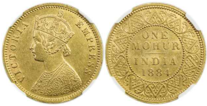
1552. BRITISH INDIA: Victoria , Empress, 1876-1901, AV mohur, 1884(c), KM-496, NGC graded MS62 $2,500 - 3,500