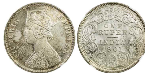
1550. BRITISH INDIA: Victoria , Empress, 1876-1901, AR rupee, 1901-C, KM-492, NGC graded MS65 $120 - 160