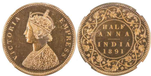
1538. BRITISH INDIA: Victoria , Empress, 1876-1901, AE 1/2 anna, 1891(c), KM-487, restrike, NGC graded MS63 RD $350 - 400