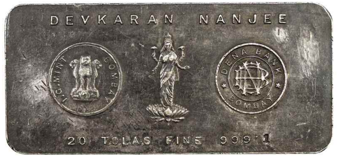
1674. INDIA: Devkaran Nanjee / Dena Bank , AR rectangular 20 tolas (235g), ND, KM-X15, 999.1 fineness, symbols of IG Mint, Bombay, and Dena Bank, uniface, EF $200 - 300