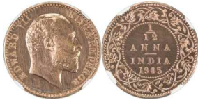
1554. BRITISH INDIA: Edward VII , 1901-1910, AE 1/12 anna, 1905(c), KM-497, restrike, NGC graded PF64 RD $200 - 300