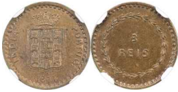
1669. PORTUGUESE INDIA: Luis I , 1861-1889, AE 3 reis, 1871, KM-301, NGC graded MS63 RB $125 - 175