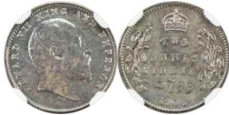
1557. BRITISH INDIA: Edward VII , 1901-1910, AR 2 annas, 1906(c), KM-505, restrike, NGC graded Proof 65 $200 - 300