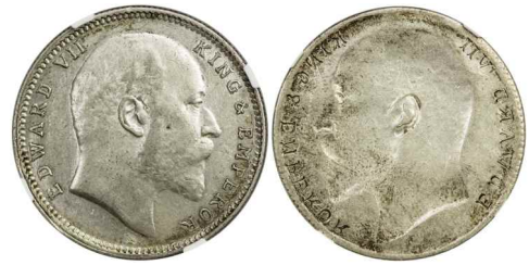
1559. BRITISH INDIA: Edward VII , 1901-1910, AR rupee, ND, KM-508, obverse brockage error with partial collar, NGC graded AU53 $400 - 600

Known as a "lakh" error in India, based on the assumption that 1 piece in 100,000 is a brockage!