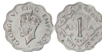
1576. BRITISH INDIA: George VI, 1937-1947, anna, 1940(c), KM-537, S&W-9.161, proof restrike, short trefoils on king's crown, PCGS graded Proof 63 $300 - 400