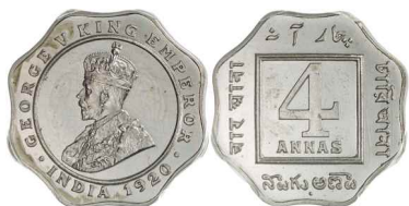
1565. BRITISH INDIA: George V, 1910-1936, 4 annas, 1920(b), KM-519, S&W-8.189, proof restrike, PCGS graded Proof 62 $400 - 600