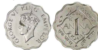
1577. BRITISH INDIA: George VI, 1937-1947, anna, 1946(c), KM-538, S&W-9.185, proof restrike, short trefoils on king's crown, PCGS graded Proof 63 $300 - 400