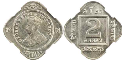
1563. BRITISH INDIA: George V , 1910-1936, copper-nickel 2 annas, 1918(c), KM-516, NGC graded MS63 $100 - 150