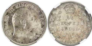
1558. BRITISH INDIA: Edward VII , 1901-1910, AR 1/4 rupee, 1906(c), KM-506, restrike, NGC graded Proof 65 $250 - 350