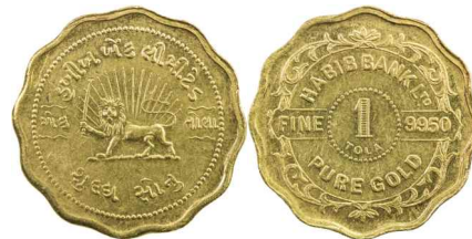
1678. INDIA: Habib Bank , AV tola (11.68g), ND, KM-X55, 995 fineness, scalloped edge, English / Gujarati legends, AU $550 - 650