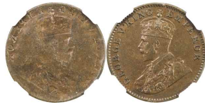
1561. BRITISH INDIA: George V , 1910-1936, AE 1/4 anna, ND (1912-36), KM-512, obverse brockage error, NGC graded AU55 BR $300 - 400

So called "lakh" error in India, on the theory that one in 100,000 is a brockage strike.