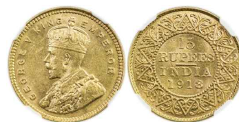
1571. BRITISH INDIA: George V, 1910-1936, AV 15 rupees, 1918(b), KM-525, NGC graded MS62 $2,500 - 3,000