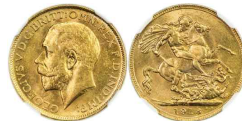
1572. BRITISH INDIA: George V, 1910-1936, AV sovereign, 1918-I, KM-525A, NGC graded MS64 $375 - 425