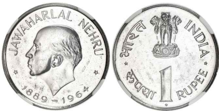
1673. INDIA: 1 rupee , 1964(b), KM-76, Death of Jawaharlal Nehru, NGC graded Proof 63 $150 - 200