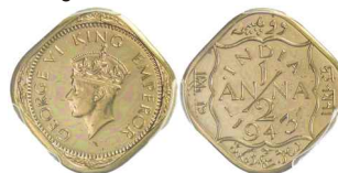
1574. BRITISH INDIA: George VI, 1937-1947, ½ anna, 1943(c), KM-534, S&W-9.201, proof restrike, PCGS graded Proof 64 $400 - 500