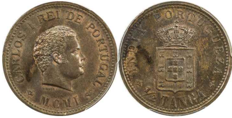
1668. PORTUGUESE INDIA: Carlos I , 1889-1908, AR ½ tanga, 1901, KM-16, PCGS graded MS63 BR $150 - 200