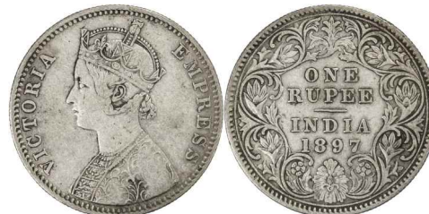
1549. BRITISH INDIA: Victoria , Empress, 1876-1901, AR rupee, 1897-C, KM-491, C/I, incuse mintmark, F-VF, RR $750 - 850