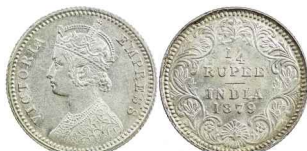
1545. BRITISH INDIA: Victoria , Empress, 1876-1901, AR 1/4 rupee, 1879-C, KM-490, S&W-6.255a, type C, II, NGC graded MS63 $100 - 150