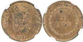
1670. PORTUGUESE INDIA: Luis I , 1861-1889, AE 5 reis, 1871, KM-303, couple small corrosion spots, NGC graded UNC details $100 - 150