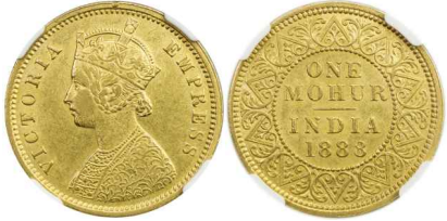
1553. BRITISH INDIA: Victoria , Empress, 1876-1901, AV mohur, 1888(c), KM-496, NGC graded AU55 $2,500 - 3,500