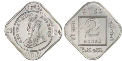
1564. BRITISH INDIA: George V , 1910-1936, 2 annas, 1934(c), KM-516, S&W-8.265, proof restrike, very rare date of this type for the restrikes, PCGS graded Proof 63 $400 - 600