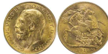
1573. BRITISH INDIA: George V, 1910-1936, AV sovereign, 1918-I, KM-525a, PCGS graded MS64 $400 - 500