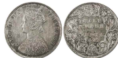
1548. BRITISH INDIA: Victoria , Empress, 1876-1901, AR 1/2 rupee, 1893-B, KM-491, S&W-6.220, B incuse, EF $130 - 170