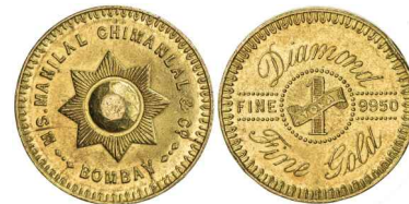
1677. INDIA: M/S. Manilal Chimanlal & Co. AV tola (11.65g), ND, KM-X45, "Diamond Fine Gold", 995 fineness, sun with rays / denomination, AU $550 - 650