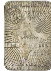
1675. INDIA: M/S Manilal Chimanlal & Co. AR rectangular 10 tolas (118g), ND, KM-X33, 999 fine silver, map of India, text in English & Gujarati, uniface, iridescent toning, AU $130 - 200