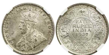
1567. BRITISH INDIA: George V, 1910-1936, AR ½ rupee, 1927(c), KM-522, NGC graded MS65 $150 - 200