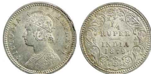
1544. BRITISH INDIA: Victoria , Empress, 1876-1901, AR 1/4 rupee, 1879-C, KM-490, S&W-6.255a, type C, II, NGC graded MS63 $100 - 150