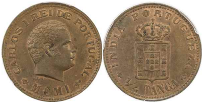
1667. PORTUGUESE INDIA: Carlos I , 1889-1908, AR ¼ tanga, 1901, KM-15, PCGS graded MS63 BR $150 - 200