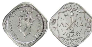
1575. BRITISH INDIA: George VI, 1937-1947, ½ anna, 1946(c), KM-535, S&W-9.210, proof restrike, PCGS graded Proof 63 $400 - 500