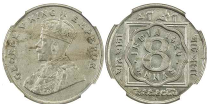
1566. BRITISH INDIA: George V, 1910-1936, 8 annas, 1920(b), KM-520, very rare date, surface hairlines, NGC graded AU details, RRR $1,000 - 1,500