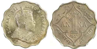
1556. BRITISH INDIA: Edward VII , 1901-1910, ANNA, 1907-B, KM-504, S&W-7.144, PCGS graded MS64 $120 - 160