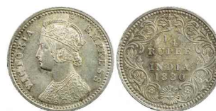
1546. BRITISH INDIA: Victoria , Empress, 1876-1901, AR 1/4 rupee, 1880-C, KM-490, S&W-6.257, type C, II, NGC graded MS64 $100 - 150