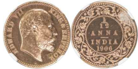
1555. BRITISH INDIA: Edward VII , 1901-1910, AE 1/12 anna, 1906(c), KM-497, restrike, NGC graded PF63 RD $200 - 300