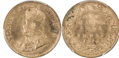
1562. BRITISH INDIA: George V , 1910-1936, 1/4 anna, 1916(c), KM-512, rare date, PCGS graded MS64 RD, R $200 - 300

So called "lakh" error in India, on the theory that one in 100,000 is a brockage strike.