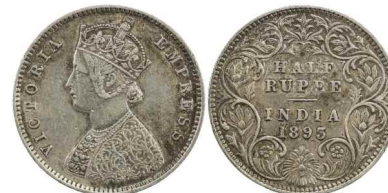
1547. BRITISH INDIA: Victoria , Empress, 1876-1901, AR 1/2 rupee, 1893-B, KM-491, EF $120 - 160