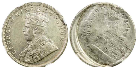
1568. BRITISH INDIA: George V, 1910-1936, AR rupee, ND, KM-524, obverse mirror brockage error with partial collar, NGC graded MS62 $500 - 600

Known as a "lakhi" error in India, based on the assumption that 1 piece in 100,000 is a brockage!