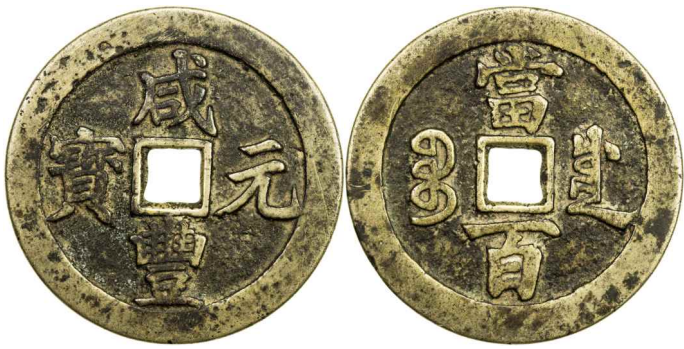
664. QING: Xian Feng , 1851-1861, AE 100 cash, Chengdu mint, Sichuan Province, H-22.981, 56mm, cast 1853-54, brass ( huáng tóng ) color, VF $75 - 100