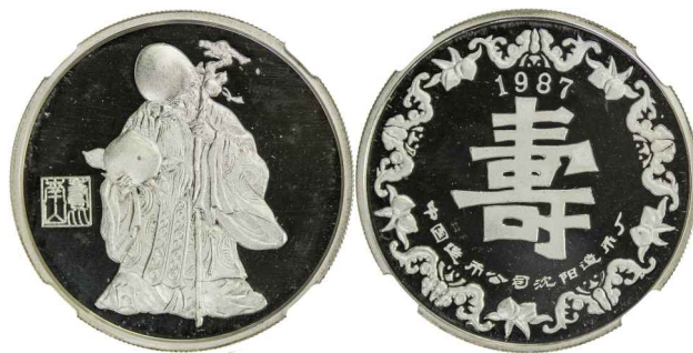
810. CHINA (PEOPLE'S REPUBLIC): AR medal , 1987, 40mm, Official Mint Medal "Shou Xing - God of Longevity", NGC graded PF68 Ultra Cameo $200 - 300