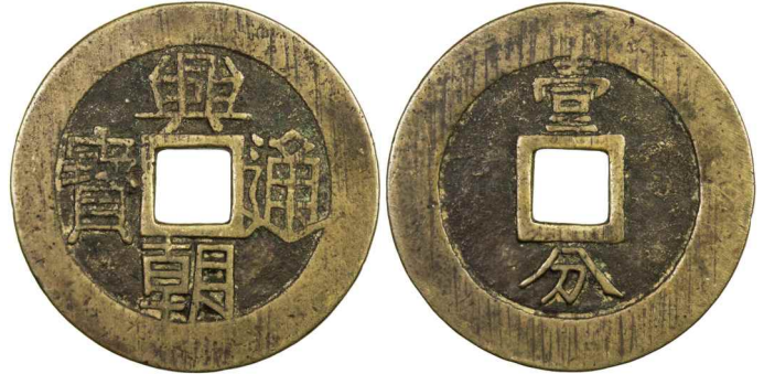
621. NAN MING: Xing Chao , 1648-1657, AE 10 cash (19.88g), H-21.13, 46mm, yi fen on reverse, F-VF $75 - 100

Li Tzu-ch'eng was the son of a village leader in Shansi. After a period of famine and high taxation, Li and his followers revolted. The end of the Ming Dynasty came in 1644 when Li succeeded in taking Peking. He assumed the reign title Yong Chang and declared himself emperor, upon which Chuang Lieh, the last Ming emperor, committed suicide.