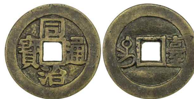
703. QING: Tong Zhi , 1862-1874, AE charm (5.58g), Taiwan Province, CCH-326, Vol II, Burger 2016 p.160, tai in Chinese & Manchu on reverse, "poem cash" privately made later casting, smooth rim casting, VF $75 - 100

The obverse of this charm contains the first "nian hao" (reign title) of Tong Zhi. Very few coins minted with this reign title were produced and none were officially put into circulation. Likely a later Min Guo period (Republic era) production.