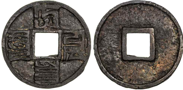
601. YUAN: Da Yuan , 1310-1311, AE 10 cash (23.07g), H-19.46, ta üen tong baw in Mongol 'Phags-pa script, VF-EF $75 - 100

Külüg Khan (Da Yuan), born Khayishan, meaning "wall" in Mongolian, was an Emperor of the Yuan Dynasty, and is regarded as the seventh Great Khan of the Mongols in Mongolia. His name means "warrior Khan" or "fine horse Khan" in the Mongolian language.