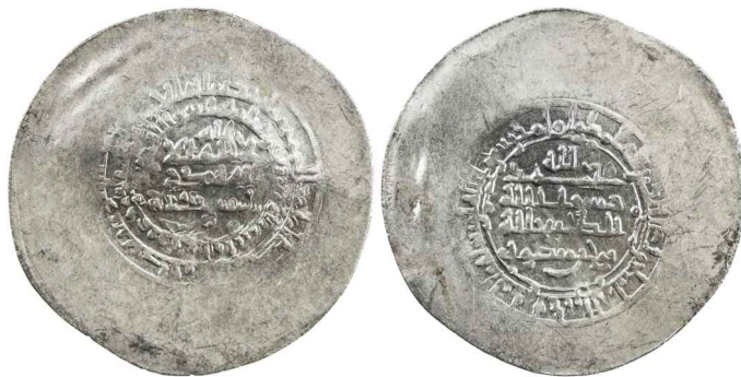
412. SAMANID: Nuh III , 976-997, AR multiple dirham, Warwarliz, AH370, A-1469W, 48mm, 9.54g, SNAT-1252 (same dies), citing Fa'iq & the caliph al-Ta'i', excellent strike, choice EF, RR $200 - 250

Muling of normal AH389 reverse 'Abd al-Malik II with old reverse of Nuh III, citing al-Wali Husam al-Dawla, used AH372-375.