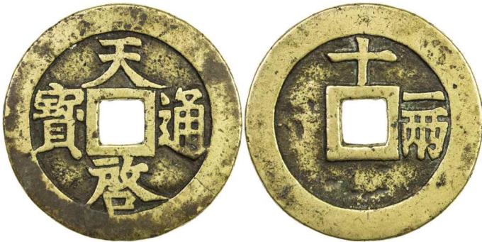
618. MING: Tian Qi , 1621-1627, AE 10 cash, H-20.229, 48mm, shi (10 [cash]) above, yi liang at right on reverse, VF $75 - 100 Photo size reduced.