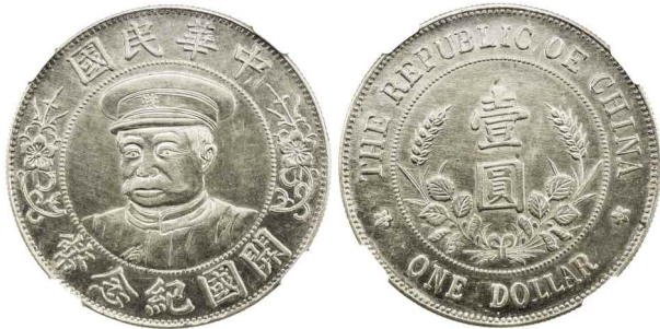
733. CHINA: AR dollar, ND (1912), Y-320.1, L&M-44, Li Yuan Hung portrait, "OE" instead of "OF" in REPUBLIC OF CHINA, a lovely example of this rare variety, NGC graded AU58 $8,000 - 10,000

A scarce coin that appears on the market infrequently in this wonderful high-graded condition.