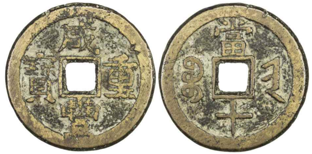
660. QING: Xian Feng , 1851-1861, AE 10 cash, Taiyuan mint, Shanxi Province, H-22.941, Burger-9-30a-4-10, 44mm, cast 4th year (1854), brass ( huáng tóng ) color, Fine $75 - 100