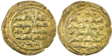
467. GHAZNAVID: Ibrahim , 1059-1099, AV dinar (3.61g), NM, ND, A-1637, nice strike $125 - 150