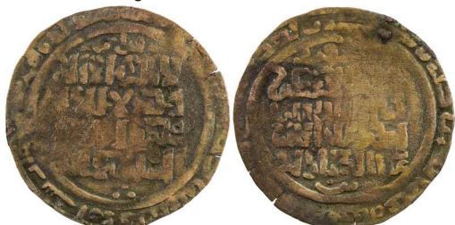
434. QARAKHANID: 'Abd al-Khaliq , fl. 1178-1179, AE dirham (3.34g), Samarqand, AH574, A-3401T, Koch-1065, very clear mint & date, with full rulers name 'abd al-khaliq , VF, RRR $140 - 180