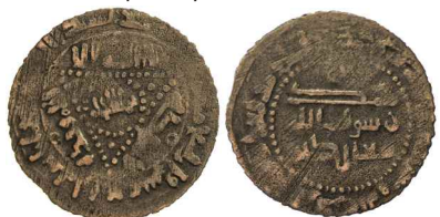
432. QARAKHANID: 'Ali b. al-Hasan , 1020-1025, AE fals (2.05g), Bukhara, AH414, A-3346, Zeno-112005, ruler cited as Baha al-Dawla Yanghâ Tegin, VF $100 - 125