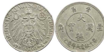
814. KIAUCHAU: Wilhelm II , 1898-1914, 10 cents, 1909, Y-2, Choice EF $100 - 150