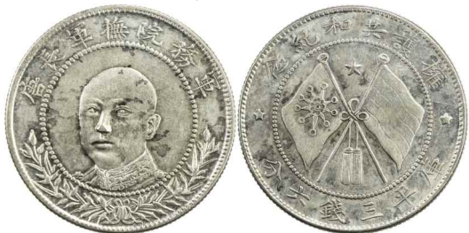
807. YUNNAN: AR 50 cents , ND (1919), KM-479, L&M-863, portrait of Tang Chi Yao / flags, choice EF $80 - 100