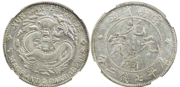
804. YUNNAN: Kuang Hsu , 1875-1908, AR dollar, ND (1908), Y-254, L&M-418, NGC graded AU58 $800 - 1,000