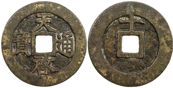
616. MING: Tian Qi , 1621-1627, AE 10 cash, H-20.226, 46mm, on reverse shi (10 [cash]) above, VF $100 - 150 Photo size reduced.