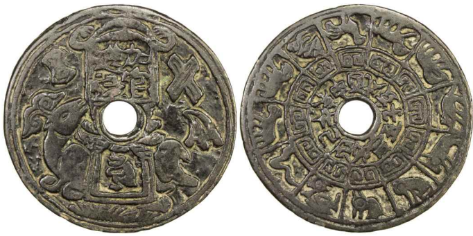
608. YUAN: AE charm, S-73, CCH-1003., 59mm, capped board with "A respectful official is promoted" with a monkey on the lower portion, sycee at upper left, below deer nibbling on the leaves of the felicitous herb of immortality / Rat, Ox, Tiger, Rabbit, Dragon, Snake, Horse, Sheep, Monkey, Rooster, Dog and Pig, the animals of the Chinese zodiac with zi chou yin mao chen si wu wei shen you xu hai around central hole, VF, R $200 - 300