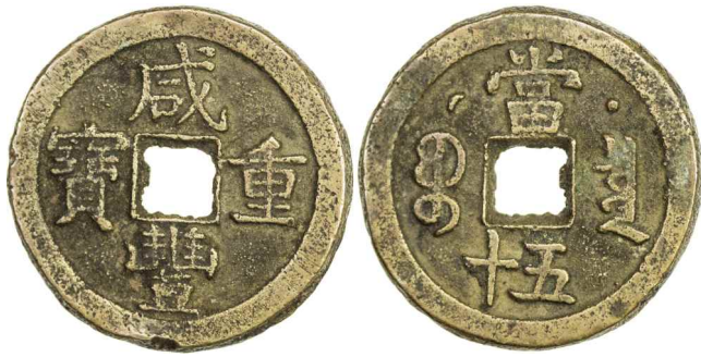
632. QING: Xian Feng , 1851-1861, AE 50 cash, Board of Revenue mint, Peking, H-22.716, Prince Qing Hui mint, 'sun & moon' above, cast May-August 1854, brass ( huáng tóng ) color, attractive VF $100 - 150

From an old German collection with price paid as 3 Reichsmark, purchased July 25, 1913.