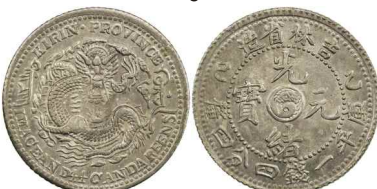
774. KIRIN: Kuang Hsu , 1875-1908, AR 20 cents, CD1903, Y-181a, L&M-559, EF-AU, ex Daniel Ching Collection $100 - 125