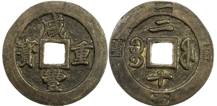
647. QING: Xian Feng , 1851-1861, AE 20 cash, Fuzhou mint, Fujian Province, H-22.794, 46mm, yi liang ji zhong incuse on rim, cast 1853-55, copper ( tóng ) color, VF $300 - 400