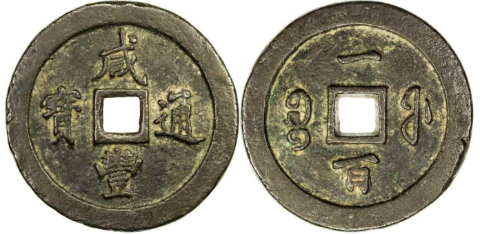
645. QING: Xian Feng , 1851-1861, AE 100 cash, Fuzhou mint, Fujian Province, H-22.784, 71mm, cast 1853-55, copper ( tóng ) color, VF $1,500 - 1,700