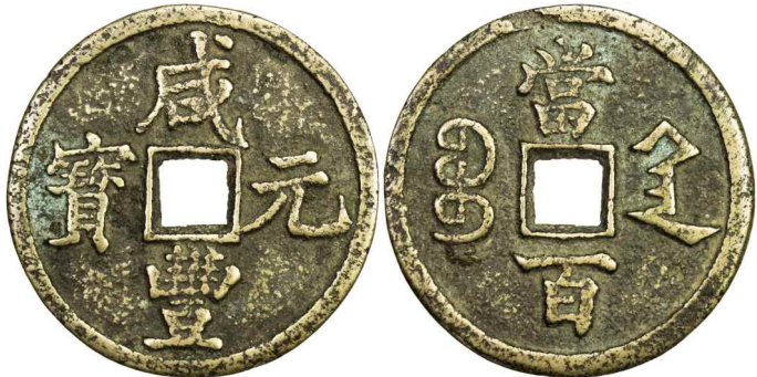
665. QING: Xian Feng , 1851-1861, AE 100 cash, Xi'an mint, Shaanxi Province, H-22.959, Burger-9-34-4(1)-100, 59mm, large flan type, cast 4th year (1854), brass ( huáng tóng ) color, F-VF $75 - 100