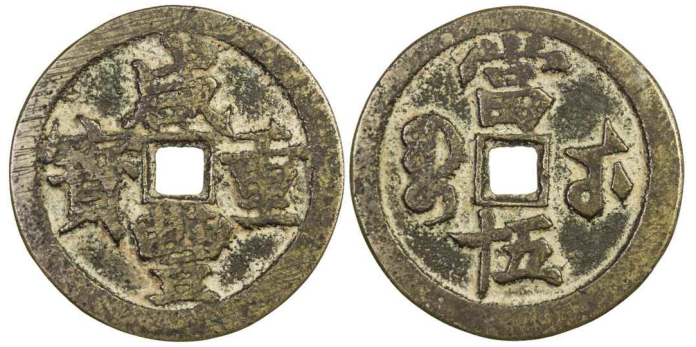
652. QING: Xian Feng , 1851-1861, AE 50 cash, Wuchang mint, Hubei Province, H-22.876, Burger-9-40a-7-50, 46mm, cast 7th year (1857), brass ( huáng tóng ) color, Fine $75 - 100