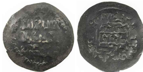
436. QARA-KHITAY IN BALKH: Sanjar Qadir Tafghaj Khan , 1177-1186, AE dirham (4.00g), NM, ND, A-A1523, with sanjar bin / tafgha(j) khan in reverse center, fancy floral border around the obverse, caliph al-Mustadi, nice strike, undoubtedly struck at Balkh, possibly unpublished, lovely VF $150 - 175