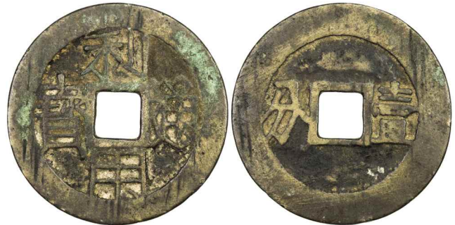
622. NAN MING: Li Yong , 1674-1678, AE 10 cash, H-21.99, yi fen either side on reverse, Fine, S $100 - 150

Coins cast by the rebel Prince of Zhou, Wu Sangui, bear the inscription li yong (profitable use) instead of a reign title as Wu Sangui did not declare himself emperor until March of 1678 when he took the nien hao (reign title) of Zhao Wu, but he died in October 1678 of dysentery and no coins bearing the new title were cast.