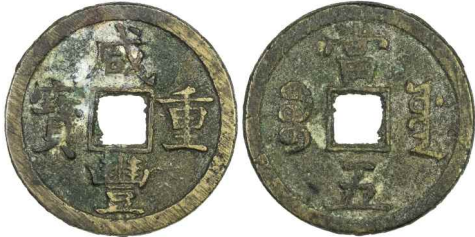
625. QING: Xian Feng , 1851-1861, AE 5 cash, Board of Works mint, Peking, H-22.750, New branch mint, cast 1854-57, large size, VF-EF $75 - 100