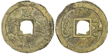
649. QING: Xian Feng , 1851-1861, AE cash, Kaifeng mint, Henan Province, H-22.844, small characters, cast 1854-55, Fine, S $75 - 100