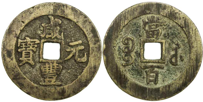
659. QING: Xian Feng , 1851-1861, AE 100 cash, Suzhou mint, Jiangsu Province, H-22.917, 60mm, brass ( huáng tóng ), cast 1854-55, F-VF $75 - 100