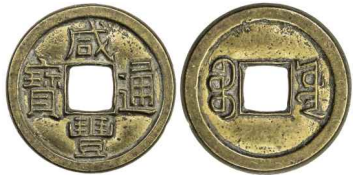
634. QING: Xian Feng , 1851-1861, AE cash (3.27g), Board of Works mint, Peking, H-22.744, Old branch mint, cast 1853-57, mu qián (mother coin), VF-EF, RR $700 - 900