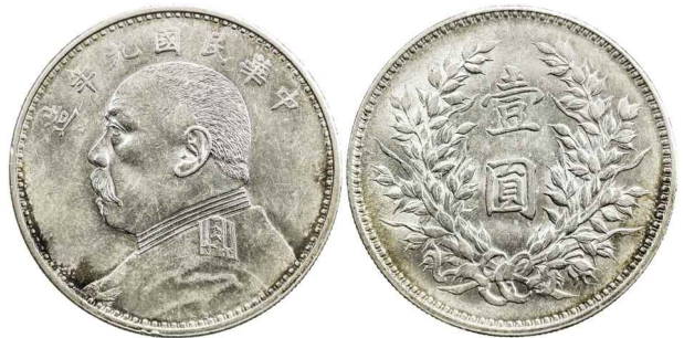
738. CHINA: AR dollar (26.87g), year 9 (1920), Y-329, L&M-79, Yuan Shih Kai series, choice AU $150 - 200