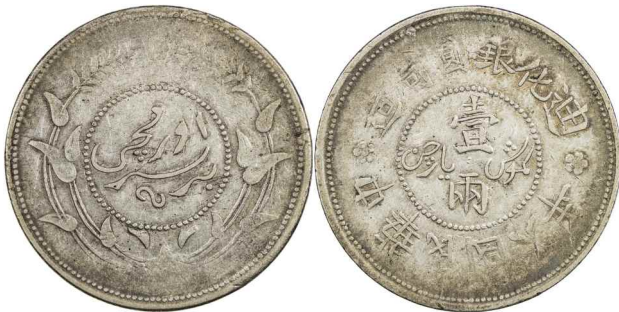
798. SINKIANG: AR sar (34.96g), Urumqi, year 6 (1917), Y-45, L&M-837, EF $200 - 240