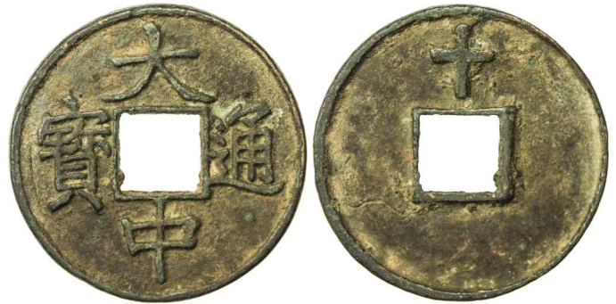
612. MING: Da Zhong, 1361-1368, AE 10 cash (19.27g), H-20.45, small shi above on reverse, a superb quality example! EF $150 - 250