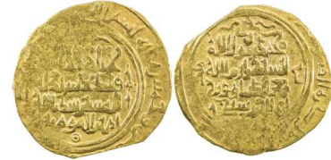
472. GREAT SELJUQ: Sanjar , 1118-1157, AV dinar (2.76g), NM, AH51x, A-1687, caliph al-Mustarshid, slightly pale gold, decent VF $100 - 125