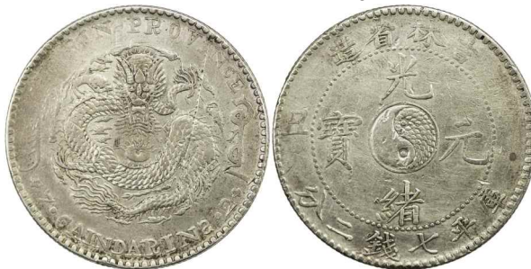
778. KIRIN: Kuang Hsu , 1875-1908, AR dollar, CD1901, Y-183a.1, L&M-536, dragon type 1 (large scales, horns curved), obverse scratch, VF, S $250 - 350