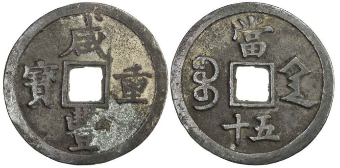
662. QING: Xian Feng , 1851-1861, AE 50 cash, Xi'an mint, Shaanxi Province, H-22.958, 52mm, dark toned brass ( huáng tóng ), cast 1854-55, VF $100 - 150