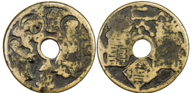
599. SONG: AE charm (15.28g), CCH-1377var, Vol II, Tiger headed script charm, rarely encountered type, VF $75 - 100