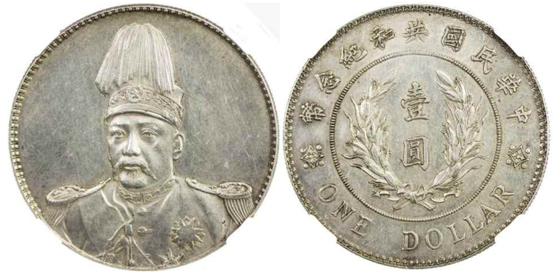
735. CHINA: AR dollar, ND (1914), Y-322.1, L&M-858, honoring Yuan Shih Kai as a founder of the Republic, facing bust of Yuan Shih Kai in military attire and tall, plumed hat / value within wreath, NGC graded AU55 $1,200 - 1,400