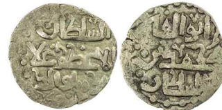
474. KHWARIZMSHAH: Muhammad , 1200-1220, pale AV dinar (4.12g), NM, ND, A-1713, Mitch-911, Kanauj style, average about 40% gold, the rest mainly silver, VF $100 - 150