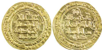
469. GREAT SELJUQ: Tughril Beg , 1038-1063, AV dinar (2.89g), Madinat al-Salam, AH449, A-1665, Jafar-S.MS.449B, narrow flan, EF-AU, R $200 - 240