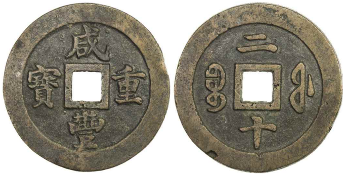
648. QING: Xian Feng , 1851-1861, AE 20 cash, Fuzhou mint, Fujian Province, H-22.798, 47mm, zhong bao type, copper ( tóng ) issue, cast 1853-55, VF $100 - 150

From an old German collection with price paid as 2½ Reichsmark.