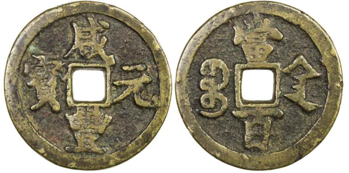
661. QING: Xian Feng , 1851-1861, AE 100 cash, Xi'an mint, Shaanxi Province, H-22.950, Burger-9-34-5(2)-100, 49mm, cast 5th year (1855), brass ( huáng tóng ) color, Fine $75 - 100