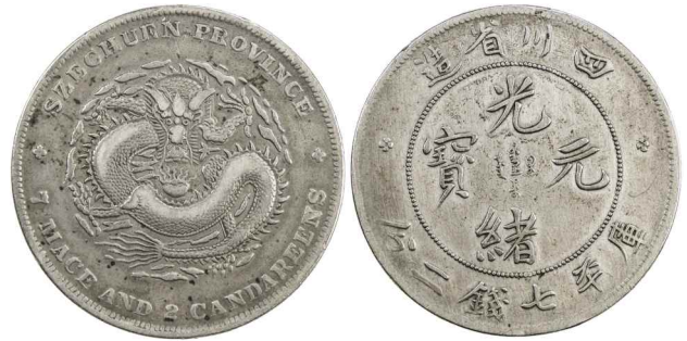
799. SZECHUAN: Kuang Hsu , 1875-1908, AR dollar, ND (1901-1908), Y-238, L&M-345, dragon with narrow head, excessive surface hairlines, NGC graded VF details $200 - 300