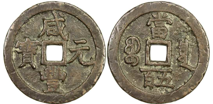
630. QING: Xian Feng , 1851-1861, AE 500 cash, Board of Revenue mint, Peking, H-22.712, Burger-9-1-4(4)-500, 58mm, West branch mint, cast March to August 1854, copper ( tong ) color, Fine $75 - 100

From an old German collection with price paid as 2 Reichsmark. Photo size reduced.