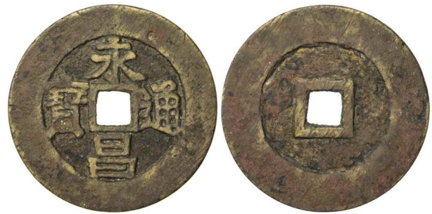
620. NAN MING: Yong Chang , 1644-1645, AE 5 cash (14.88g), H-21.4, 'er shu' yong , broad rims, Fine $75 - 100

Li Tzu-ch'eng was the son of a village leader in Shansi. After a period of famine and high taxation, Li and his followers revolted. The end of the Ming Dynasty came in 1644 when Li succeeded in taking Peking. He assumed the reign title Yong Chang and declared himself emperor, upon which Chuang Lieh, the last Ming emperor, committed suicide.