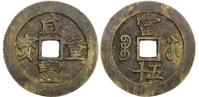
654. QING: Xian Feng , 1851-1861, AE 50 cash, Suzhou mint, Jiangsu Province, H-22.904, 54mm, brass ( huáng tóng ), cast 1854-55, pleasing VF-EF $100 - 150

From an old German collection with price paid as 2½ Reichsmark.