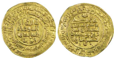
406. SAMANID: Nuh III , 976-997, AV dinar (3.77g), Nishapur, AH373, A-1468, citing Abu 'Ali below obverse field & Husam al-Dawla below reverse field, EF $220 - 300