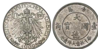
813. KIAUCHAU: Wilhelm II , 1898-1914, 10 cents, 1909, Y-2, Jager-730, lustrous AU $100 - 150