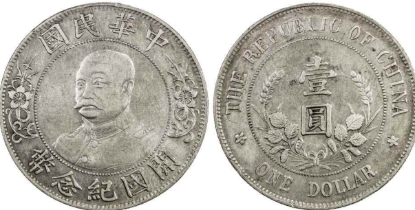
734. CHINA: AR dollar, ND (1912), Y-321, L&M-45, Li Yuan Hung portrait on obverse, chopmarked - actually one very small interesting chopmark in the reverse field, pleasing example of type, NGC graded VF details $650 - 850

A scarce coin that appears on the market infrequently in this wonderful high-graded condition.