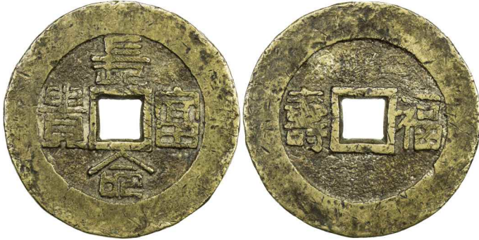
714. QING: AE charm, CCH-1457, cháng míng fù guì (longevity, wealth and honor) / fú shòu (happiness and longevity), rim nicks, F-VF, R $150 - 250