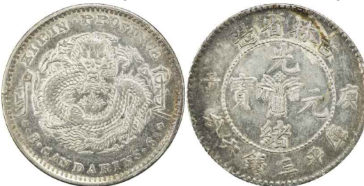
777. KIRIN: Kuang Hsu , 1875-1908, AR 50 cents, CD1900, Y-182.3, L&M-532, Kann-402, EF, ex Daniel Ching Collection $150 - 200