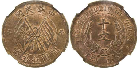
730. CHINA: AE 10 cash, ND, Y-303, crossed Wuchang Uprising and Five-colored flags, NGC graded MS64 RB $100 - 150