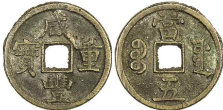
635. QING: Xian Feng , 1851-1861, AE 5 cash (6.73g), Board of Works mint, Peking, H-22.750, New branch mint, cast 1854-57, VF-EF, S $75 - 100