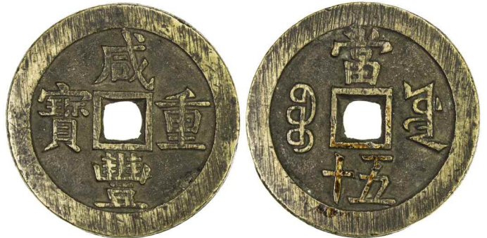
637. QING: Xian Feng , 1851-1861, AE 50 cash (67.59g), Board of Works mint, Peking, H-22-759, 56mm, Old branch mint, cast November 1853 to March 1854, large size, brass ( huáng tóng ) color, VF-EF $100 - 150