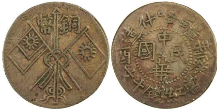
797. SINKIANG: AE 10 cash , CD1933, Y-44.5, small flan type, Choice VF, S $75 - 100