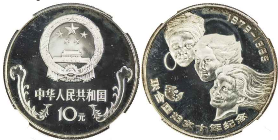
809. CHINA (PEOPLE'S REPUBLIC): AR 10 yuan , 1985, Y-62, "Decade for Women" type, NGC graded PF67 Ultra Cameo $150 - 200