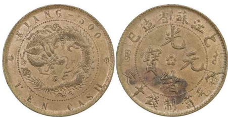
770. KIANGSU: Kuang Hsu , 1875-1908, AE 10 cash, Y-162.10, ZL-38, W-829, flying Dragon, plain edge, variety with small Manchu, mostly brown fully lustrous, UNC, S $100 - 150