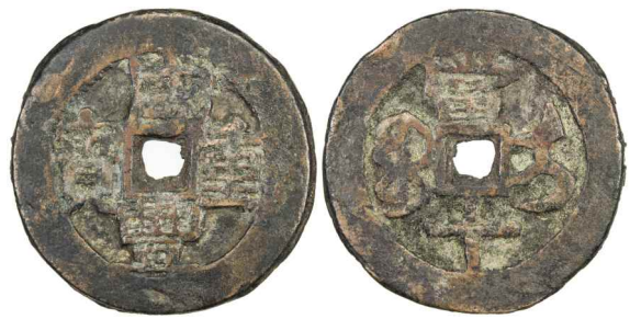
668. QING: Xian Feng , 1851-1861, AE 10 cash (17.37g), Ili mint, Xinjiang Province, H-22.1087, Burger-9-83-4-10, cast year 4 (1854), copper ( tóng ) issue, Fine $75 - 100