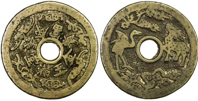
713. QING: AE charm (15.78g), CCH-834, two bats facing each other, four other symbols, jin yù mǎn táng cháng míng fù guì (enjoy long life and prosperity) / stork and deer facing each other, both representing long life, EF $75 - 100