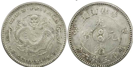
775. KIRIN: Kuang Hsu , 1875-1908, AR 50 cents, CD1900, Y-182a, L&M-527, figure-eight yinyang symbol, EF $400 - 500