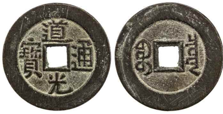
624. QING: Dao Guang , 1820-1850, AE palace cash (6.21g), Board of Revenue mint, Peking, H-22.586, East branch mint, cast 1824-31, type B, small guang type, a lovely example, EF $75 - 100