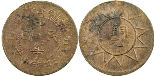
795. SINKIANG: AE 10 cash , Kashgar, CD1929, Y-B38.4, usual crude strike, much original luster, wonderful condition for type, lustrous UNC $100 - 150