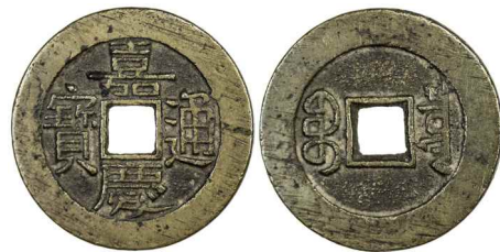
623. QING: Jia Qing , 1796-1820, AE palace cash (8.55g), Board of Revenue, Peking, H-22.477, East branch mint, VF-EF $80 - 100