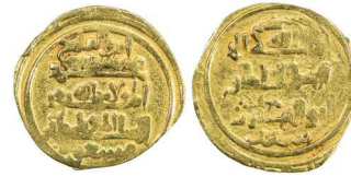
473. SELJUQ OF WESTERN IRAN: Mas'ud , 1134-1152, AV dinar (3.30g), NM, ND, A-1691, citing Great Seljuq Sanjar and unknown ruler or governor Sa'd below obverse, F-VF, R $250 - 275