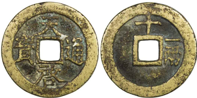
619. MING: Tian Qi , 1621-1627, AE 10 cash (26.57g), H-20.229, 46mm, shi (10 [cash]) above, yi liang (one ounce) at right on reverse, F-VF $75 - 100 Photo size reduced.