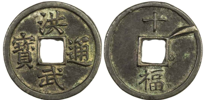
615. MING: Hong Wu, 1368-1398, AE 10 cash (24.85g), Fujian Province, H-20.115, 46mm, shi above, fu below on reverse, casting flaw on reverse, EF $300 - 500