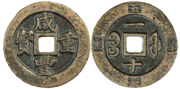
646. QING: Xian Feng , 1851-1861, AE 10 cash, Fuzhou mint, Fujian Province, H-22.793, wu qian ji zhong incuse in rim, cast 1853-55, copper ( tóng ) color, VF $100 - 150