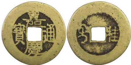
696. QING: Jia Qing , 1796-1820, AE charm (4.15g), Guangxi Province, Burger 2016 p.102, gui in Manchu and gui in Chinese on reverse, "poem cash" privately made later casting, evenly worn F-VF $75 - 100