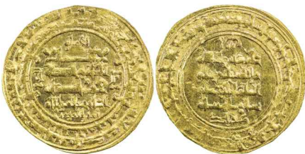
468. GREAT SELJUQ: Tughril Beg , 1038-1063, AV dinar (4.51g), Madinat al-Salam, AH448, A-1665, Jafar-S.MS.448B, broad flan, much original luster, AU, R $300 - 400