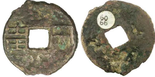
593. WARRING STATES: Qin State , 250-220 BC, AE cash (5.69g), H-6.30, liang zi in archaic script, crude casting style without rims, VG, R, ex Jiùjīnshān Collection $200 - 250

With collector's original paper envelope.