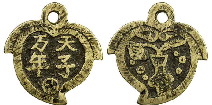
718. QING: AE charm, CCH-2394, 49mm, peach-shaped charm, wàn tiān huá zǐ / vase, VF $75 - 100