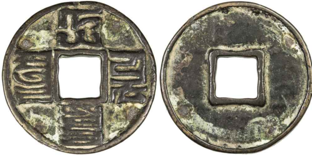
602. YUAN: Da Yuan , 1310-1311, AE 10 cash (19.36g), H-19.46, ta üen tong baw in Mongol 'Phags-pa script ( da yuan tong bao in Chinese), VF $75 - 100

Külüg Khan (Da Yuan), born Khayishan, meaning "wall" in Mongolian, was an Emperor of the Yuan Dynasty, and is regarded as the seventh Great Khan of the Mongols in Mongolia. His name means "warrior Khan" or "fine horse Khan" in the Mongolian language.