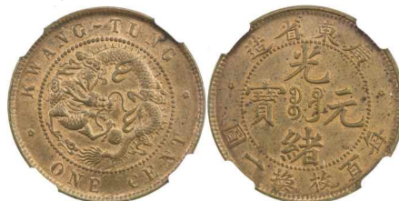
779. KWANGTUNG: Kuang Hsu , 1875-1908, AE cent, ND (1900-06), Y-192, NGC graded MS63 RB $75 - 100