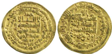
410. SAMANID: Nuh III , 976-997, AV dinar (4.02g), Nishapur, AH385, A-1468, citing Sayyid al-Umara' Abu 'Ali, VF $220 - 300

Abu 'Ali is actually the Simjurid governor of Khorasan, 'Imad al-Dawla Muhammad b. Muhammad.