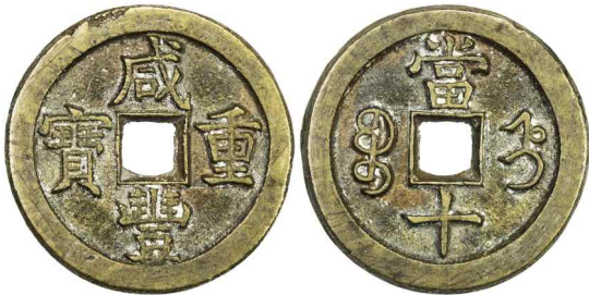
666. QING: Xian Feng , 1851-1861, AE 10 cash (17.13g), Baoding mint, Zhihli Province, H-22.1051, brass ( huáng tóng ) color, cast 1854-55, EF $75 - 100