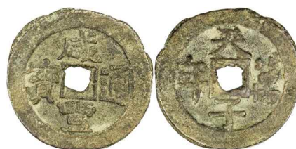
699. QING: Xian Feng , 1851-1861, AE charm (3.54g), CCH-199, tian zi wan nian (May the Emperor (Son of Heaven) live for a myriad [10,000] of years) on reverse, F-VF $75 - 100

Likely later casting, perhaps late Qing Dynasty or Min Guo period.