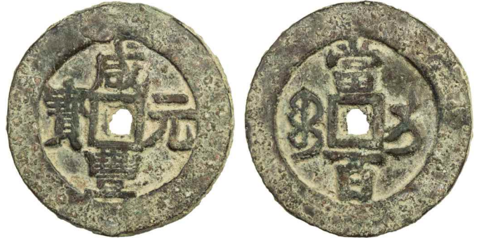
669. QING: Xian Feng , 1851-1861, AE 100 cash, Ili mint, Xinjiang Province, H-22.1091, Burger-9-83-4-100, 52mm, cast year 4 (1854), large characters, copper ( tóng ) issue, much adhesion around rim, VF $100 - 150