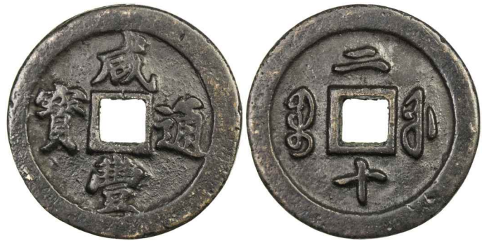
644. QING: Xian Feng , 1851-1861, AE 20 cash, Fuzhou mint, Fujian Province, H-22.781, Burger-9-48-3-20, copper ( tóng ) issue, cast year 3 (1853), VF $75 - 100