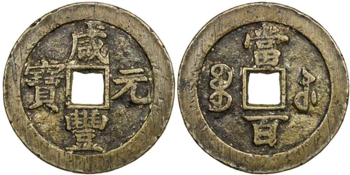
658. QING: Xian Feng , 1851-1861, AE 100 cash, Suzhou mint, Jiangsu Province, H-22.917, 60mm, brass ( huáng tóng ), cast 1854-55, F-VF $75 - 100