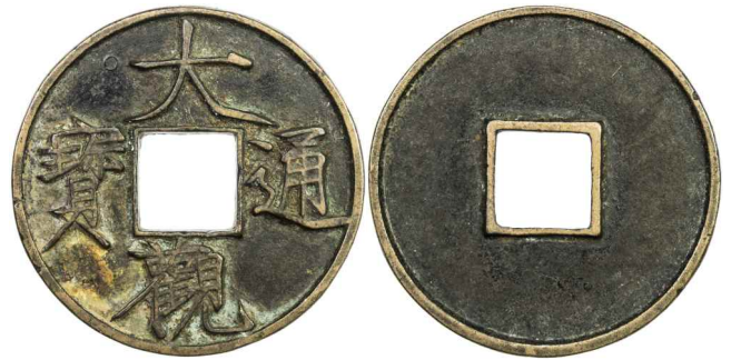
595. NORTHERN SONG: Da Guan , 1107-1110, AE 10 cash, H-16.426, slender golden script, EF $75 - 100

At that time 5000 Wu Shu was equal to 1/2 cattie of gold. A cattie weighed about 120 grams, so these knives were valued at about 60 grams (2 ounces) of pure gold. We have not been able to find a relative value for gold in ancient China, but in the same time frame in the Roman Empire, two ounces of gold would have been at least a year's wages to an average citizen, thus the problem with this issue. It was fiat currency with a named value very high, but with little intrinsic value.