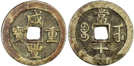
650. QING: Xian Feng , 1851-1861, AE 10 cash (16.59g), Wuchang mint, Hubei Province, H-22.857, brass ( huáng tóng ), cast 1854-56, VF, S $75 - 100