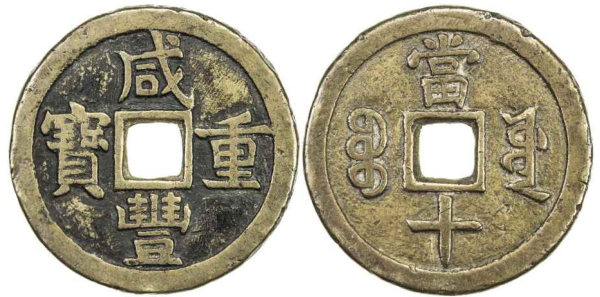
636. QING: Xian Feng , 1851-1861, AE 10 cash (20.83g), Board of Works mint, Peking, H-22.754, Old branch mint, cast 1853-54, brass ( huáng tóng ) color, VF, S $75 - 100