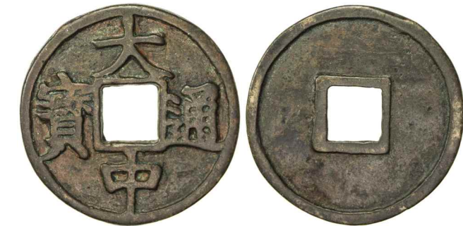
609. MING: Da Zhong, 1361-1368, AE 5 cash (16.55g), H-20.33, VF $100 - 150