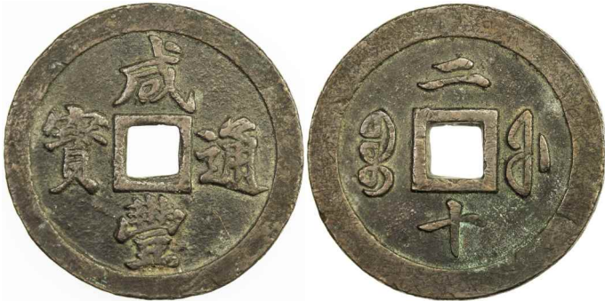
643. QING: Xian Feng , 1851-1861, AE 20 cash, Fuzhou mint, Fujian Province, H-22.781, 46mm, tong bao type, copper ( tóng ) issue, cast 1853-54, VF $100 - 150