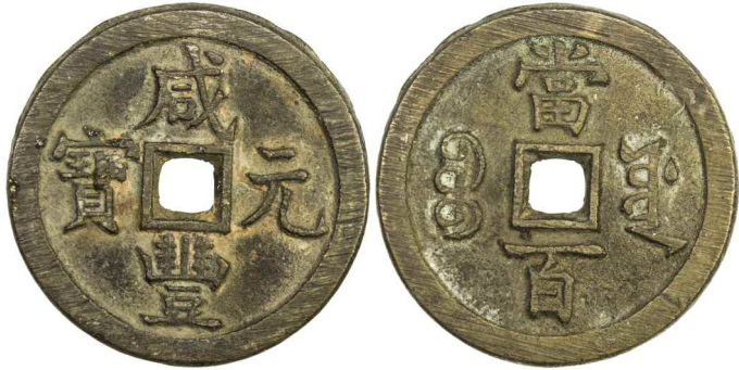
642. QING: Xian Feng , 1851-1861, AE 100 cash, Board of Works mint, Peking, H-22.763, 50mm, Old branch mint, cast March 1854 to July 1855, brass ( huáng tóng ) color, EF $100 - 150