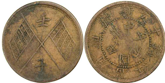
796. SINKIANG: AE 10 cash , year 1 (1912), Y-A39.2, attractive for type, Fine, S $75 - 100