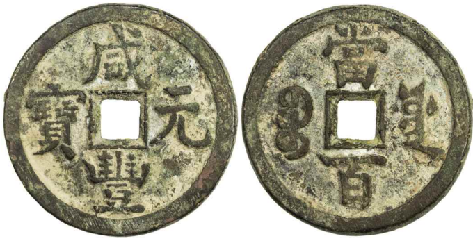
640. QING: Xian Feng , 1851-1861, AE 100 cash, Board of Works mint, Peking, H-22.762, 48mm, New branch mint, cast March 1854 to July 1855, brass ( huáng tóng ) color, Fine $75 - 100