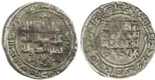
465. GHAZNAVID: Mahmud , 999-1030, AR bilingual dirham (2.95g), Mahmudpur (=Lahore), AH419, A-1610, lovely strike, VF-EF $100 - 150