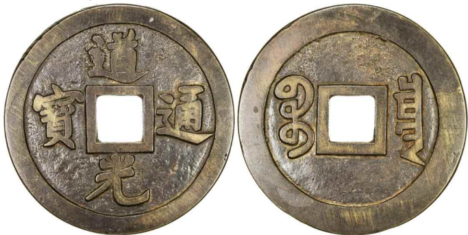
697. QING: Dao Guang , 1821-1850, AE charm, 67mm, private issue with the Manchu mint name of the Board of Revenue, VF $75 - 100