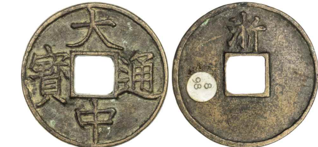
611. MING: Da Zhong, 1361-1368, AE 5 cash (14.84g), Zhejiang Province, H-20.43, zhe above on reverse, light old tooling evident in reverse fields, VF-EF, ex Jiujinshan Collection $150 - 250