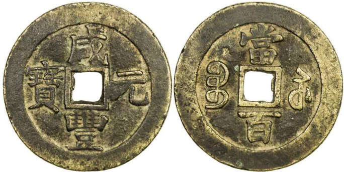
657. QING: Xian Feng , 1851-1861, AE 100 cash, Suzhou mint, Jiangsu Province, H-22.904, Burger-9-45a-4b-100, 59mm, cast 4th year (1854), brass ( huáng tóng ) color, F-VF $75 - 100