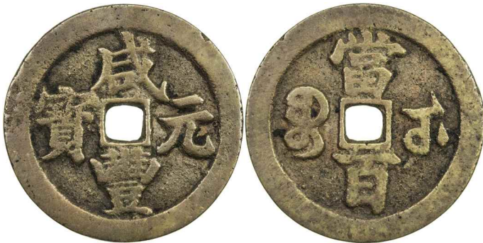
651. QING: Xian Feng , 1851-1861, AE 100 cash, Wuchang mint, Hubei Province, H-22.861, 55mm, cast 1854-56, variety with four stroke yan , brass ( huáng tóng ) color, poor casting style, porous Fine $75 - 100