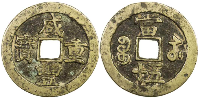
656. QING: Xian Feng , 1851-1861, AE 50 cash, Suzhou mint, Jiangsu Province, H-22.904, Burger-9-45a-4e-50, 55mm, cast 4th year (1854), brass ( huáng tóng ) color, F-VF $75 - 100