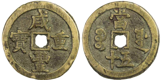
638. QING: Xian Feng , 1851-1861, AE 50 cash, Board of Works mint, Peking, H-22.760, Burger-9-14-4(2)-50, 44mm, New branch mint, cast 4th year (1854), brass ( huáng tóng ) color, Fine $75 - 100