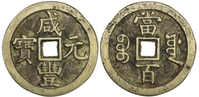
639. QING: Xian Feng , 1851-1861, AE 100 cash, Board of Works mint, Peking, H-22.762, 50mm, New branch mint, cast March 1854 to July 1855, brass ( huáng tóng ) color, VF-EF $100 - 150