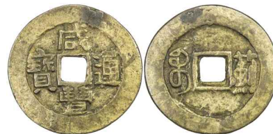
700. QING: Xian Feng , 1851-1861, AE charm (3.82g), Manchu boo at left, Chinese ji for Jizhou garrison in Zhili at right on reverse, F-VF $75 - 100