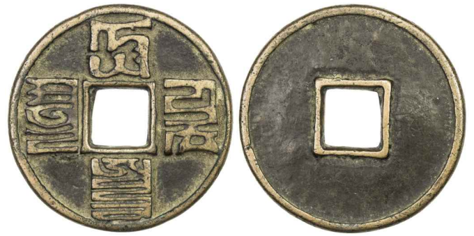
604. YUAN: Da Yuan , 1310-1311, AE 10 cash (24.29g), H-19.46, ta üen tong baw in Mongol 'Phags-pa script ( da yuan tong bao in Chinese), superb VF-EF, ex Jiùjìnshan Collection $125 - 175