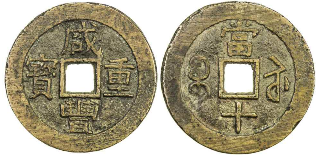
653. QING: Xian Feng , 1851-1861, AE 10 cash (23.25g), Suzhou mint, Jiangsu Province, H-22.887, 40mm, brass ( huáng tóng ), cast 1854-55, VF, S $75 - 100