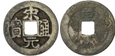
597. NORTHERN SONG: Song Yuan , 960-976, AE charm, jia above, horse left below on reverse, F-VF, RR $100 - 150

The character i above on reverse is likely an abbreviated form of the Chinese cyclical date jia xu CD974 or jia zi CD964.