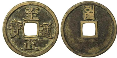
606. YUAN: Zhi Zheng , 1341-1368, AE 2 cash (5.79g), CD1351, H-19.99, maw in Mongolian 'Phags-pa script above for Chinese cyclical date, sin mao , VF-EF $100 - 150