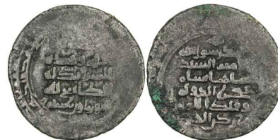
439. BAVANDID OF TABARISTAN: Shahriyar b. Rustam , 987-1003, BI dirham (5.72g), Firrim, DM, A-1525.1, citing the Buwayhid Fakhr al-Dawla as overlord, mint name barely visible, but Firrim is the only mint for the first four Bavandid rulers, F-VF, RRR $150 - 200