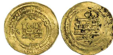
391. SAMANID: Nasr II , 914-943, AV dinar (4.11g), al-Muhammadiya, AH318, A-1449, Arabic "S" in lower left of reverse field, some weakness near the edge, VF-EF, S $220 - 280