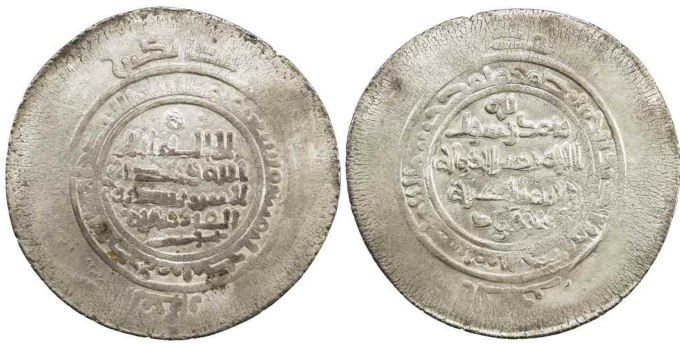
464. GHAZNAVID: Mahmud , 999-1030, AR multiple dirham (13.36g), Andaraba, AH[3]89, A-1608, 47mm, sword below obverse field, EF $100 - 125