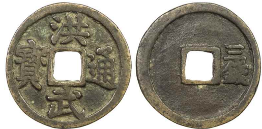
614. MING: Hong Wu, 1368-1398, AE 3 cash, H-20.87, san qian at right on reverse, VF, ex Jiujinshan Collection $75 - 100