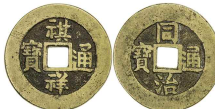
702. QING: Qi Xiang , 1861, AE charm (7.55g), Hua Guangpu p.1740var, qi xiang tong bao / tong zhi zhong bao , brass ( huang tong ) color $800 - 1,000

The obverse of this charm contains the first "nian hao" (reign title) of Tong Zhi. Very few coins minted with this reign title were produced and none were officially put into circulation. Likely a later Min Guo period (Republic era) production.