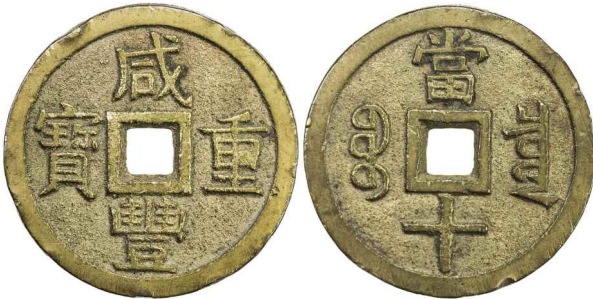
626. QING: Xian Feng , 1851-1861, AE 10 cash (20.99g), Board of Revenue mint, Peking, H-22.691, South branch mint, cast 1853-54, brass ( huang tong ) color, couple minor rim bumps but still a lovely example! EF $75 - 100