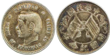
731. CHINA: AR 20 cents (5.31g), ND (1912), Y-317, L&M-61, Sun Yat Sen memento, Founding of the Republic, lovely deep red-blue toning, AU $250 - 350