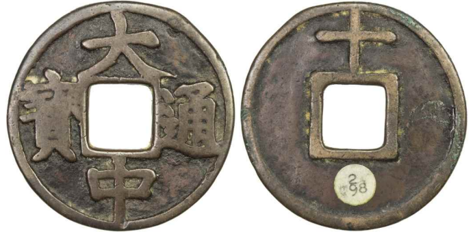
613. MING: Da Zhong, 1361-1368, AE 10 cash (18.96g), H-20.45, large shi above on reverse, Fine, ex Jiujinshan Collection $100 - 150