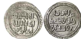
475. KHWARIZMSHAH: Muhammad , 1200-1220, AR medium dirham (3.12g), [Ghazna], ND, A-1721, prototype for Chingiz Khan type A-1967, lovely strike, choice EF $80 - 100