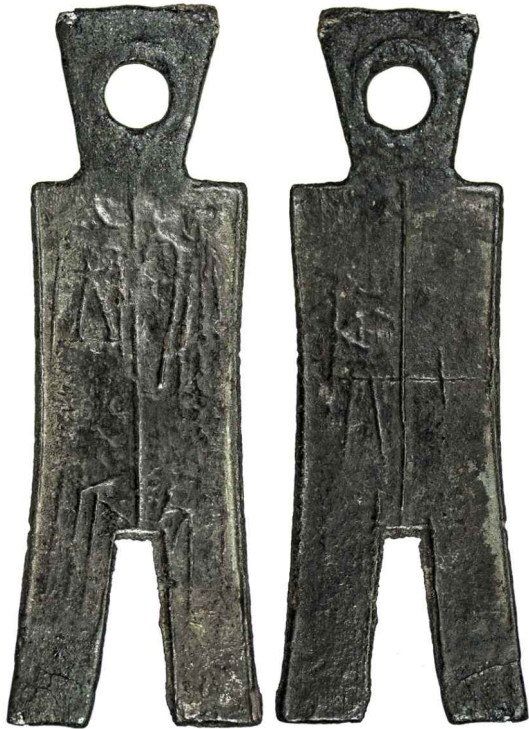
589. WARRING STATES: State of Chu, 350-250 BC, AE spade money, H-3.470, large flat handle square foot spade type, pei bi dang jin on obverse, shi huo on reverse in archaic script, top broken and repaired, Fine $600 - 800

The State of Chu was an ancient Chinese state in the Yangtze valley during the Zhou Dynasty. Originally Chu was considered a viscounty, but starting from King Wu in the early 8th century BC, the rulers of Chu declared themselves kings on an equal footing with the Zhou rulers. Originally known as Jing and then as Jingchu, Chu occupied vast areas of land at its height, including most of the present-day provinces of Hubei and Hunan, along with parts of Chongqing, Guizhou, Henan, Anhui, Jiangxi, Jiangsu, Zhejiang, and Shanghai. The hao in the reverse inscription shi hao probably refers to ten ant nose type coins. These spades are thick and robust with well developed rims all the way around, usually crudely cast with a large round hole in the top.