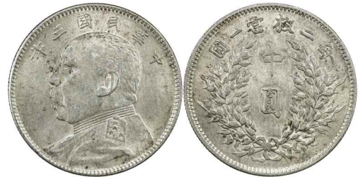
737. CHINA: AR 50 cents, year 3 (1914), Y-328, L&M-64, Yuan Shih Kai series, lightly hairlined, AU $150 - 250

Some 20 cent coins dated year 5 were made at Fuzhou (Foochow) 1925-26, but whether they were the normal type or this rarer dot type is unknown.