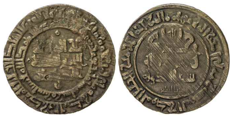
429. QARAKHANID: Muhammad b. 'Ali , 1003-1024, AE fals (3.43g), Usrushana, AH404, A-3308, ruler cited as sanâ al-dawla yinaltegin , VF, R $120 - 160