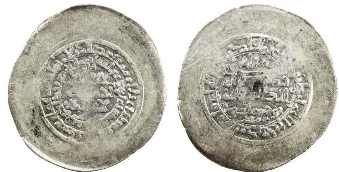
414. SAMANID: Nuh III , 976-997, AR multiple dirham, Warwarliz, AH374, A-1469W, 8.44g, obverse of A-1476S (same die as SNAT-1254), normal reverse die of A-1469W (SNAT-1251-53, different die), slightly shallow strike, unpublished, EF, RRR $200 - 250