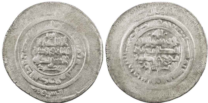
384. BANIJURID: al-Harith b. Harb , 10th century, AR multiple dirham (13.24g), Kurat Badakhshan, ND, A-1439, SNAT-325 (same dies), citing al-Wali Muhammad & the Samanid ruler Nuh III b. Mansur, lovely strike, EF $80 - 100