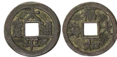
598. NORTHERN SONG: Tai Ping , 976-989, AE charm, fu da and two additional unread characters on reverse, F-VF, RR $100 - 150 Possibly a later casting but seemingly unpublished.

The character i above on reverse is likely an abbreviated form of the Chinese cyclical date jia xu CD974 or jia zi CD964.