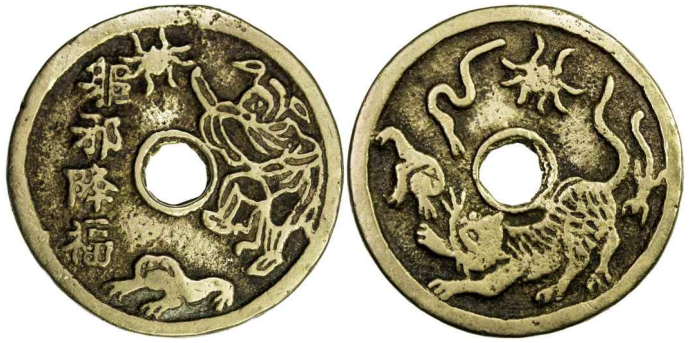
716. QING: AE charm (29.01g), CCH-1823, 47mm, "Five Poisonous Creatures" charm, Liu Hai or Zhong Kui standing right, auspicious spider above, three-legged toad below, qu xié jiàng fú (expel evil and send down good fortune) / the large animal below is a tiger or cat and, to the right of its tail is a lizard and to the left a spider, a snake, and a three-legged toad, VF $75 - 100

One of the most dangerous and inauspicious days of the year in ancient China was the 5th day of the 5th month, according to the lunar calendar. This day marked the beginning of summer which by midseason meant dangerous animals and insects, the spread of infectious diseases, and the appearance of evil spirits. Charms of these types were often hung in Chinese homes to protect the family from evil spirits and poisonous animals associated with this unlucky day, (see also lot 717 below).