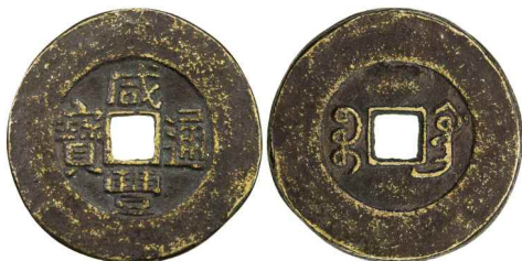
698. QING: Xian Feng , 1851-1861, AE charm (7.11g), Guangzhou mint, Guangdong Province, large 'coin' with broad rims, VF-EF, RR $75 - 100

Likely later casting, perhaps late Qing Dynasty or Min Guo period.