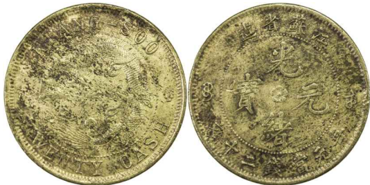
771. KIANGSU: Kuang Hsu , 1875-1908, AE 20 cash, ND (ca. 1902), Y-163a, CCC-233, ZL-34, brass, EF, S $100 - 150