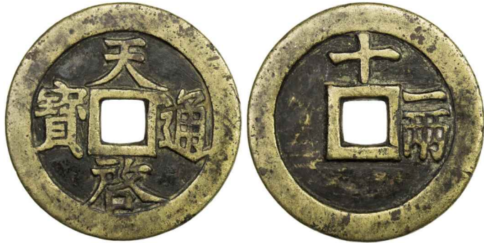
617. MING: Tian Qi , 1621-1627, AE 10 cash, H-20.229, 48mm, shi (10 [cash]) above, yi liang (one ounce) at right on reverse, pleasing VF $100 - 150 Photo size reduced.