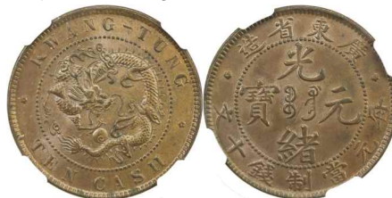
780. KWANGTUNG: Kuang Hsu , 1875-1908, AE 10 cash, ND (1900-06), Y-193, low "po" type, 7 spines behind flame, NGC graded MS62 BR $75 - 100