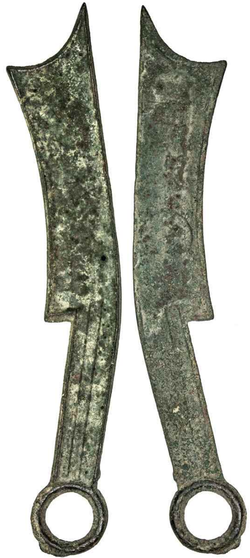
590. WARRING STATES: Anonymous, 400-220 BC, AE knife money, H-4.7, three-character knife, qi fa huo (the authorized currency of Qi) in archaic script on obverse, thin characters in high relief, circle on reverse, light encrustation, attractive patina, a lovely example! EF $2,500 - 3,000

The State of Chu was an ancient Chinese state in the Yangtze valley during the Zhou Dynasty. Originally Chu was considered a viscounty, but starting from King Wu in the early 8th century BC, the rulers of Chu declared themselves kings on an equal footing with the Zhou rulers. Originally known as Jing and then as Jingchu, Chu occupied vast areas of land at its height, including most of the present-day provinces of Hubei and Hunan, along with parts of Chongqing, Guizhou, Henan, Anhui, Jiangxi, Jiangsu, Zhejiang, and Shanghai. The hao in the reverse inscription shi hao probably refers to ten ant nose type coins. These spades are thick and robust with well developed rims all the way around, usually crudely cast with a large round hole in the top.