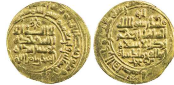
471. GREAT SELJUQ: Malikshah I , 1072-1092, AV dinar (4.44g), MM, AH484, A-1674, style of Nishapur mint, lovely EF $225 - 250