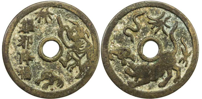
717. QING: AE charm, CCH-1823, 47mm, "Five Poisonous Creatures" charm, Liu Hai or Zhong Kui standing right, auspicious spider above, three legged toad below, qu xié jiàng fú (expel evil and send down good fortune) / the large animal below is a tiger or cat and, to the right of its tail is a lizard and to the left a spider, a snake, and a three-legged toad, VF $75 - 100