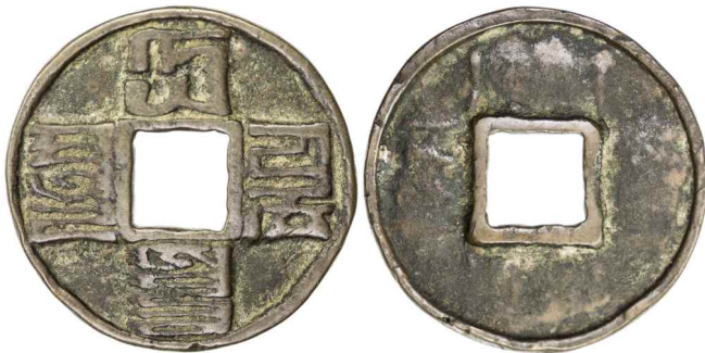
603. YUAN: Da Yuan , 1310-1311, AE 10 cash (20.81g), H-19.46, ta üen tong baw in Mongol 'Phags-pa script $75 - 100