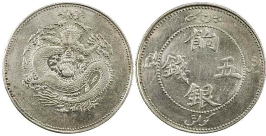
794. SINKIANG: Hsuan Tung , 1909-1911, AR 5 miscals, ND (1910), Y-6.7, L&M-817, auspicious bat above dragon, lightly cleaned, EF, ex Wéiduoliya Collection , ex Taisei Auction 240, Lot 23-0564, Hong Kong 1996 . $700 - 900