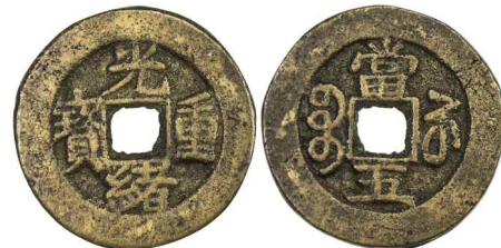
671. QING: Guang Xu , 1875-1908, AE 5 cash (8.05g), Suzhou mint, Jiangsu Province, H-22.1367, cast 1905-07, better than average quality for this type, VF, S $75 - 100