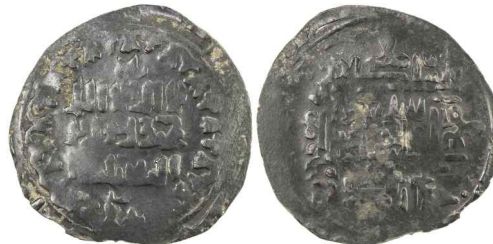
437. QARA-KHITAY IN BALKH: Sanjar Qadir Tafghaj Khan , 1177-1186, AE dirham (3.37g), Balkh, ND, A-A1523, mint name above reverse field, with sanjar bin / tafgha(j) khan in reverse center, fancy floral border around the obverse, caliph al-Mustadi, nice strike, possibly unpublished, VF $150 - 175