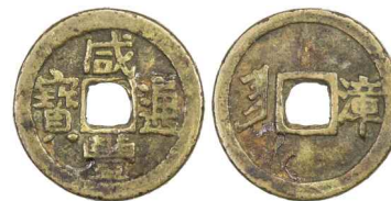
701. QING: Xian Feng , 1851-1861, AE charm (6.27g), CCH-290var, Manchu jang at left, Chinese zhang for Zhangzhou Fujian at right on reverse, thick small charm, F-VF $75 - 100