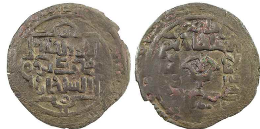
476. KHWARIZMSHAH: Muhammad , 1200-1220, AE broad dirham (3.41g), (Tirmidh), ND, A-1723, VF-EF $125 - 175