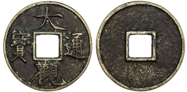
596. NORTHERN SONG: Da Guan , 1107-1110, AE 10 cash (13.29g), H-16.426, slender golden script, EF $75 - 100