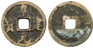
600. WESTERN XIA: Huang Jian , 1210-1211, AE cash (4.23g), H-18.108, Very Good, S, ex Jiùjìnshan Collection $100 - 125