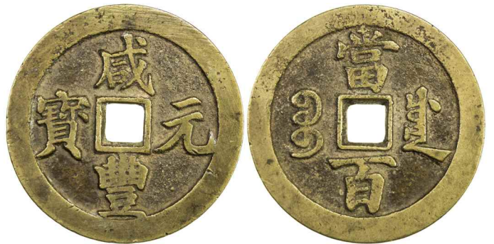
663. QING: Xian Feng , 1851-1861, AE 100 cash, Chengdu mint, Sichuan Province, H-22.981, 56mm, brass ( huáng tóng ) color, cast 1853-54, VF $75 - 100