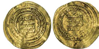
440. BUWAYHID: Rukn al-Dawla al-Hasan , ca. 943-944, AV dinar (3.47g), Sawah, AH348, A-1546A, Treadwell-Sa348G (same dies), special style, with broad outer border, double-struck reverse, VF, R $180 - 220

Sawah (Saveh) briefly operated as a Buwayhid mint AH340-353. It was a common mint only for some Ilkhan and Timurid coinage.