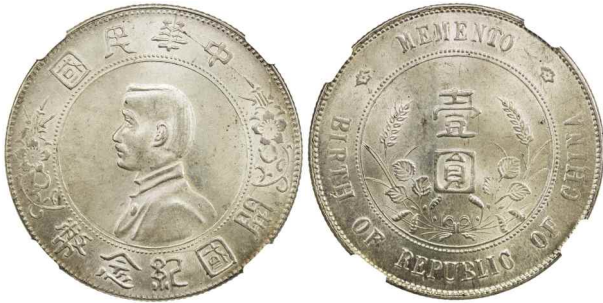
732. CHINA: AR dollar, ND (1927), Y-318a.1, L&M-49, Sun Yat Sen left, Memento type, NGC graded MS63 $125 - 175