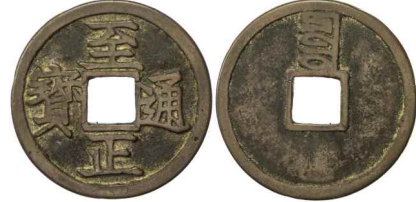
605. YUAN: Zhi Zheng , 1341-1368, AE cash (3.89g), CD1352, H-19.95, Mongolian 'Phags-pa shin for Chinese cyclical date ren chen above on reverse, VF-EF $100 - 150