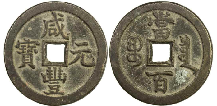
629. QING: Xian Feng , 1851-1861, AE 100 cash, Board of Revenue mint, Peking, H-22.709, 49mm, South branch mint, cast 1854-55, brass ( huang tong ) color, EF $100 - 150

From an old German collection with price paid as 2 Reichsmark. Photo size reduced.