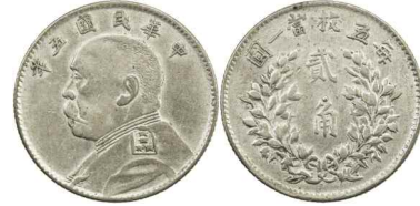
736. CHINA: AR 20 cents, year 5 (1916), Y-327b, Kann-66ab, L&M-74var, W-178v, Zeno-152568, Yuan Shih Kai, with dot at reverse center, UNC, RRR, ex Daniel Ching Collection $800 - 1,000

Some 20 cent coins dated year 5 were made at Fuzhou (Foochow) 1925-26, but whether they were the normal type or this rarer dot type is unknown.