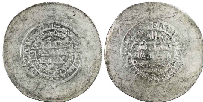
413. SAMANID: Nuh III , 976-997, AR multiple dirham, Warwarliz, AH374, A-1469W, 48mm, 10.92g, obverse of A-1476S (same die as SNAT-1254), normal reverse die of A-1469W (SNAT-1251-53, different die), very slightly shallow strike, unpublished, lovely EF, RRR $250 - 300