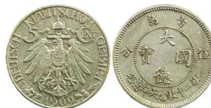
812. KIAUCHAU: Wilhelm II , 1898-1914, 5 cents, 1909, Y-1, German inscription, Deutsche Kiautschou Gebiert / Chinese inscription dà guó bao at center, qing dao above, surface hairlines, EF $100 - 150