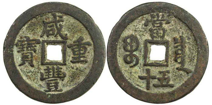
628. QING: Xian Feng , 1851-1861, AE 50 cash, Board of Revenue mint, Peking, H-22.707, 47mm, West Branch mint, cast 1854-1855, F-VF $75 - 100