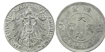
815. KIAUCHAU: Wilhelm II , 1898-1914, 10 cents, 1909, Y-2, Choice EF $75 - 100