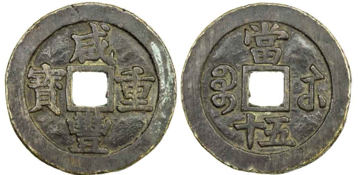
655. QING: Xian Feng , 1851-1861, AE 50 cash, Suzhou mint, Jiangsu Province, H-22.904, 53mm, brass ( huáng tóng ), cast 1854-55, some minor edge bumps, F-VF $75 - 100