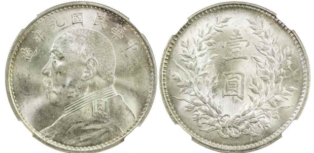
739. CHINA: AR dollar, year 9 (1920), Y-329.6, L&M-77, Yuan Shih Kai in military uniform left, NGC graded MS62 $250 - 350