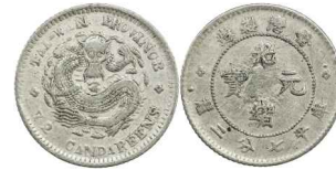
802. TAIWAN: Kuang Hsu , 1875-1908, AR 10 cents, ND (1890), Y-247.1, L&M-328v, Kann-134, obverse scratches due to button mount removal, Fine $200 - 300