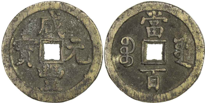
641. QING: Xian Feng , 1851-1861, AE 100 cash, Board of Works mint, Peking, H-22.762, 50mm, New branch mint, cast March 1854 to July 1855, brass ( huáng tóng ) color, Fine $75 - 100