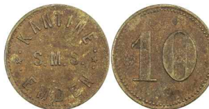
816. KIAUCHAU: Wilhelm II , 1898-1914, brass token, 10 pfennig (1.98g), ND, Kantine S.M.S. Emden, EF, RR $125 - 175

The SMS Emden was completed in 1909, and stationed at Kiauchau in China until 1914, run aground off the Cocos-Keeling Islands, 9 November 1914 after action with the HMAS Sydney.