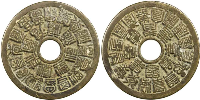
715. QING: AE charm, CCH-1478var, 49mm, "good fortune" character fu written 24 times on one side / the "longevity" character shou written 24 times, each character is written in a slightly different way or style, circular central hole, superb quality! EF $75 - 100

Most charms with round holes were meant to be worn on a necklace or hung from the waist.