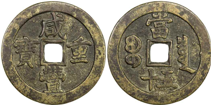
627. QING: Xian Feng , 1851-1861, AE 50 cash, Board of Revenue mint, Peking, H-22.707, 48mm, West branch mint, cast 1854-55, brass ( huang tong ) color, VF $75 - 100