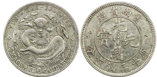
803. YUNNAN: Kuang Hsu , 1875-1908, AR 50 cents (13.44g), ND, Y-253, L&M-419, struck in 1907, bold EF $120 - 160