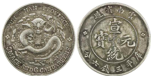
805. YUNNAN: Hsuan Tung , 1908-1911, AR 50 cents (13.05g), ND (1909-1911), Y-259, L&M-426, delightful iridescent toning, lovely EF $125 - 150