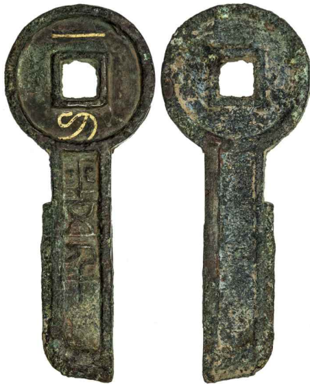
594. XIN: Wang Mang , 7-23 AD, AE gold key money, H-9.12, yi dao ping wu qian (One Knife worth five thousand) with the words yi dao written in gold inlay, minor encrustation, VF-EF, RR $2,500 - 3,500

At that time 5000 Wu Shu was equal to 1/2 cattie of gold. A cattie weighed about 120 grams, so these knives were valued at about 60 grams (2 ounces) of pure gold. We have not been able to find a relative value for gold in ancient China, but in the same time frame in the Roman Empire, two ounces of gold would have been at least a year's wages to an average citizen, thus the problem with this issue. It was fiat currency with a named value very high, but with little intrinsic value.