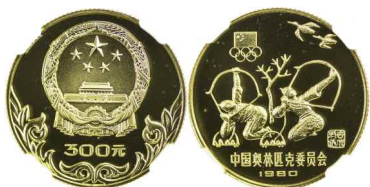
808. CHINA (PEOPLE'S REPUBLIC): AV 300 yuan , 1980, Y-23, Moscow Summer Olympics - Archery, NGC graded PF69 Ultra Cameo $600 - 800