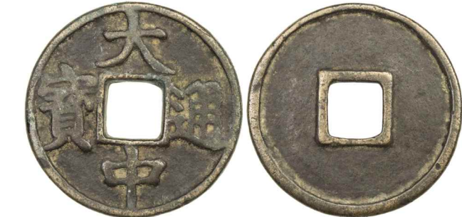
610. MING: Da Zhong, 1361-1368, AE 5 cash (22.12g), H-20.33, very heavy example, Fine, ex Jiujinshan Collection $100 - 125