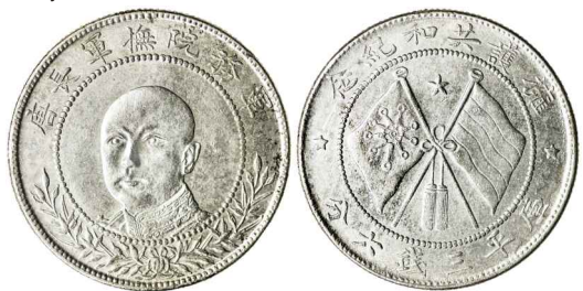
806. YUNNAN: AR 50 cents , ND (1919), Y-479, L&M-863, Tang Chi Yao, Protector of the Republic, commemorative, AU $200 - 250