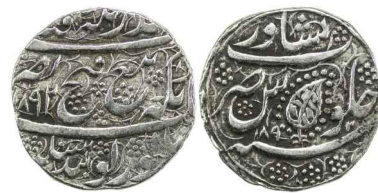
1986. SIKH EMPIRE: AR rupee (8.47g), Peshawar, VS1892//1892, KM-98.2, Herrli-13.02.04, Gobindshahi couplet / mint, date and pipal leaf, superb strike on broad flange, choice VF-EF $240 - 300