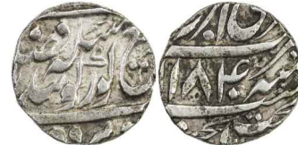
1975. SIKH EMPIRE: AR nanakshahi rupee (11.24g), Amritsar, VS1840, KM-A20.1a, Herlli-01.04.04, one of the rarest dates of the Amritsar mint, sometimes known as the Dar Khalsa type, bold EF, R $300 - 400