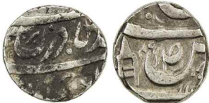
1970. PATIALA: Rajinder Singh , 1876-1900, AR rupee (10.99g), "Sahrind", VS[19]49, Y-6, only the years VS1842-48 are listed in KM, bold VF, RR $120 - 160

This is the usual date for the gold mohur, but not reported for silver.