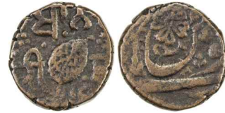
1974. SIKH EMPIRE: AE paisa (7.35g), Amritsar, ND, KM-10.2, Herlli-01.80, Gurmukhi obverse, Persian reverse, ornate 4-petal flower within the S of falus , F-VF, R $100 - 125