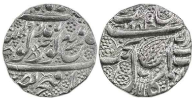
1979. SIKH EMPIRE: AR rupee, Amritsar, VS1901 (1844), KM-21.2, with fixed date VS1884 on reverse, EF $75 - 100