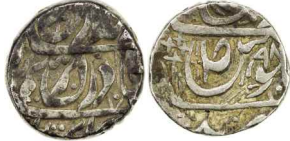
1967. PATIALA: Karam Singh , 1813-1845, AR rupee (11.01g), "Sahrind", VS[18]98, Cr-30.x, simple floral pattern within the S of jalus , VF, RRR $200 - 300

No dated examples of the regular rupee are listed in KM for Karam Singh, but VS[18]98 is reported for the nazarana rupee.