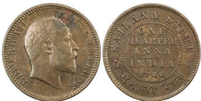
1972. SAILANA: Jaswant Singh , 1890-1919, AE ¼ anna, 1908, KM-15, EF-AU $150 - 200