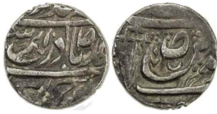
1966. PATIALA: Karam Singh , 1813-1845, AR rupee (11.09g), "Sahrind", ND, Cr-30.5, crescent & flower within the S of jalus , choice VF $100 - 150