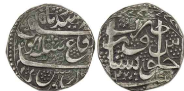
1988. SIKH EMPIRE: AR rupee (10.45g), Peshawar, year 22/year 22, KM-733 (Afghan), A-3135 (Durrani), in the name of Ayyub Shah, with the regnal year 22 above the name Ayyub on obverse, the former position of the Hijri year, and on the reverse in the normal position, 1 small testmark, VF-EF, RRR $200 - 400

The regular Sikh rupees of Peshawar (KM-98) were struck VS1891-94 (1834-37), to a standard of about 8.55g. I believe that the Ayyub year 11 rupees without Hijri date were then introduced at Peshawar, as a restoration of the previous nominal rupees struck before 1834 (weight standard about 10.6g). Moreover, the nominal Durrani Mahmud rupees of the nearby mint Derajat were last struck dated AH1252 (1836-37). It seems that the ongoing year 11 type was briefly replaced by this type, year 22 on both sides, as the 22nd regnal year of the by then deceased Ayyub would correspond to 1839-40, of which this piece is the first confirmed example, and the last silver coinage struck at Peshawar.