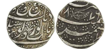
1982. SIKH EMPIRE: AR rupee (10.88g), Kashmir, VS1876, KM-46.2, Herrli-06.02.04, sprig mark on obverse, VF $100 - 150