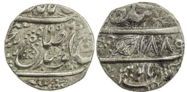
1985. SIKH EMPIRE: AR rupee (11.12g), Lahore, VS[18]95, KM-67, Herrli-08.09.04, VS1885 series, bold strike, choice EF $150 - 200