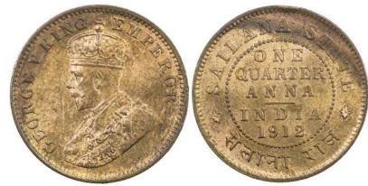
1973. SAILANA: Jaswant Singh , 1890-1919, AE ¼ anna, 1912, KM-16, choice UNC $150 - 200