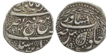
1987. SIKH EMPIRE: AR rupee (8.32g), Peshawar, VS1894//1894, KM-98.2, Herrli-13.02.04, 1 testmark on reverse, reverse off center, scarce date, VF, R $200 - 250