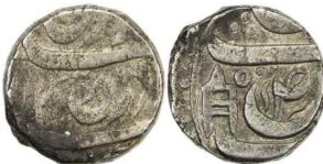
1969. PATIALA: Rajinder Singh , 1876-1900, AR rupee (11.01g), "Sahrind", VS[19]50, Y-6, only the years VS1842-48 are listed in KM, VF-EF, RR $120 - 160

This is one of very few Patiala issues with the mint name Patiala instead of the pseudo "Sahrind" normal on this series.