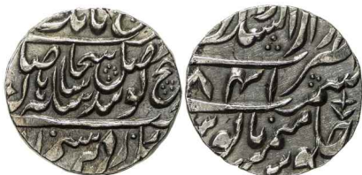
1983. SIKH EMPIRE: AR rupee (11.18g), Lahore, VS1841, KM-64, Herrli-08.04.04, superb strike on broad flange, typical for this year, choice EF $150 - 200