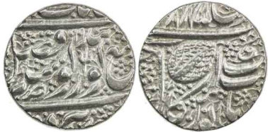
1980. SIKH EMPIRE: AR nanakshahi rupee (11.10g), Amritsar, VS(18)99, KM-22.5, VS1885 series, with trident, AU $125 - 175