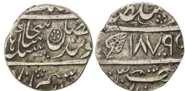
1984. SIKH EMPIRE: AR rupee (11.00g), Lahore, VS1879, KM-66.1, Herrli-08.06.04, VF-EF $100 - 125