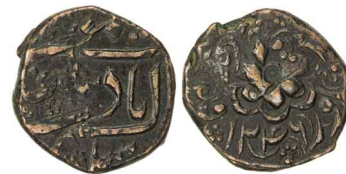
1989. SIKH EMPIRE: AE falus (7.93g), Peshawar, AH1246, KM—, Herrli—, in the name of the long deceased Taimur Shah / seven-petal flower within a heptafoil, mint & date around, apparently followed by the word 'aqebat, appears to be an unpublished variety, overstruck (as usual) on uncertain host, VF-EF, RR $100 - 150

The regular Sikh rupees of Peshawar (KM-98) were struck VS1891-94 (1834-37), to a standard of about 8.55g. I believe that the Ayyub year 11 rupees without Hijri date were then introduced at Peshawar, as a restoration of the previous nominal rupees struck before 1834 (weight standard about 10.6g). Moreover, the nominal Durrani Mahmud rupees of the nearby mint Derajat were last struck dated AH1252 (1836-37). It seems that the ongoing year 11 type was briefly replaced by this type, year 22 on both sides, as the 22nd regnal year of the by then deceased Ayyub would correspond to 1839-40, of which this piece is the first confirmed example, and the last silver coinage struck at Peshawar.