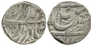
1968. PATIALA: Narinder Singh , 1845-1862, AR rupee (11.05g), Patiala, AH[12]63, Y-1, date in center of the word jalus , unreported date, VF, RR $150 - 200

No dated examples of the regular rupee are listed in KM for Karam Singh, but VS[18]98 is reported for the nazarana rupee.