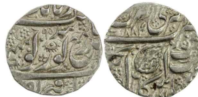
1978. SIKH EMPIRE: AR gobindshahi rupee (11.05g), Amritsar, VS[18]95, KM-21.2, Herlli-01.21.04, VS1884 series, lovely example on broad flan, EF-AU $100 - 125