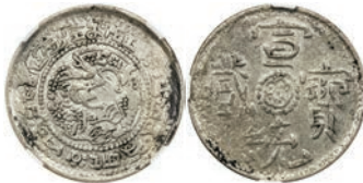
940. TIBET: Xuan Tong , 1909-1911, AR sho, ND (1910), Y-5, L&M-653, NGC graded EF45 $350 - 450