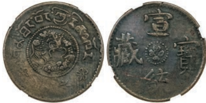
938. TIBET: Xuan Tong , 1909-1911, AE skar, ND (1910), Y-4, NGC graded F15 BR $200 - 300