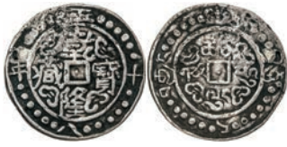
935. TIBET: Qian Long , 1736-1795, AR ½ sho (1.77g), year 58 (1793), Cr-71, pierced and repaired, VG-F, R $100 - 150