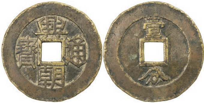
837. NAN MING: Xing Chao , 1648-1657, AE 10 cash, H-21.13, 50mm, yi fen on reverse, rim nicks, VF, ex Jiujinshan Collection $75 - 100