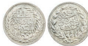
692. TUNIS: Muhammad al-Sadiq , 1859-1882, AR 8 kharub (1.52g), Tunis, AH1296, KM-181, citing the Ottoman sultan Abdul Hamid II, UNC $200 - 250