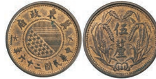
909. EAST HOPEI: AE 5 li , year 26 (1937), Y-516, couple minuscule spots, red & brown UNC $100 - 150