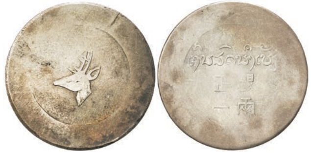
905. YUNNAN: Republic , AR tael (37.74g), ND (1943), KM-A3, L&M-435, small deer, few light scratches in field, VF $150 - 200