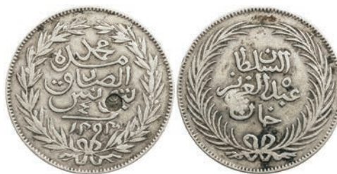
691. TUNIS: Muhammad al-Sadiq , 1859-1882, AR 4 piastres (11.97g), Tunis, AH1293, KM-168, citing the Ottoman sultan Abdul Aziz, countermarked star, VF $100 - 125