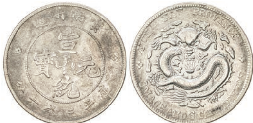
904. YUNNAN: Hsuan T'ung , 1909-1911, AR 50 cents (12.97g), ND (1909-1911), Y-259, L&M-426, 7 flames in pearl, VF-EF $100 - 125