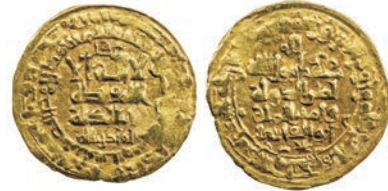
738. GHAZNAVID: Mahmud , 999-1030, AV dinar (4.03g), Nishapur, AH417, A-1606, final date digit weak, but confirmed by the previous lot in this auction, which is struck from the same dies, good strike, VF-EF $200 - 240