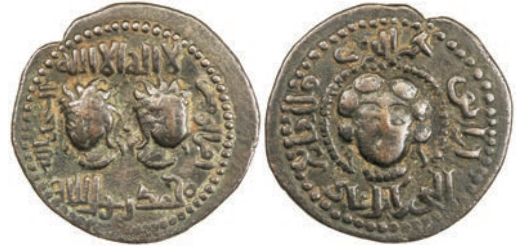
749. ARTUQIDS OF MARDIN: Alpi , 1152-1176, AE dirham (11.83g), NM, ND, A-1827.5, SS-30, two facing male busts obverse, facing curly-haired female bust reverse, citing the caliph al-Mustanjid, lovely bold strike, gorgeous VF $150 - 200