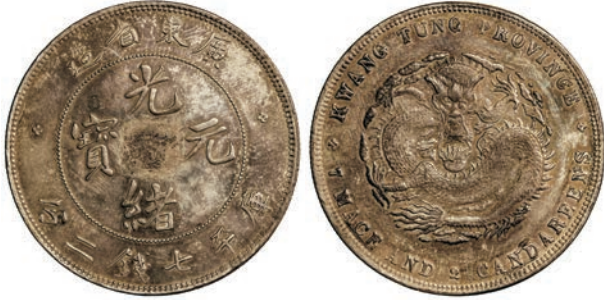
879. KWANGTUNG: Kuang Hsu , 1876-1908, AR dollar (26.73g), ND (1890-1908), Y-203, L&M-133, Manchu script in obverse center scraped away, EF $100 - 150