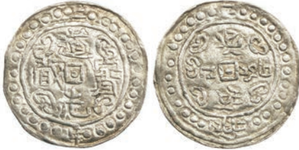
937. TIBET: Dao Guang , 1821-1850, AR sho, year 2, Cr-93, L&M-647, VF-EF $175 - 250