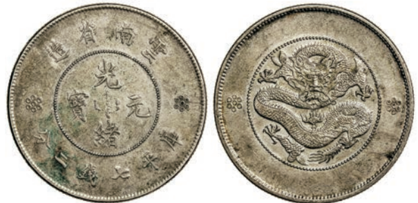
903. YUNNAN: Republic , AR dollar (26.62g), ND (1911), Y-258, L&M-421, in the name of Kuang Hsu, but struck after his death, under Hsuan T'ung, 1 circle, EF $220 - 300