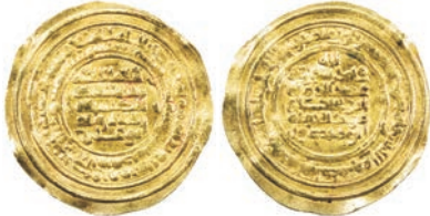
734. BUWAYHID: Mu'ayyid al-Dawla , 967-983, AV dinar (3.49g), al-Muhammadiya, AH365, A-1553, Treadwell-Mu365G (same dies), slightly crinkled, VF-EF, R $350 - 450

Only the mint of Mah al-Basra has become common for this formerly extremely rare ruler. All the other 3 mints, al-Karaj, Qumm and Hamadan, remain rare, with fewer than 10 pieces known for each.