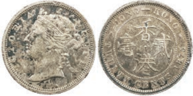
924. HONG KONG: Victoria , 1841-1901, AR 20 cents, 1875-H, KM-7, uneven tone, some marks and rim taps, better date, VF $75 - 100