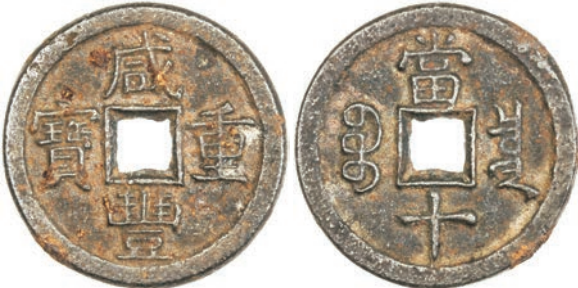
839. QING: Xian Feng , 1851-1861, iron 10 cash, Board of Revenue mint, Peking, H-22.736, cast 1855-57, EF, ex Jiujinshan Collection $75 - 100