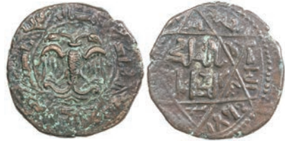
748. ARTUQIDS OF AMID & KAYFA: Nasir al-Din Mahmud , 1201-1222, AE dirham (9.62g), Amid, AH61(7), A-1823.3, SS-18, minor porosity, VF $100 - 125