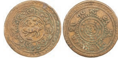
944. TIBET: AE 2½ skar , BE15-48 (1914), Y-16.2, scarce type, VF, S $75 - 100