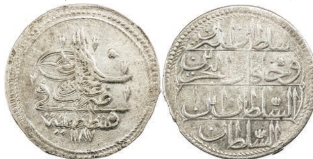
694. TURKEY: Abdul Hamid I , 1774-1789, AR piastre (18.76g), Kostantiniye, AH1187 year 1, KM-368, first toughra, broad flan, lightly hairlined, EF-AU $100 - 150