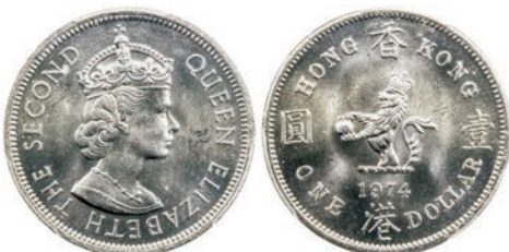
928. HONG KONG: Elizabeth II , 1952-1997, 1 dollar, 1974, KM-35, rare King's Norton Specimen strike, great luster, PCGS graded Specimen 65 Secure Holder, RR, ex King's Norton Mint Collection $500 - 600