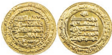
735. BUWAYHID: Samsam al-Dawla , 978-983, AV dinar (5.15g), Suq al-Ahwaz, AH370, A-1567, ruler cited as al-Marzuban, citing his father 'Adud al-Dawla, bold strike, AU $300 - 400

Gold dinars of Mu'ayyid al-Dawla are rare, unlike his common silver coinage.