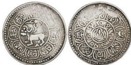
947. TIBET: AR 5 sho , BE15-50 (1916), Y-18.1, snow lion looking up, weakness of strike, VF $100 - 150