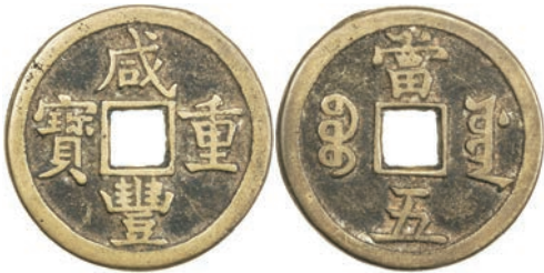
840. QING: Xian Feng , 1851-1861, AE 5 cash, Board of Works mint, Peking, H-22.750, large size planchet, cast 1854-57, VF, ex Jiujinshan Collection $75 - 100