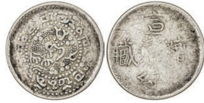
942. TIBET: Xuan Tong , 1909-1911, AR 2 sho (7.67g), ND (1910), Y-6, usual weakness of strike, Fine $200 - 300