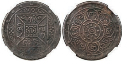
939. TIBET: Xuan Tong , 1909-1911, AE ¼ sho, year 1 (1909), Y-B7, NGC graded F15 BR $100 - 150