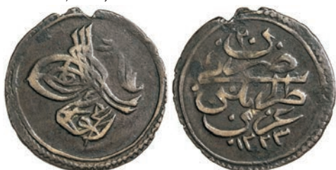
687. TRIPOLI: Mahmud II , 1808-1839, BI 30 para (7.14g), Tarabulus Gharb, AH1222 year 20, KM-179, UBK-118.05, type E, small flan defect near the edge, VF, R $120 - 160