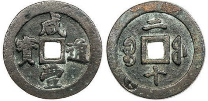
842. QING: Xian Feng , 1851-1861, AE 20 cash (41.64g), Fuzhou, Fujian Province, H-22.781, 46mm, one dot tong , cast 1853-55, interesting chopmark on reverse margin, F-VF $75 - 100