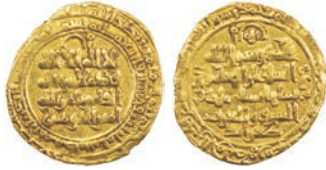
743. GREAT SELJUQ: Tughril Beg , 1038-1063, AV dinar (4.05g), Hamadan, AH452, A-1665, ruler's titles al-sultan al-a'zam / shahanshah malik / al-sharq wa'l-gharb / rukn al-din , choice EF, R $400 - 500