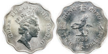
929. HONG KONG: Elizabeth II , 1952-1997, 2 dollars, 1989, KM-60, Mars-C47, rare King's Norton Specimen strike, wonderfully lustrous, PCGS graded Specimen 66 Secure Holder, RR, ex King's Norton Mint Collection $400 - 500 Tied for finest certified at PCGS, none certified with NGC.