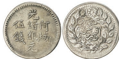
889. SINKIANG: Kuang Hsu , 1875-1908, AR 5 miscals (16.70g), Aksu, AH1311, Y-15, L&M-785, with extra small circle upper right in obverse field, pleasing VF $140 - 180