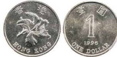
931. HONG KONG: Elizabeth II , 1952-1997, 1 dollar, 1996, KM-69a, rare King's Norton Specimen strike, reflective, PCGS graded Specimen 65 Secure Holder, RR, ex King's Norton Mint Collection $400 - 500