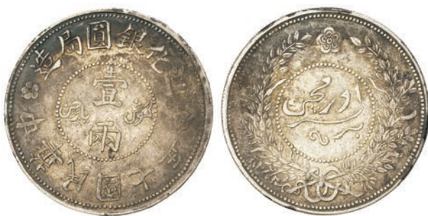
897. SINKIANG: Republic , AR tael (35.24g), Urumchi, year 7 (1918), Y-45.2, L&M-839, EF $250 - 350