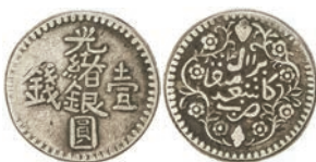
891. SINKIANG: Kuang Hsu , 1876-1908, AR miscal (3.73g), Kashgar, AH1311, Y-16, L&M-690, F-VF $140 - 180