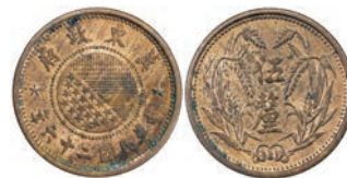
908. EAST HOPEI: AE 5 li , year 26 (1937), Y-516, couple minuscule spots, red & brown UNC $100 - 150