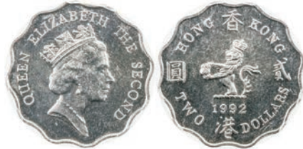
930. HONG KONG: Elizabeth II , 1952-1997, 2 dollars, 1992, KM-60, Mars-C44, rare King's Norton Specimen strike, deep mirrorlike surfaces, PCGS graded Specimen 65 Secure Holder, RR, ex King's Norton Mint Collection $500 - 600 This is the only certified example graded by PCGS, with none certified by NGC.