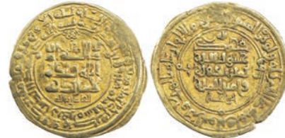
740. GHAZNAVID: Mahmud , 999-1030, AV dinar (4.43g), Herat, AH405, A-1607, interesting ornament right of reverse field, choice VF $220 - 300