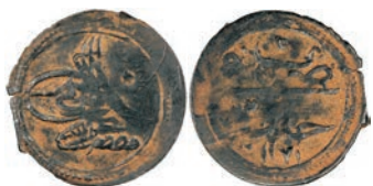
685. SYRIA: Mustafa III , 1757-1774, AE 5 para (1.61g), Halab, AH1171, KM-65, some weakness of strike, but very little actual wear, F-VF, R $100 - 150