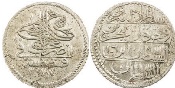
696. TURKEY: Abdul Hamid I , 1774-1789, AR kurush, Kostantiniye, AH1187 year 16, KM-398, USK-22.03, bold strike, UNC $80 - 100