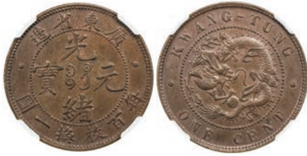
878. KWANGTUNG: Kuang Hsu , 1875-1908, AE cent, ND (1900-06), Y-192, NGC graded MS62 BR $75 - 100