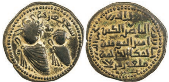
752. ARTUQIDS OF MARDIN: II-Ghazi II , 1176-1184, AE dirham (17.14g), AH579, A-1828.2, SS-32, large & small draped busts facing, superb strike, choice VF $180 - 220

The bottom three lines of the reverse text are hadha al-dirham ma'ūn man yu'ayyaruhu, "cursed is he who abuses this dirham."