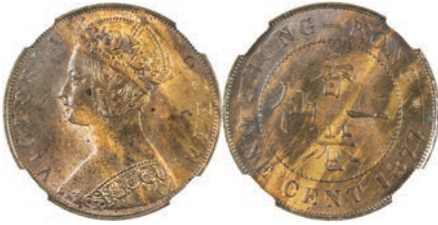
923. HONG KONG: Victoria , 1841-1901, AE cent, 1877, KM-4.2, 15 pearls in crown, NGC graded MS63 BR $150 - 250