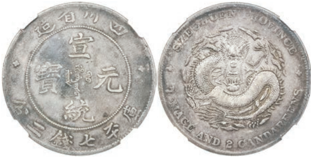
900. SZECHUAN: Hsuan T'ung , 1909-1911, AR dollar, ND (1909-1911), KM-243.1, L&M-352, inverted A instead of V in PROVINCE, NGC graded EF45 $300 - 400