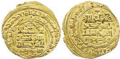
744. GREAT SELJUQ: Bayghu , 1043-1056, AV dinar (3.94g) (Her)at, AH435, A-1669, with titles nasir al-din al-malik al-'adil , off-center strike, VF-EF $300 - 350