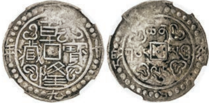
936. TIBET: Qian Long , 1736-1795, AR sho, year 59 (1794), Cr-72, L&M-639, 32-dot variety, NGC graded VF20 $150 - 250