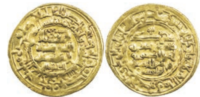
741. GHAZNAVID: Mahmud , 999-1030, AV dinar (4.31g), Herat, AH407, A-1607, VF $200 - 250