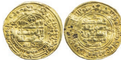
739. GHAZNAVID: Mahmud , 999-1030, AV dinar (3.44g), Herat, AH404, A-1607, light waviness, F-VF $160 - 200