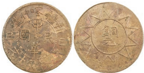
894. SINKIANG: Republic , AE 10 cash, Kashgar, CD1929, Y-B38.6, outlined and finely-rayed sunburst, Chinese legend, xin jiang ka shen sheng zao , some original luster, EF-AU, S $100 - 150