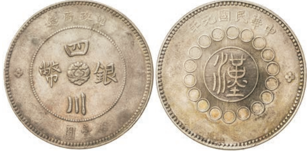
901. SZECHUAN: Republic , AR dollar, year 1 (1912), Y-456, L&M-366, without dots in right character obverse field, EF $150 - 200