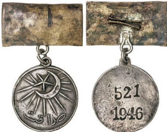
898. SINKIANG: Second East Turkestan Republic , 1944-1949, AR medal (17.81g), 1946, 32mm, with original loop & hanger, shining star & crescent, sadaqat ("loyalty") below in Uighur script // punched date & award number (#521), EF-AU, RR $325 - 425

The East Turkestan Republic orders and medals were all instituted in 1945, the same year the Ili National Army was formed. They are little known and all extremely rare.