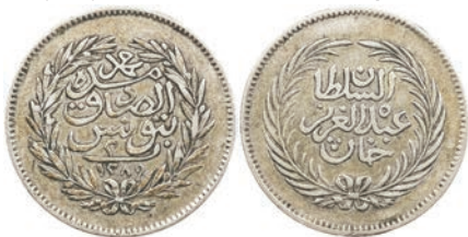
689. TUNIS: Muhammad al-Sadiq , 1859-1882, AR 2 piastres (5.83g), Tunis, AH1289, KM-147a, citing the Ottoman sultan Abdul Aziz, VF $90 - 110