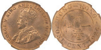
927. HONG KONG: George V , 1910-1936, AE cent, 1926, KM-16, tied with 6 others for highest red-brown grade, NGC graded MS65 RB $75 - 100