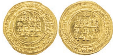
736. KAKWAYHID: Faramurz , 1041-1051, AV dinar (3.95g), Isbahan, AH435, A-1592.2, citing the Great Seljuq overlord Tughril Beg, bow & arrow above obverse field, shams above reverse field, UNC $300 - 400