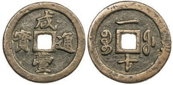
841. QING: Xian Feng , 1851-1861, AE 10 cash (18.78g), Fuzhou, Fujian Province, H-22.780, one dot tong , cast 1853-55, VF $75 - 100