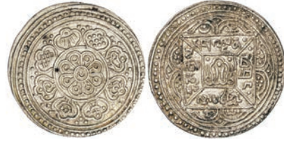
943. TIBET: AR gaden tangka (3.98g), ND (ca. 1909), Y-14, square-in-square obverse, fine silver, EF-AU $150 - 200