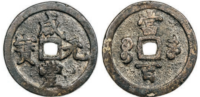
843. QING: Xian Feng , 1851-1861, AE 100 cash (48.81g), Kaifeng and others, Henan Province, H-22.848, 48mm, small characters, cast 1854-1855, VF $75 - 100