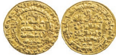
737. GHAZNAVID: Mahmud , 999-1030, AV dinar (4.20g), Nishapur, AH417, A-1606, star below reverse field, EF-AU $250 - 300