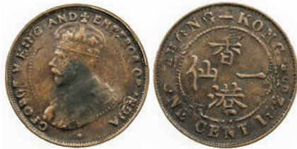
926. HONG KONG: Goerge V , 1910-1936, AE cent (6.99g), 1923, KM-16, overstruck on 10 cash of Hupeh, stain on obverse center, VF, RRR $250 - 350