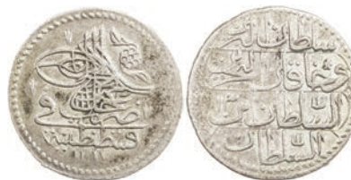
695. TURKEY: Abdul Hamid I , 1774-1789, AR 10 para, Kostantiniye, AH1187 year 13, KM-384, EF $100 - 125