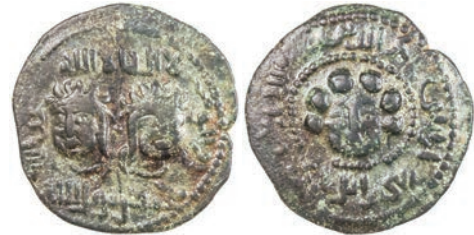
750. ARTUQIDS OF MARDIN: Alpi , 1152-1176, AE dirham (10.33g), NM, ND, A-1827.5, SS-30.2, two facing male busts obverse, facing curly-haired female bust reverse, caliph al-Mustanjid, attractive patination, VF $100 - 125