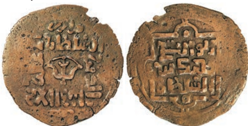
747. KHWARIZMSHAH: Muhammad , 1200-1220, AE broad qarari dirham (3.48g) (Tirmidh), DM, A-A1724, bow & arrow in obverse center, VF, R $100 - 125

This type is either undated or dated AH617, which was the year of Mongol conquest in the region, and the bow & arrow was the Mongol symbol at the time.