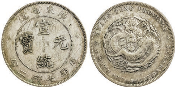
880. KWANGTUNG: Hsuan Tung , 1909-1911, AR dollar (26.62g), ND (1909-1911), Y-206, L&M-138, graffiti consisting of 2 Chinese characters in the obverse field, VF-EF $120 - 160