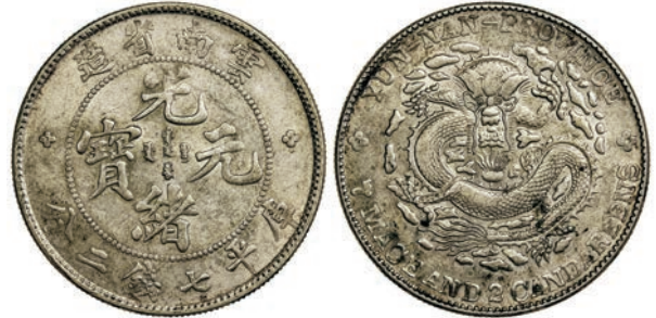
902. YUNNAN: Kuang Hsu , 1876-1908, AR dollar (26.75g), ND (1908), Y-254, L&M-418, some weakness at raised area, due to soft strike, EF-AU $300 - 400