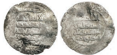
745. GREAT SELJUQ: Barkiyaruq , 1093-1105, AR dirham (2.69g), al-Ahwaz, DM, A-1682C, citing the caliph al-Mustazhir, with Surat al-Ikhlās (Qur'an Sura 112) filling the reverse field, some weakness towards the rim, VF, RRR $100 - 150