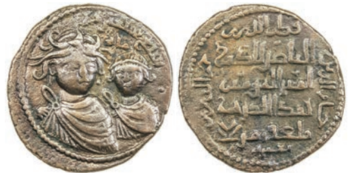
751. ARTUQIDS OF MARDIN: II-Ghazi II , 1176-1184, AE dirham (14.02g), NM, AH577, A-1828.2, large & small draped busts facing, bold strike, with full details in the two heads, choice VF $120 - 180

The bottom three lines of the reverse text are hadha al-dirham ma'ūn man yu'ayyaruhu, "cursed is he who abuses this dirham."