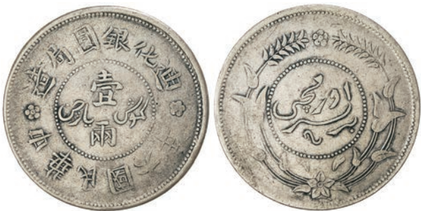
895. SINKIANG: Republic , AR tael (35.10g), Urumchi, year 6 (1917), Y-45, L&M-837, with rosette at top, VF $100 - 150