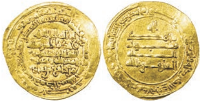
733. ZIYARID: Mardawij , 927-935, AV dinar (4.62g), Hamadan, AH322, A-1530, citing the caliph al-Qahir, nice strike, with full mint & date, excellent VF, RR $500 - 700

Only the mint of Mah al-Basra has become common for this formerly extremely rare ruler. All the other 3 mints, al-Karaj, Qumm and Hamadan, remain rare, with fewer than 10 pieces known for each.