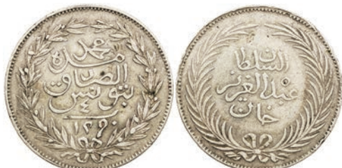
690. TUNIS: Muhammad al-Sadiq , 1859-1882, AR 4 piastres (12.02g), Tunis, AH1290, KM-167, citing the Ottoman sultan Abdul Aziz, choice VF $100 - 125