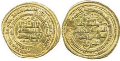
742. GHAZNAVID: Muhammad , 1030, AV dinar (5.55g), Ghazna, Muharram AH421, A-1616, pierced and plugged, VF, RR $400 - 500