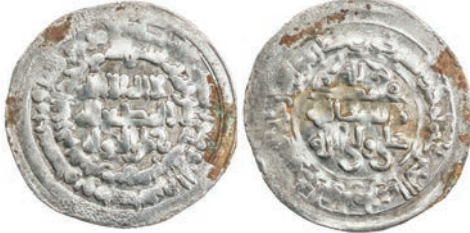
732. BAVANDID OF TABARISTAN: Rustam b. Sharwin , 964-980, AR dirham (3.80g), Firrim, AH363, A-1524, citing the Buwayhid ruler Rukn al-Dawla as overlord, and with the Shi'ite kalima in the reverse field, EF, R $180 - 220