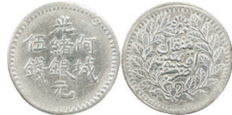
890. SINKIANG: Kuang Hsu , 1875-1908, AR 5 miscals (17.28g), Aksu, AH1311, Y-15, cleaned VF-EF, ex Wa She Wong Collection $150 - 250