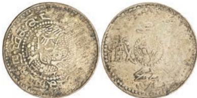
941. TIBET: Xuan Tong , 1909-1911, AR 2 sho, Y-6, L&M-652, usual uneven strike, crude VF $200 - 240