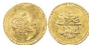
693. TURKEY: Ahmad III , 1703-1730, AV zeri istanbul (3.46g), Islambul, AH1115, KM-173, initial xxxv, a few light scratches in the field, EF $160 - 200