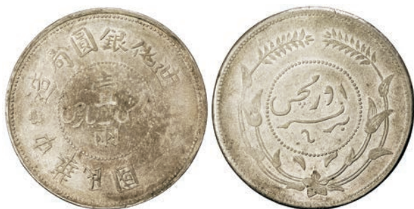
896. SINKIANG: Republic , AR tael (35.34g), Urumchi, year 6 (1917), Y-45.1, L&M-838, without rosette at top, EF $150 - 200