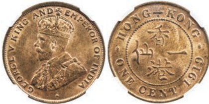
925. HONG KONG: George V , 1910-1936, AE cent, 1919-H, KM-16, mostly red, little brown, NGC graded MS65 RB $200 - 300