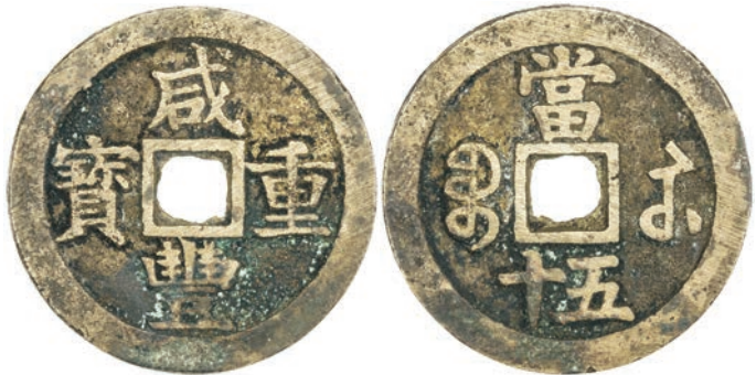
844. QING: Xian Feng , 1851-1861, AE 50 cash, Suzhou mint, Jiangsu Province, H-22.905, 51mm, cast 1854-56, brass ( huang tong ) color, light stain, VF $75 - 100