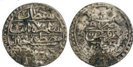
686. TRIPOLI: Selim III , 1789-1807, BI 10 para (2.73g), Tarabulus Gharb, AH1203 year 10, KM-61, mount removed, but basal part still attached, F-VF, R $100 - 125