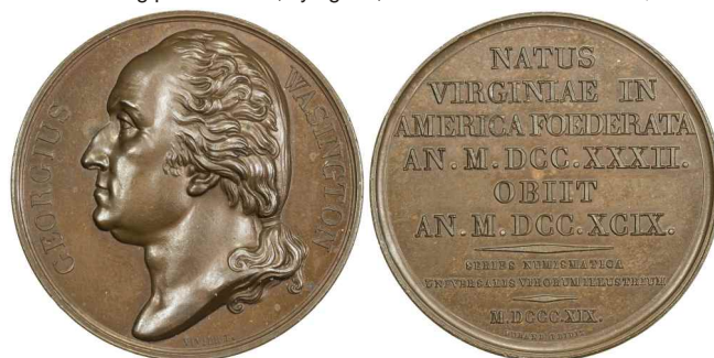
1380. FRANCE: AE medal (39.94g), 1819, 41mm bronze medal of George Washington by Vivier for Durand's "Series Numismatica Universalis Virorum Illustrium", bust left with GEORGIUS WASHINGTON around // NATUS / VIRGINIAE IN / AMERICA FOEDERATA. AN. M. DCC. XXXII. / OBIIT / AN. M. DCC. XCIX. / SERIES NUMISMATICA / UNIVERSALIS VIRORUM ILLUSTRIVM / M.DCCC.XIX., error spelling of "WASHINGTON", MONACHII on edge, choice AU, R $1,200 - 1,500