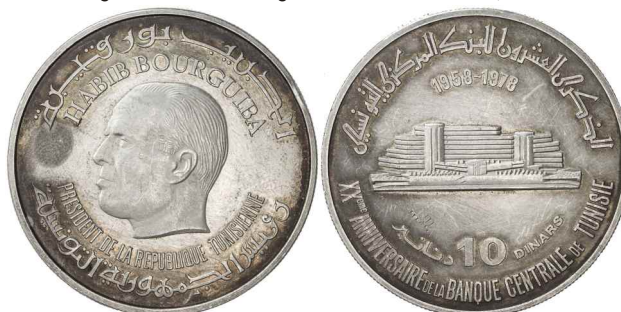
1327. TUNISIA: AR 10 dinars, 1978, KM-345, Schön-243, 20th Anniversary of the National Bank of Tunisia: head of Habib Bourguiba // Central Bank building; mishandled, surface hairlines, AU, R $120 - 160