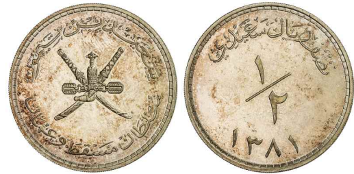
1201. MUSCAT & OMAN: Sa'id bin Taimur, 1932-1970, AR ½ saidi riyal, AH1381, KM-34a, this example being much nicer than usual for proof issues for this type, NGC graded PF64 Cameo $700 - 900