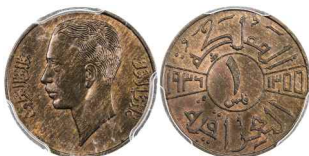
1181. IRAQ: Ghazi I , 1933-1939, 1 fils, 1936//AH1355, KM-102, PCGS graded MS65 RB $150 - 200

An example graded MS64 RB sold in Stephen Album Auction 24, Lot 2082, for $600.