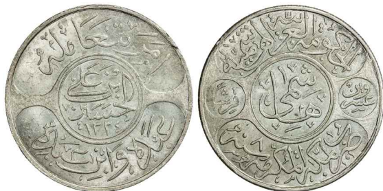
1146. HEJAZ: al-Husayn b. 'Ali , 1916-1924, AR 20 ghirsh, Makka al-Mukarrama (Mecca), AH1334 year 8, KM-30, UNC $500 - 700