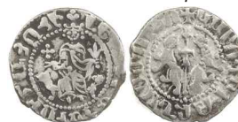
1346. ARMENIA: Levon I , 1198-1219, AR ½ tram (1.52g), Ner-278, king seated on throne // 2 lions back-to-back, VF $120 - 140