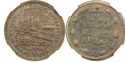
1199. MUSCAT & OMAN: Faisal b. Turkee, 1888-1913, AE ¼ anna, AH1311, KM-2, lovely quality example, NGC graded AU58 BR $200 - 300