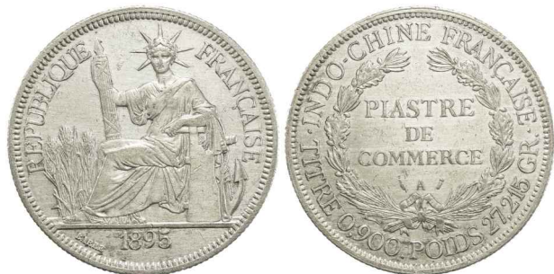
1141. FRENCH INDOCHINA: AR piastre, 1895-A, KM-5, type I reverse legend, cleaned, EF, ex Hans Mondorf Collection $75 - 100