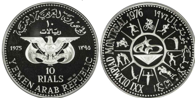
1273. YEMEN: Arab Republic, AR 10 rials (35.54g), 1975/AH1395, KM-16, Montreal Summer Olympic Games, marked .925 fineness, Proof $120 - 160