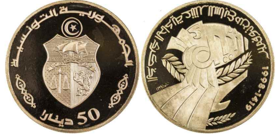
1335. TUNISIA: AV 50 dinars (21.00g), 1998/AH1419, KM-392, 11th Anniversary of the 7th November Coup d'état: national arms // modern stylistic image, legends in Arabic, Proof, RR $1,000 - 1,200