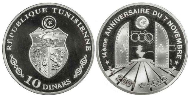
1338. TUNISIA: AR 10 dinars, 2001//AH1422, KM-430, 14th Anniversary of the 7th November Coup d'état: national arms // open door, legends in French, mintage of 400; faint surface hairlines, Proof $100 - 140