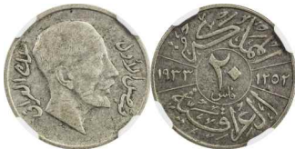
1179. IRAQ: Faisal I , 1921-1933, AR 20 fils, 1933/AH1252, KM-99, error Islamic date (should be 1352, not 1252), NGC graded EF45, R $200 - 300

An example of this error, but only in F-VF condition, sold at Stephen Album Auction 13, Lot 1514, for $320.