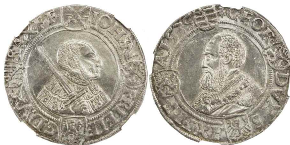
1414. SAXE-ERNESTINE LINE: Johann Friedrich I , Elector, 1532-1547, AR thaler, Annaberg, 1535, Dav-9721, Schnee-72; Schulten-3060, Sachsen-Kurfürstentum issue citing Georg der Bärtige, Duke of Saxony, IOHAN FRI ELE C DVX SAX F F , bare-headed and mantled bust of Johann Friedrich I right, holding sword in right hand upright against right shoulder; around, elements of the coat-of-arms of Sachsen-Kurfürstentum around // GEOR DVX S AX FI F A J535, bare-headed and mantled bust of Georg left, wearing the Order of the Golden Fleece, this is the finest known for this issue, NGC graded MS61 , ex Westfälische Auktionsgesellschaft Sale 43 (24 September 2007), Lot 1117, ex Classical Numismatic Group Triton XII (6 January 2009), Lot 962, realized $2400. $1,700 - 1,900

Johann Frederick I, also called Johann the Magnanimous, or St. Johann the Steadfast (by Lutherans), was Elector of Saxony and Head of the Protestant Confederation of Germany (the Schmalkaldic League). He was known as the "Champion of the Reformation". His cousin Georg "der Bärtige" (the Bearded), a Duke of Saxony and Margrave of Meissen, was a staunch opponent of Martin Luther's Reformation for which he awarded the Order of the Golden Fleece.