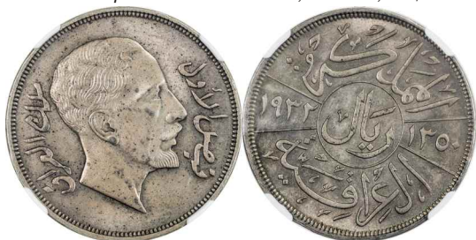
1180. IRAQ: Faisal I , 1921-1933, AR riyal, 1932//AH1350, KM-101, very rare in this quality, with attractive flowery golden toning, NGC graded MS62 $1,200 - 1,600

An example of this error, but only in F-VF condition, sold at Stephen Album Auction 13, Lot 1514, for $320.