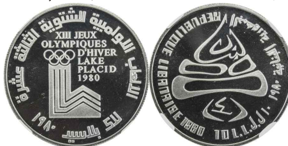
1191. LEBANON: AR 10 pounds , 1980, KM-P2, Winter Olympics - Lake Placid, piéfort issue, NGC graded PF69 UC $150 - 250