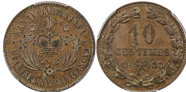
1306. MADAGASCAR: Ravalona III , 1883-1897, AE 10 centimes, 1883, KM-X1, Lec-5, with the letter E for "ESSAI" on reverse, between the 2 halves of the date 1883, PCGS graded Specimen 62 BN Secure Holder $250 - 350