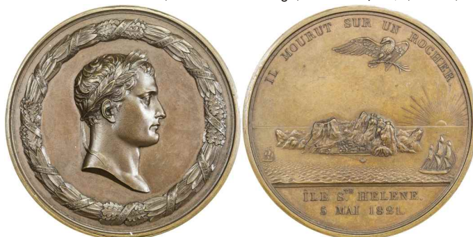
1381. FRANCE: AE medal (170.1g), 1821, Bramsen-1844, Slg. Julius-3715, 69mm bronze medal with laureated head of Napoleon by Andrieu, laureated head right with laurel wreath around bound with ribbon inscribed with his battles won // view of St. Helena with ships in water and radiant sunrise with eagle holding palm frond aloft with IL MOURUT SUR UN ROCHER around and ÎLE Ste. HELENE. / 5 MAI 1821. in exergue, plain edge, Choice AU $300 - 400