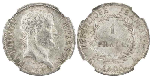
1376. FRANCE: Napoleon I , as Emperor 1804-1814, AR franc, 1808-A, KM-682.1, Gadoury-446, lovely light tone, NGC graded MS63 $300 - 350