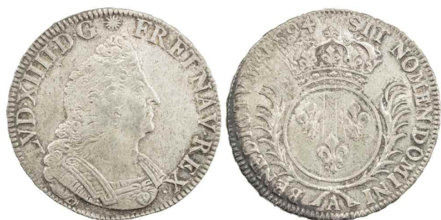
1368. FRANCE: Louis XIV, 1643-1715, AR ecu aux palmes, 1694-A, KM-298.1, Dav-3813, Gadoury-217a-fn, double triangle privy mark, reverse adjustment marks, but no trace of undertype, fresh planchet, original light tone, attractive, EF, R (Gadoury) $750 - 950