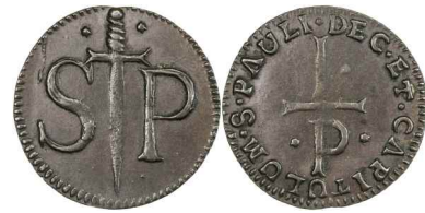
1352. LIÈGE: AE charity token , ND (ca.1650s), Eklund-93, charity token of the Chapter of St. Paul, the sword of St. Paul pointing downwards with flanking S P along blade and a small star at each side of the hilt // I.P. in center with DEC.ET.CAPITULUM.S.PAULI around, choice EF $100 - 150