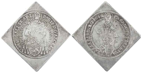
1347. SALZBURG: Parris von Lodron , 1619-1653, AR klippe ¼ thaler, 1642, KM-103, minor faint reverse field scratches, no trace of mounts, VF $300 - 400