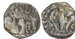
1046. CANDRA: Bhumicandra, ca. 468-475, AR 24 ratti (2.11g), Mitch—, Mahlo-32.2.2, recumbent humped bull right // srivatsa, Fine, RR, ex Hans Mondorf Collection $120 - 160