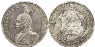
1301. GERMAN EAST AFRICA: Wilhelm II , 1891-1918, AR ½ rupie, 1901, KM-4, PCGS graded MS63 Secure Holder $100 - 150