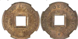
1140. FRENCH COCHINCHINA: AE sapeque essai, 1878, KM-E1, Lecompte-3, coin alignment, some toning, NGC graded MS64 RB, R $1,500 - 2,000