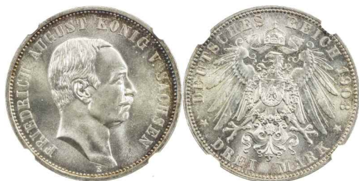
1413. SAXONY: Friedrich August III , 1904-1918, AR 3 mark, 1908-E, KM-1267, J-135, NGC graded MS64 $100 - 150