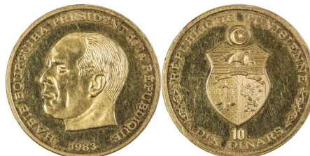
1325. TUNISIA: AV 10 dinars (18.77g), 1983, KM-334, head of Habib Bourguibe // national arms, legends in French, surface hairlines, Proof $850 - 950