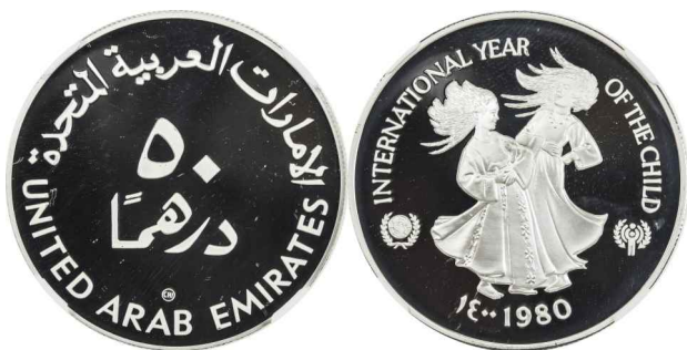
1266. UNITED ARAB EMIRATES: AR 50 dirhams, 1980/AH1400, KM-7, International Year of the Child, a lovely example! NGC graded PF69 UC $125 - 175