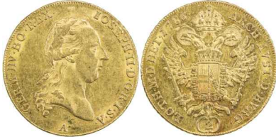
1348. AUSTRIA: Joseph II , 1780-1790, AV 2 ducat, 1786-A, KM-1876, choice EF $600 - 800