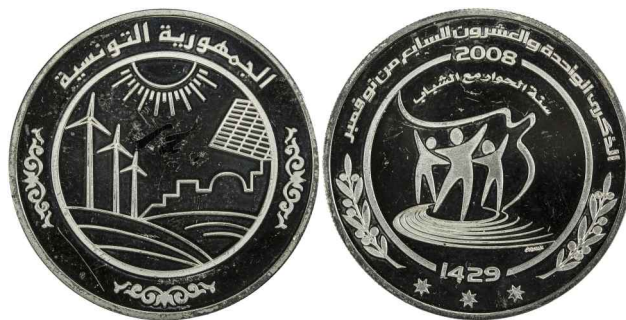
1342. TUNISIA: AR 10 dinars, 2008//AH1429, KM—, 21st Anniversary of the 7th November Coup d'état: energy windmills & solar panel below sun // three dancers, legends in Arabic; surface hairlines, Proof $100 - 140