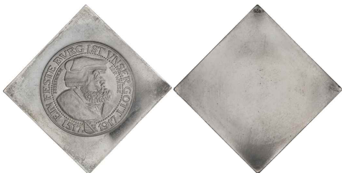
1412. SAXONY: Friedrich August III , 1904-1918, AR klippe 3 mark (20.46g), 1917, as KM-1276, 60mm measured diagonally, uniface restrike of obverse of KM-1276, Jubilee of Reformation, matte finish, prooflike finish on margins and reverse, 925 stamped in small numbers on reverse, beautifully toned, UNC $60 - 100