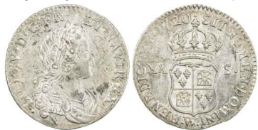
1369. FRANCE: Louis XV, 1715-1774, AR 20 sols de Navarre, 1720-W, KM-440.21, Duplessy-1661, light haymarking, lightly toned, EF-AU $200 - 300

These pieces circulated in Quebec and Nova Scotia.