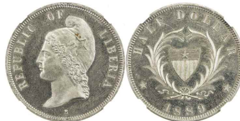
1305. LIBERIA: copper-nickel ½ dollar , 1889-E, KM-Pn41, pattern, NGC graded Proof 65 $400 - 500