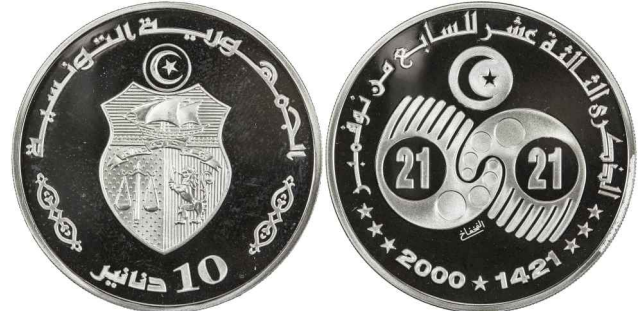
1337. TUNISIA: AR 10 dinars, 2000/AH1421, KM-429, 13th Anniversary of the 7th November Coup d'état: national arms // symbol honoring the 21st century, Proof $150 - 200