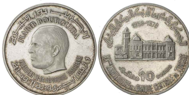
1326. TUNISIA: AR 10 dinars, 1978, KM-344, Schön-245, 20th Anniversary of the National Bank of Tunisia: head of Habib Bourguiba // Sadiki College, surface hairlines, AU, R $140 - 200