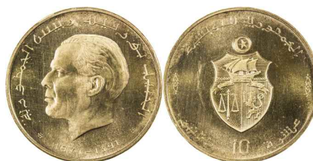
1324. TUNISIA: AV 10 dinars (18.80g), 1971/AH1391, KM-332, head of Habib Bourguibe // national arms, legends in Arabic, minor surface hairlines, Proof $850 - 950