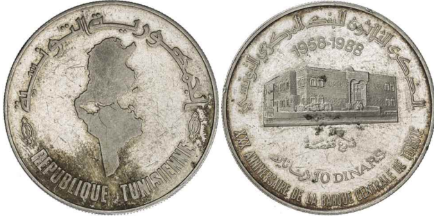
1330. TUNISIA: AR 10 dinars, 1988, KM-364, Schön-268, 30th Anniversary of the National Bank of Tunisia // Bank branch in Gafsa, mintage of 2500; mishandled, surface hairlines, AU, R $120 - 160