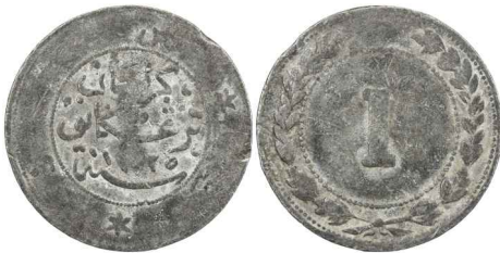
1196. TRENGGANU: Zainal Abidin III, 1881-1918, tin cent (4.85g), AH1325, KM-19, F-VF $90 - 110