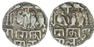
1139. CHOLAS: Rajendra Chola , 1014-1050, AR kahavanu (4.16g), Mitch-Tamil Nadu-332, Chola dynastic emblem composed of a tiger, umbrella and a pair of fish with proto-Nagari legend Gangaikonda Chola or the "conqueror of the Ganga valley" either side, superb strike! VF-EF, R $200 - 300