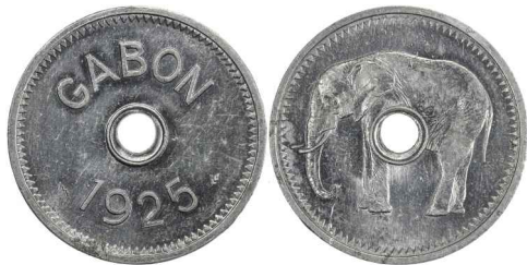
1297. GABON: French Territory , aluminum token, 1925, KM-Tn1, Lecompte-17, Elephant, light oxidation, AU $550 - 750