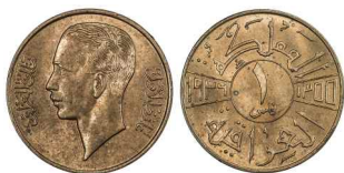
1182. IRAQ: Ghazi I , 1933-1939, 1 fils, 1936/AH1355, KM-102, UNC $75 - 100

An example graded MS64 RB sold in Stephen Album Auction 24, Lot 2082, for $600.