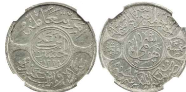
1143. HEJAZ: al-Husayn b. 'Ali , 1916-1924, AR 5 ghirsh, Makka al-Mukarrama (Mecca), AH1334 year 8, KM-28, NGC graded UNC $500 - 700