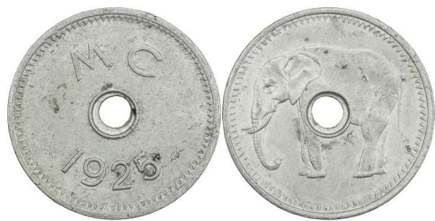
1296. FRENCH CONGO: French Territory , aluminum token (2.88g), 1925, KM-Tn1 (Fr. Eq. Africa), Lecompte-6, M.C. (Moyen Congo, or Middle Congo), Elephant, a couple tiny digs and a few tiny flan flaws, EF, R $200 - 300