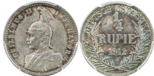
1299. GERMAN EAST AFRICA: Wilhelm II , 1891-1918, AR ¼ rupie, 1912-J, KM-8, PCGS graded MS64 Secure Holder $100 - 150

We know of two specimens graded MS-62, but none higher. This is perhaps the finest example of the type.