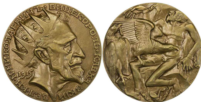
1425. GERMANY: Wilhelm II , 1888-1918, AE medal, 1915, Kienast-168, 57mm, 'Prometheus am Kaukasus' medal by Karl Goetz, Deposition and Enforced Departure for the Caucasus, crowned head right of Grand Duke Nicholas Nikolayevich with Russian legend around // Nicholas depicted as Prometheus, chained to a rock, enduring his punishment as eagles peck at his liver, EF $150 - 250