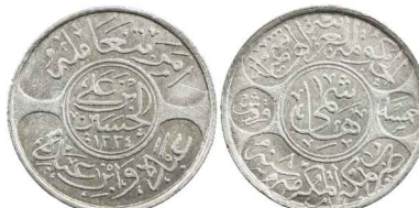
1144. HEJAZ: al-Husayn b. 'Ali , 1916-1924, AR 5 ghirsh, Makka al-Mukarrama (Mecca), AH1334 year 8, KM-28, AU $250 - 350