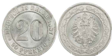
1423. GERMANY: Wilhelm I , 1871-1888, 20 pfennig, 1887-A, KM-9.1, a superb example! PCGS graded MS66 Secure Holder $100 - 125