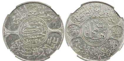
1145. HEJAZ: al-Husayn b. 'Ali , 1916-1924, AR 10 ghirsh, Makka al-Mukarrama (Mecca), AH1334 year 8, KM-29, NGC graded MS61 $500 - 700