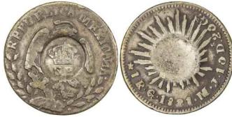
1350. AZORES: AR 120 reis (3.24g), ND, KM-24.1, countermarked crowned G P on Mexico, 1 real, 1831-GoMJ, by order of the decree of 31 March 1887, VF on F-VF host $130 - 170