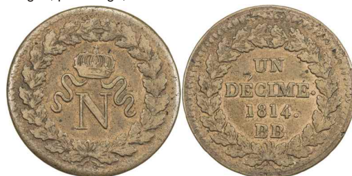
1375. FRANCE: Napoleon I, as Emperor, 1804-1814, AE décime, 1814-BB, KM-700, Gadoury-195b, Strassbourg Provisional issue, VF-EF $150 - 200