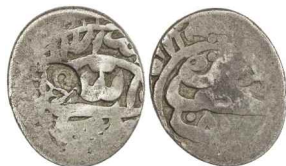
1138. CEYLON (DUTCH): AR mahmudi (3.51g), KM-47, countermarked C / VOC at Colombo, on Safavid mahmudi of Abbas II (1642-1666), mint of Huwayza, Fine on VG host, RR $200 - 300