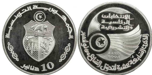
1340. TUNISIA: AR 10 dinars, 2004//AH1425, KM-453, 17th Anniversary of the 7th November Coup d'état: national arms // stylized design, legends in Arabic, mintage of 375; surface hairlines, Proof $100 - 140