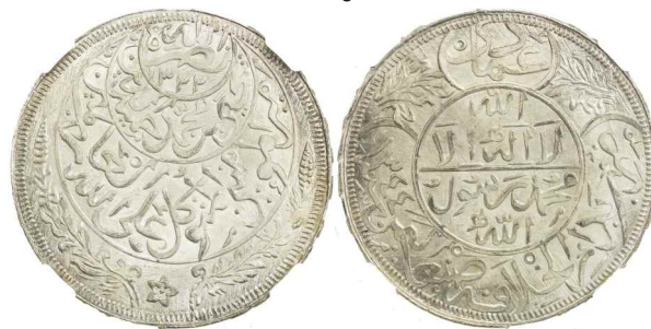
1271. YEMEN: al-Mutawakkil Yahya bin Muhammad, 1904-1948, AR imadi riyal, AH1344, Y-7, bold strike with defect-free surfaces, NGC graded MS66 $300 - 400

The Special Coinage Decoration (Tien): founded in ancient times and reformed by Emperor Minh Mang. Traditionally worn threaded through the suspension cord of the Khanh, later converted for wear from a medal ribbon in the European style. Awarded in three classes, 1) First Class in gold - Kim Tien, 2) Second Class in silver - Ngan Tien, and 3) Third Class in silver - Dong Tien, all obsolete in 1945.