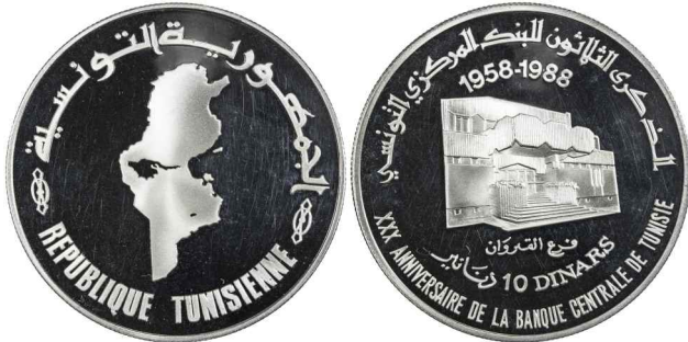
1331. TUNISIA: AR 10 dinars, 1988, KM-365, Schön-269, 30th Anniversary of the National Bank of Tunisia: map of Tunisia // Bank branch in Kairouan; faint surface hairlines, Proof, R $120 - 160