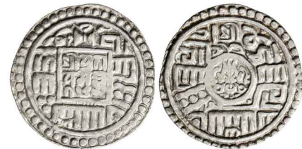
1203. KATHMANDU: Pratapa Malla, 1641-1674, AR mohar (5.33g), NS761 (1641), KM-163, VF-EF $125 - 175