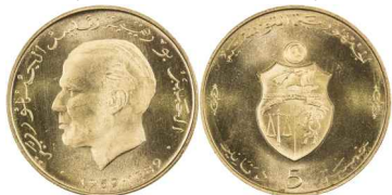
1322. TUNISIA: AV 5 dinars (9.39g), 1969/AH1389, KM-326, head of Habib Bourguibe // national arms, mintage of 550, legends in Arabic, Proof $450 - 550