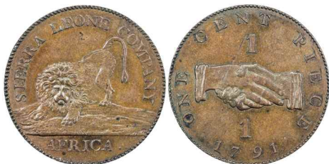
1320. SIERRA LEONE: George III, 1787-1820, AE cent, Soho Mint, Birmingham, 1791, KM-1, Vice-9, Sierra Leone Company issue, lion facing // handshake, choice AU $300 - 400