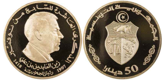
1334. TUNISIA: AV 50 dinars (21.10g), 1997/AH1418, KM-390, 10th Anniversary of the 7th November Coup d'état: bust of the president Zine El Abidine Bin Ali // national arms, legends in Arabic, Proof, RR $1,000 - 1,200