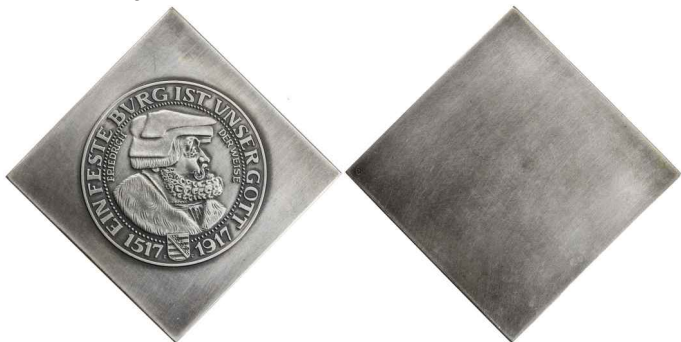
1411. SAXONY: Friedrich August III , 1904-1918, AR klippe 3 mark (21.98g), 1917, as KM-1276, 60mm measured diagonally, uniface restrike of obverse of KM-1276, Jubilee of Reformation, matte finish, 925 stamped in small numbers on reverse, choice UNC $60 - 100

Johann Frederick I, also called Johann the Magnanimous, or St. Johann the Steadfast (by Lutherans), was Elector of Saxony and Head of the Protestant Confederation of Germany (the Schmalkaldic League). He was known as the "Champion of the Reformation". His cousin Georg "der Bärtige" (the Bearded), a Duke of Saxony and Margrave of Meissen, was a staunch opponent of Martin Luther's Reformation for which he awarded the Order of the Golden Fleece.