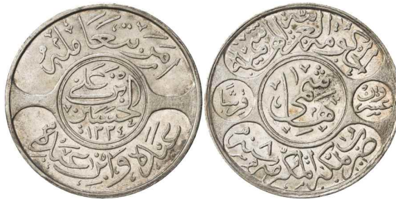
1147. HEJAZ: al-Husayn b. 'Ali , 1916-1924, AR 20 ghirsh, Makka al-Mukarrama (Mecca), AH1334 year 8, KM-30, UNC $300 - 400