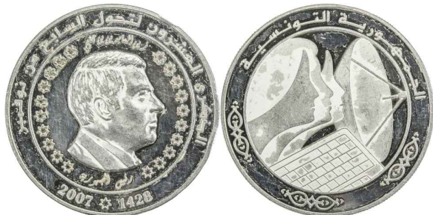
1341. TUNISIA: AR 10 dinars, 2007//AH1428, KM—, 20th Anniversary of the 7th November Coup d'état: head of Zine El Abidine Ben Ali // two profiles, keyboard, satellite receiver, legends in Arabic; heavy surface hairlines, Proof $100 - 140