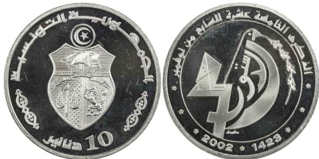
1339. TUNISIA: AR 10 dinars, 2002//AH1423, KM-433, 15th Anniversary of the 7th November Coup d'état: national arms // stylized dove, legends in Arabic, mintage of 490; surface hairlines, Proof $100 - 140