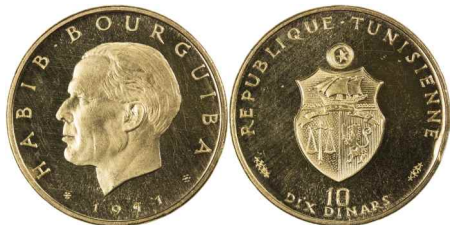
1323. TUNISIA: AV 10 dinars (18.82g), 1971/AH1391, KM-331, head of Habib Bourguibe // national arms, legends in French, tiny rim bump, faint surface hairlines, Proof $850 - 950