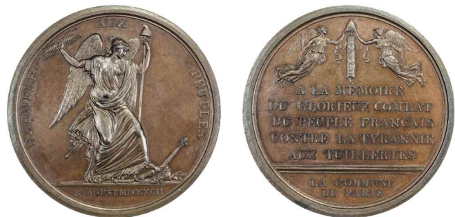
1371. FRANCE: First Republic, AE medal (74.54g), 1792, Hennin-363, 56mm restrike bronze medal for the Storming of the Tuileries on August 10, 1792, winged Liberty holding pike with cap atop in left hand and a lightning rod in right, breaking a scepter under her left foot with crown and Hand of Justice under the scepter // two Victories, holding palms raising the cap of Liberty off fasces, hand privy mark on edge, signifying 1845-60 restrike, ch. AU $150 - 200