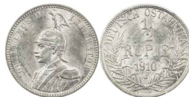
1302. GERMAN EAST AFRICA: Wilhelm II , 1891-1918, AR ½ rupie, 1910-J, KM-9, PCGS graded MS62 Secure Holder $100 - 150