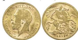
1190. LEBANON: AR ½ sovereign (4.01g), "1912", local imitation of a British half sovereign of George V (KM-819), with fineness indicated as 22 karat and the logo of the manufacturer, believed to have been located in Lebanon 1950s-1960s, weakly struck, but virtually no wear, EF $180 - 220