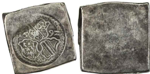
1421. STRASSBURG (BISHOPRIC): Karl , 1592-1607, klippe thaler (28.31g), 1592, KM-MB200, M & M 512/514, siege issue, uneven strike, light tooling, VF $500 - 600

From the siege of Charles III of Lorraine.