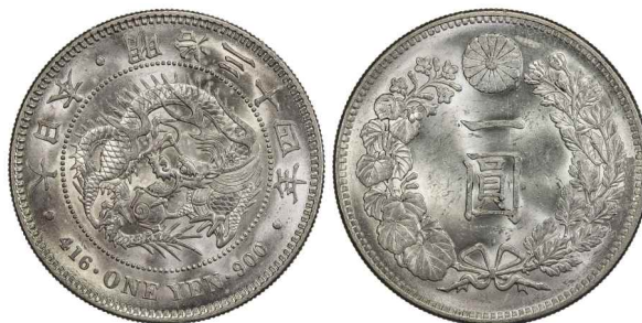
1186. JAPAN: Mutsuhiko , 1897-1912, AR yen, Meiji 34, Y-A25.3, UNC $130 - 170