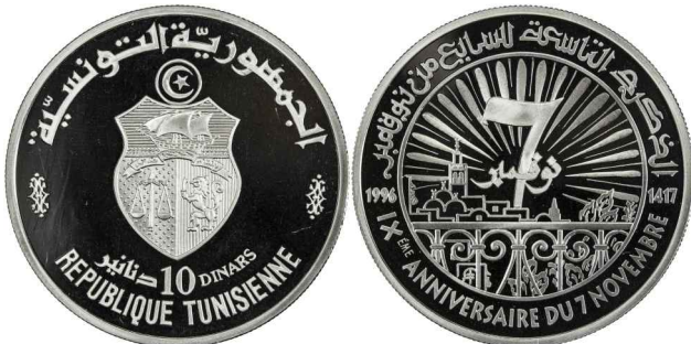
1332. TUNISIA: AR 10 dinars, 1996, KM-371, Schön—, 9th Anniversary of the 7th November Coup d'état: national arms // city view, Proof, RR $150 - 200