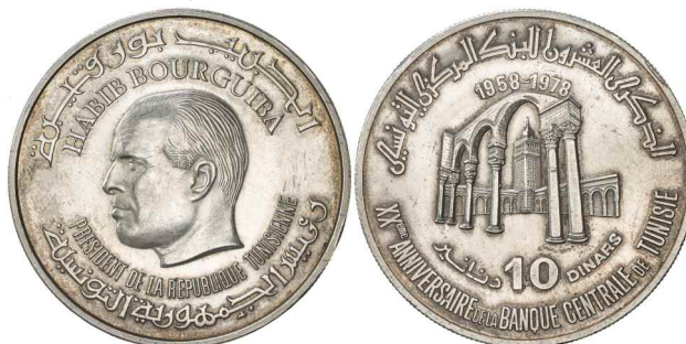
1328. TUNISIA: AR 10 dinars, 1978, KM-356, Schön-244, 20th Anniversary of the National Bank of Tunisia: head of Habib Bourguiba // El Zituna mosque; mishandled, surface hairlines, AU, R $120 - 160