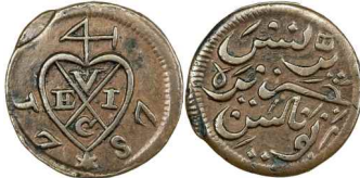
1194. PENANG: AE ½ cent, 1787, KM-2.1, British East India Company issue, VF $100 - 150