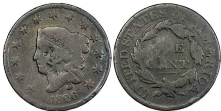
1137. CEYLON: eight spoked wheel (Buddhist Dharmachakra) counterstamped on United States 1826 cent, Fine $100 - 150