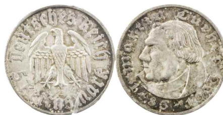
1426. GERMANY: Weimar Republic , AR 5 mark, 1933-E, KM-80, "Martin Luther" commemorative issue, PCGS graded MS63 Secure Holder $100 - 150