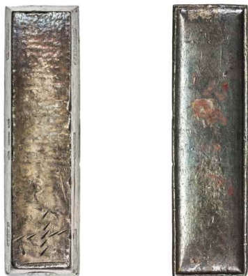
1269. NGUYEN DYNASTY (ANNAM): AR 10 lang (382g), 32x113mm, eight stamps on both sides and one on the end giving purity, weight standard, etc., VF $300 - 400

Resembling a Hang, or small trough for feeding animals, these long, bowed, rectangular bars called nên bac are a distinctly Vietnamese type of semi-official sycee, which was later produced outside Vietnam as well for use in the opium trade.