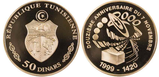
1336. TUNISIA: AV 50 dinars (20.93g), 1999/AH1420, KM-393, 12th Anniversary of the 7th November Coup d'état: national arms // modern stylistic image over a mailbox, legends in French, Proof, RR $1,200 - 1,300