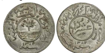
1272. YEMEN: Arab Republic, AR 20 buqsha (5.75g), San'a, AH1382, Y-25.1, thick planchet, UNC $100 - 120