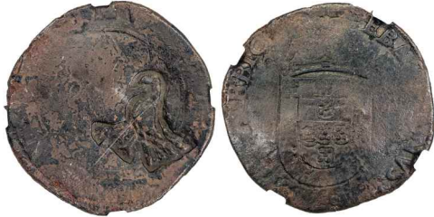
1349. AZORES: António I , 1580-1583, AE 5 reais, ND (1582), Gomes-An 20.01, falcon countermark on undated Portugal Sebastiao I 5 reais (Gomes-Se 21), environmental damage (light oxidation), EF countermark, NGC graded Fine details $175 - 225