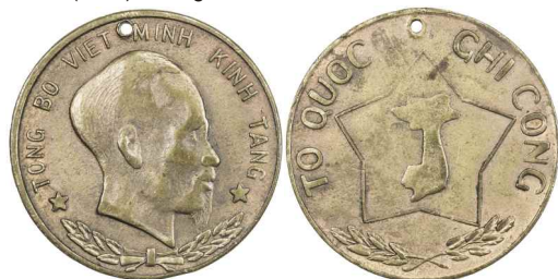
1268. VIET NAM (NORTH): medal (14.07g), ND (1945/6), Daniel-M02, 32mm brass medal of the Viet Minh General Committee, bust right of Ho Chi Minh with * TONG BO VIET MINH KINH TANG * around with stylized laurel sprays at bottom // crude map of Viet Nam within 5-pointed star outline and TO QUOC CHI CONG around with stylized laurel sprays at bottom, holed for suspension (as usual), plain edge, EF $85 - 115