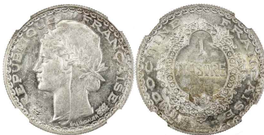
1142. FRENCH INDOCHINA: AR piastre, 1931, KM-19, LeCompte-312, NGC graded MS61, ex Hans Mondorf Collection $75 - 100