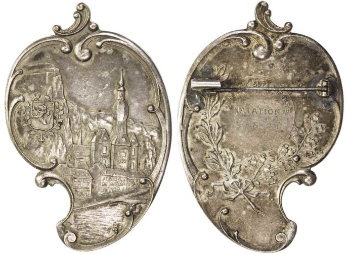
1353. BELGIUM: AR medal (46.86g), [19]21, 69 x 44mm silver medal, unsigned, ornate and made into a brooch, flan is approximately ear-shaped, city on river scene with tower in town and city arms at left // laurel and oak wreath with recessed disc in upper center reading DINANT SUR MEUSE and NATATION / 21-8-2 (engraved), so probably a swimming award, unusual and attractive, EF $150 - 200