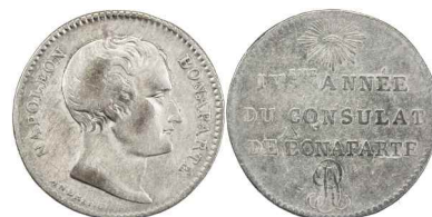
1372. FRANCE: French Directory, AR medalet (5.87g), L'AN 4 (1795-6), Mazard-603, Gadoury-441, essai d'outillage by Andrieu, one franc module, bust right of Napoleon with NAPOLEON BONAPARTE around // (all-seeing eye) / IVeme. ANNÉE / DU CONSULAT / DE BONAPARTE / NR [(script) monogram], corded edge, small reverse nick, VF $175 - 225