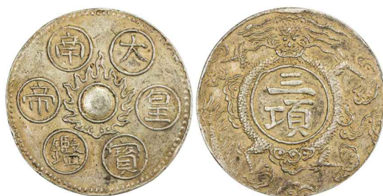
1270. NGUYEN DYNASTY (ANNAM): European style Dong Tien medal, likely early 20th century issue, mount removed at top, EF $150 - 250

The Special Coinage Decoration (Tien): founded in ancient times and reformed by Emperor Minh Mang. Traditionally worn threaded through the suspension cord of the Khanh, later converted for wear from a medal ribbon in the European style. Awarded in three classes, 1) First Class in gold - Kim Tien, 2) Second Class in silver - Ngan Tien, and 3) Third Class in silver - Dong Tien, all obsolete in 1945.