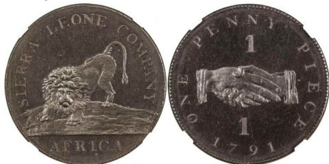
1321. SIERRA LEONE: George III, 1787-1820, AE penny, Soho Mint, Birmingham, 1791, KM-2.1, Sierra Leone Company issue, lion facing // handshake, NGC graded PF64 BR $240 - 300

This denomination bears the date 1791, the date of the re-establishment of Granville Town, Province of Freedom, which was founded in 1787 and destroyed in 1789, but the coins were actually struck in May 1793.