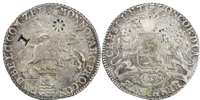
1136. CEYLON: eight spoked wheel (Buddhist Dharmachakra) counterstamped on Zeeland AR ducaton dated 1790 with additional Roman numeral one, VF $150 - 200