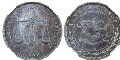
1307. MOMBASA: AE pice , 1888-H, KM-1.3, issued by the Imperial British East Africa Company, lovely sky-blue toning, NGC graded MS63 BR $100 - 150