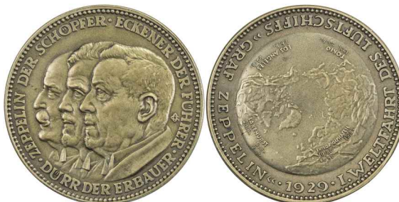
1427. GERMANY: Weimar Republic , AE medal (20.85g), 1929, Kaiser-511.1, 36mm bronze medal for the round-the world flight of the Graf Zeppelin, three side-by-side busts left // globe with landing ports and dates, UNC $100 - 150