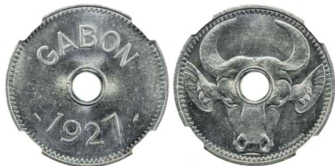
1298. GABON: French Territory , aluminum token, 1927, KM-Tn3, Lec-19, Water Buffalo, NGC graded MS63 $700 - 900

We know of two specimens graded MS-62, but none higher. This is perhaps the finest example of the type.