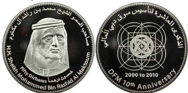
1267. UNITED ARAB EMIRATES: AR 50 dirhams, 2010, KM—, The 10th Anniversary of the Establishment of Dubai Financial Market (DFM), in original box of issue with COA, Proof $100 - 150