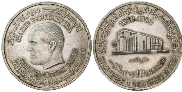
1329. TUNISIA: AR 10 dinars, 1983, KM-314, Schön-256, 25th Anniversary of the National Bank of Tunisia: head of Habib Bourguiba // Bank branch in Gages, mintage of 2500; mishandled, surface hairlines, AU, R $120 - 160