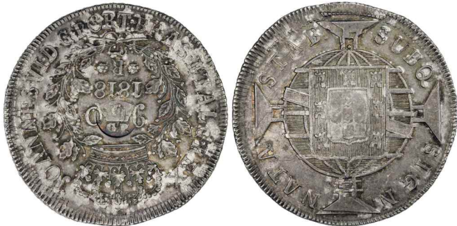
1351. AZORES: Luiz I , 1861-1889, AR 1200 reis, ND [1887], KM-29.5, crowned GP countermark on a Brazil 960 reis of João VI, 1818-R, struck over a Spanish colonial 8 reales, weakly struck countermark, but lovely toned lustrous host coin, EF on AU host $150 - 200