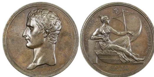
1374. FRANCE: Napoleon I, as First Consul, 1799-1804, AE medal (14.99g), L'AN 4 (1803), Bramsen-275, 33mm bronze medal for the Preparations for the Invasion of England by Brenet, bare bust left with DENON DIREXIT below // Fortune seated right on a ship, holding the tiller and sail, directing and taking as her guide the star of Napoleon with A LA FORTUNE CONSERVATRICE around and L'AN 4. DE / BONAPARTE. in exergue, very nearly uncirculated, traces of old lettering in exergue, plain edge, choice AU $150 - 200