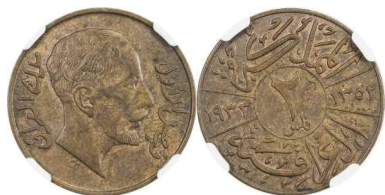
1178. IRAQ: Faisal I , 1921-1933, AE 2 fils, 1933/AH1352, KM-96, NGC graded MS62 BR $80 - 100