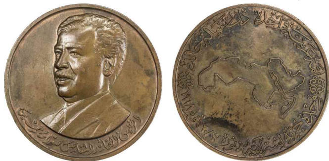
1183. IRAQ: AE medal (165g), 70mm, bust of Saddam Hussein // map of the Arab world, including Mauritania, Somalia, and Sudan, commemorating the 17 July Revolution, which brought the Ba'ath Party into power, EF, R $120 - 160