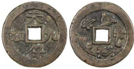
1799. QING: AE charm (6.98g), CCH-672, 29mm, tian bao jiu ru (to live long and have unending good fortune) // five auspicious symbols, VF $75 - 100