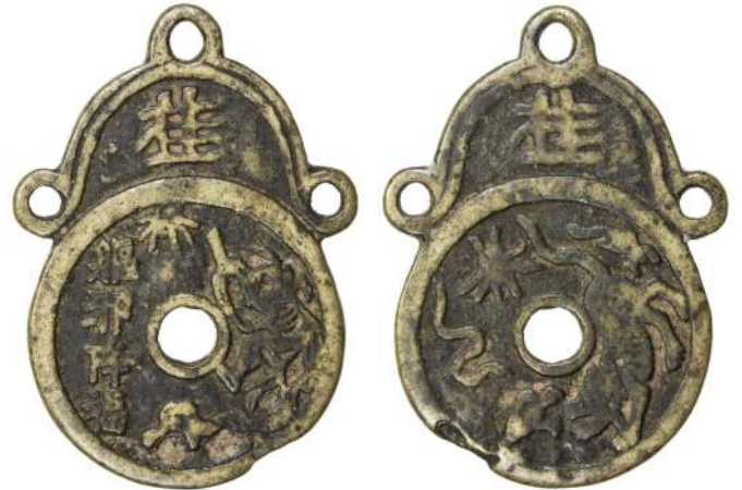
1845. QING: AE charm (34.46g), CCH-2574, 48mm x 68mm, irregular-shaped type "Five Poisonous Creatures" charm, Liu Hai or Zhong Kui standing right, auspicious spider above, qu xie jiang fu (expel evil and send down good fortune) // tiger or cat at right, lizard and spider above, snake at the left of the center hole and the three-legged toad is at the lower left, with character gua "to hang" below top hole, minor casting flaw at bottom, VF $75 - 100

This example is likely cast in the late Qing Dynasty and is often found in Jiangxi Province.