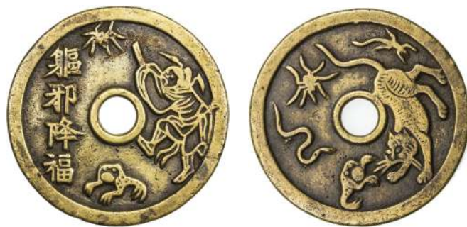
1830. QING: AE charm (24.67g), CCH-1828, 48mm, "Five Poisonous Creatures" charm, Liu Hai or Zhong Kui standing right, auspicious spider above, three-legged toad below, qu xié jiàng fú (expel evil and send down good fortune) // tiger or cat at right, lizard and spider above, snake at the left of the center hole and the three-legged toad is at the lower left, VF $100 - 150

This example was likely cast in the Qing Dynasty. Photo size reduced.