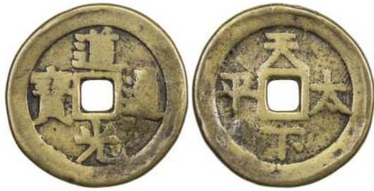
1791. QING: Dao Guang , 1820-1850, AE charm (13.76g), CCH-288, 34mm, "lantern-hanging money", tian xia tai ping (heaven below great peace), bend to planchet, Very Good $100 - 200