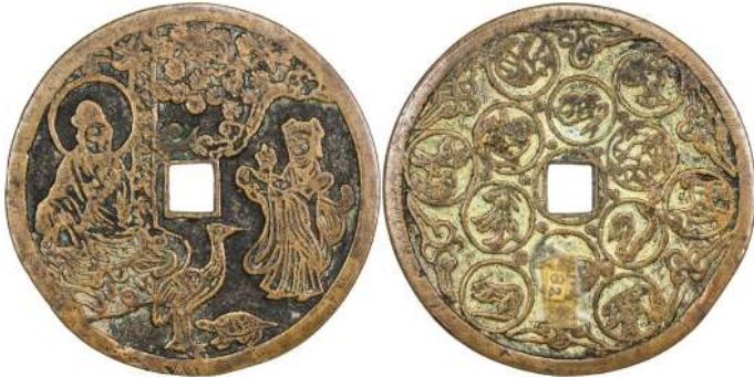
1726. SONG: AE charm , CCH-2007, 78mm, two Chinese "immortals" with tortoise and crane below // the twelve animals of the Chinese zodiac, the Rat, Ox, Tiger, Rabbit, Dragon, Snake, Horse, Sheep, Monkey, Rooster, Dog and Pig, VF, R $100 - 150

In 917, Liu Yan (Lie Zu) proclaimed himself Emperor of a dynasty at first called the Great Yue, then the Han, and set up his capital at Canton, which he renamed Xingwangfu. He cast the qian heng zhong bao in both bronze and lead, the bronze being quite rare.