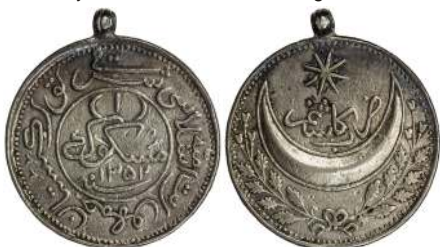
1910. ISLAMIC REPUBLIC OF EAST TURKESTAN: Hoja Niyaz Haji , 1933-1934, AR miscal (8.76g), Kashgar, AH1352, Y-E39, L&M-775A, 8-pointed star & crescent with zarb kashgar (struck in Kashgar) between, oak wreath around // Uyghur legend sharket turkhestan cumhuriyet islamiyesi (Islamic Republic of East Turkestan) around central circle, with (1) muskuk sanah 1352 within, eight-rayed sun variety, faint trace of cleaning on the obverse, mounted, given a details grade by PCGS due to the mounting, PCGS graded Genuine EF details, RRR $4,000 - 5,000