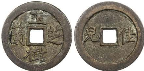
1815. QING: AE charm (15.71g), CCH-1123 Vol. 2, yu shu zhi lan (a talented young man of noble character) // jia ér, Very Good $100 - 200

This example was likely cast in the late Qing Dynasty or early Min Guo (Republic) period.