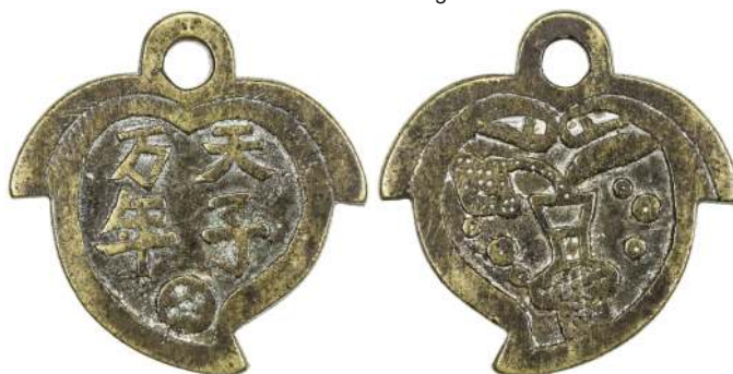
1833. QING: AE charm (34.24g), CCH-2393, 50mm, peach-shaped charm, tian zi wan nian (May the Emperor [Son of Heaven] live for a myriad [10,000] of years) // vase, VF $75 - 100

This example is was likely cast in the late Qing Dynasty and is often found in Jiangxi Province.