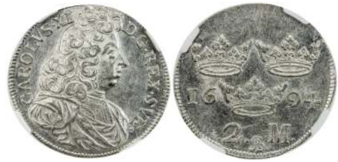
1415. SWEDEN: Karl XI , 1660-1697, AR 2 mark, Stockholm, 1694, KM-282.1, NGC graded AU58 $200 - 250