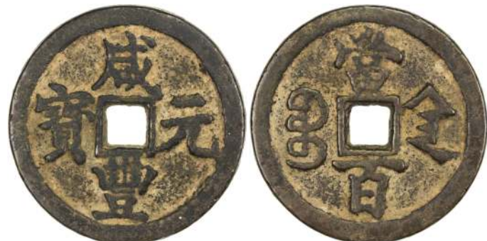
1762. QING: Xian Feng , 1851-1861, AE 100 cash, Xi'an mint, Shaanxi Province, H-22.950, Cr-23-8.2, 51mm, cast in 1854, brass ( huáng tóng ) color, F-VF $100 - 150