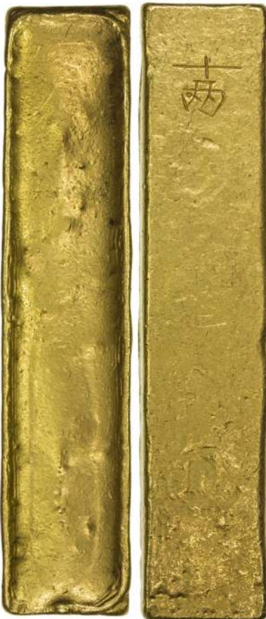
1779. QING: AV rectangular cast ingot (372.51g), 25mm x 117mm x 9.5mm, undated gold bar circa 1745, weight equal to approximately 10 taels ( liang ), cast in a flat "Hershey" bar shape without characters on top, having engraved Chinese characters shi liang (ten taels) at top on back, character shi (ten) engraved on left side, ri engraved on right side, EF, RRRR $25,000 - 30,000

As with lots 1775, 1776 and 1777, this is nearly identical to the bars from the wrecks of the French East India Company vessel de Conty , and to the Dutch East-Indiaman Geldermalsen .