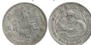
1896. KIRIN: Hsuan Tung , 1909-1911, AR 20 cents, ND (1909), Y-22.2, L&M-15, cleaned, PCGS graded AU details $150 - 250