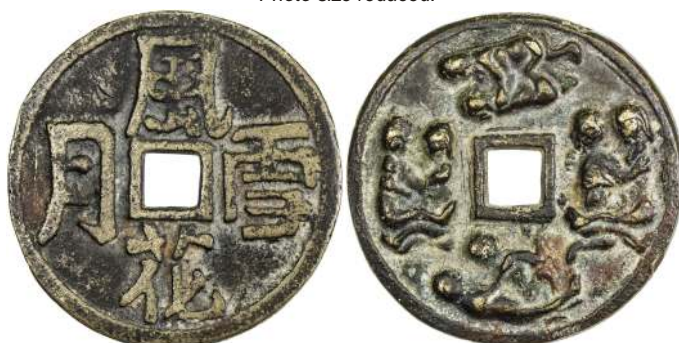
1810. QING: AE charm (60.11g), CCH-907, Vol. 2, 60mm, Marriage type charm, feng hua xue yue (wind, flowers, snow, moon) // four couples engaged in coitus, VF $75 - 100