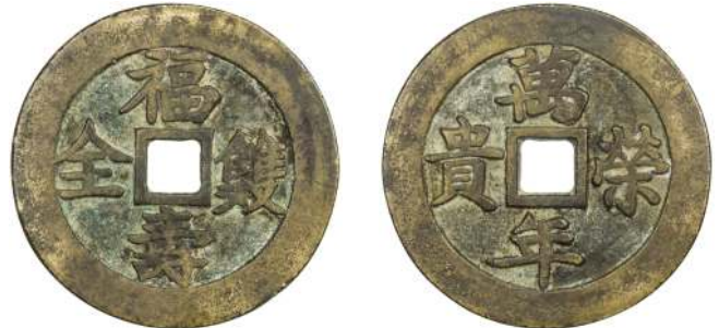
1819. QING: AE charm (33.87g), CCH-1524, 51mm, wàn nián róng guì (a myriad [10,000] of years, glory and honor) / fú shòu shuang quán (happiness and longevity both complete), VF $100 - 150

This example was likely cast in the Qing Dynasty. Photo size reduced.