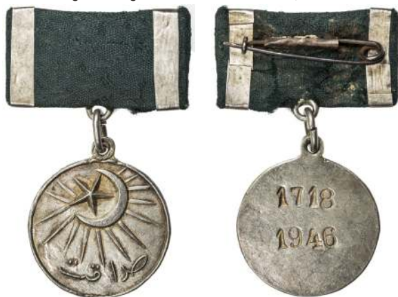
1911. SECOND EAST TURKISTAN REPUBLIC : 1944-1949, AR medal, 1946, 32mm, with original loop and ribbon, shining star & crescent, sadaqat ("loyalty") below in Uyghur script // punched date & award number (#1718), choice EF, RR $400 - 500

The East Turkestan Republic's Orders and medals were all instituted in 1945, the same year as the Ili National Army was formed. They are little known and all are extremely rare. This is the first example we have seen with the original ribbon, clipped to the hanger with a old paperclip.