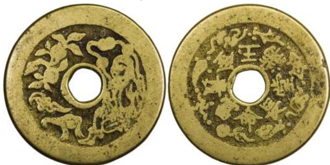
1828. QING: AE charm (19.39g), CCH-1799, 43mm, Liu Hai playing with toad // jin yu man tang chang ming fu gui (enjoy long life and prosperity), Fine $75 - 100

I.S. Coushnir published a short catalog, Chinese Coins Without Currency, of mostly Chinese openwork charms documenting 36 charms and amulets. Published in The China Journal, Vol. XVII, No. 6, December 1932.