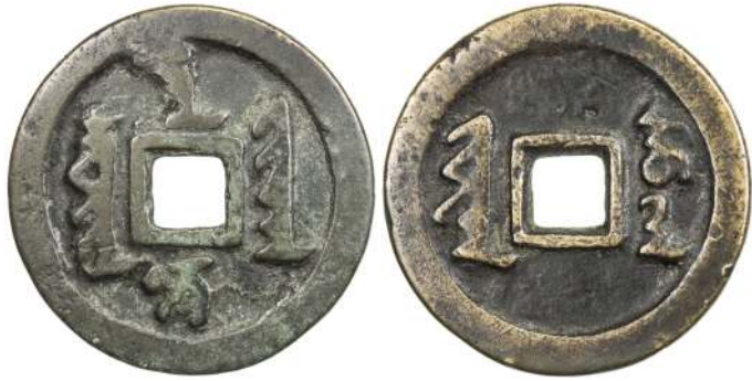
1732. QING: Abahai , 1627-1643, AE 10 cash (26.63g), H-22.8, 44mm, sure han ni jiha in Manchurian script, on reverse juwan (ten [cash]) at left, emu yan (one liang [of silver]) at right, F-VF, RR $600 - 700