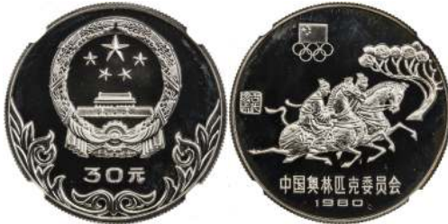
1921. CHINA (PEOPLE'S REPUBLIC): AR 30 yuan, 1980, KM-35, Moscow Olympics-Equestrian, NGC graded PF68 Ultra Cameo $100 - 125