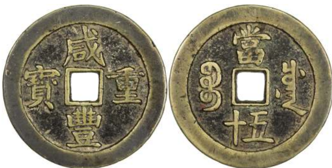
1765. QING: Xian Feng , 1851-1861, AE 50 cash, Chengdu, Sichuan Province, H-22.980, Cr-24-6, 50mm, cast 1853-54, brass (huáng tóng) color, F-VF $100 - 150