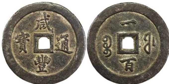
1746. QING: Xian Feng , 1851-1861, AE 100 cash, H-22.784, 72mm, cast 1853-55, copper ( tóng ) color, VF $1,500 - 1,700