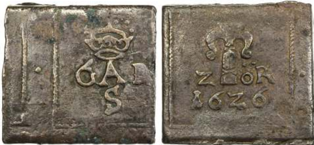
1413. SWEDEN: Gustaf II Adolf , 1611-1632, AE square 2 öre (51.19g), Säter & Nyköping, 1626, KM-107, well-centered strike for this rare type! VF, RR $400 - 600