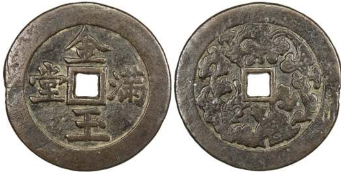
1814. QING: AE charm, CCH-1072, 74mm, jin yu man tang (may gold and jade fill your house [halls]) // auspicious clouds, Fine $100 - 150