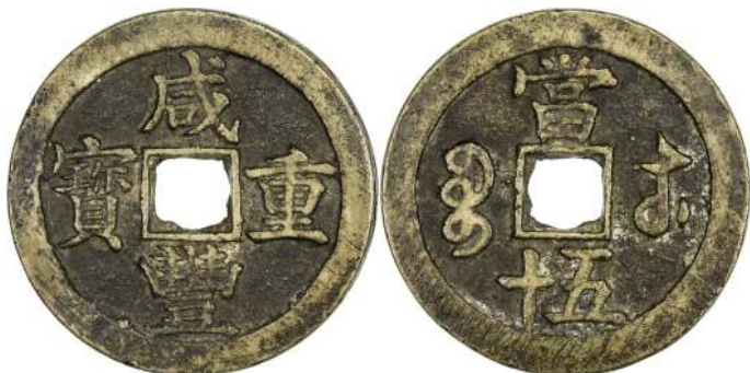
1757. QING: Xian Feng , 1851-1861, AE 50 cash, Nanchang mint, Jiangxi Province, H-22.904, Cr-16-9.2, 53mm, cast 1854-55, brass ( huáng tóng ) color, VF $100 - 150