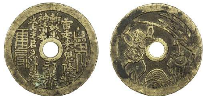
1831. QING: AE charm, CCH-1934, 56mm, Lei Ling "Daoist curse charm", lei zou sha gui jiang jing / zhan yao chu xie yong bao / shen qing feng / tai shang lao jun ji ji zhi ling (God of Thunder (Lei) clear out and kill the ghosts and send down purity. Behed the demons, expel the evil and keep us eternally safe. Let this command from Lao Zi be executed quickly.) // Liu Hai and the Three-Legged Toad on the reverse, VF $75 - 100

This example was likely cast in the Qing Dynasty. Photo size reduced.