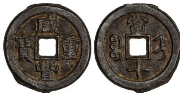
1770. QING: Xian Feng , 1851-1861, iron 10 cash, Baoding mint, Zhihli Province, H-22.1055, Cr-5-5a, cast 1855-57, VF $75 - 100