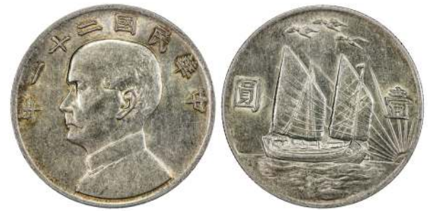
1867. CHINA: Republic , AR dollar, year 21 (1932), Y-344, L&M-108, birds over junk type, PCGS graded AU58 $1,800 - 2,000