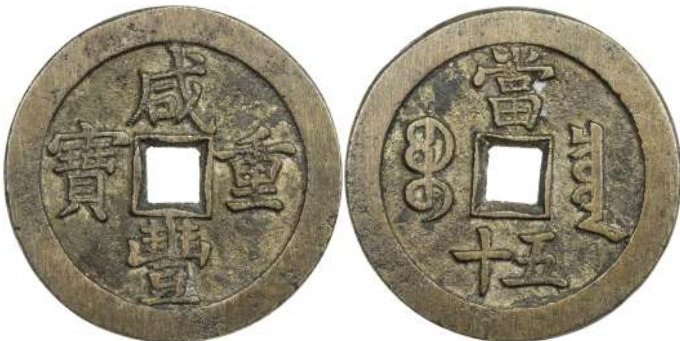
1735. QING: Xian Feng , 1851-1861, AE 50 cash, Board of Revenue mint, Peking, H-22.707, Cr-1-7.1, 48mm, West branch mint, cast 1854-55, brass ( huáng tóng ) color, EF $100 - 150