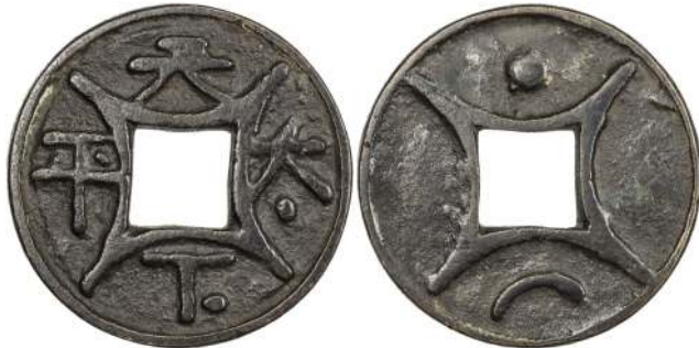
1816. QING: AE charm (22.88g), CCH-1168, Vol. 2(var), 41mm, tian xia tai ping (heaven below great peace) // dot above, crescent below, VF $75 - 100

This example was likely cast in the late Qing Dynasty or early Min Guo (Republic) period.