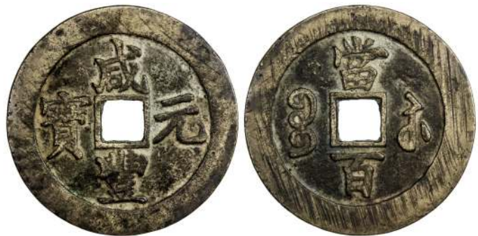
1759. QING: Xian Feng , 1851-1861, AE 100 cash, Suzhou mint, Jiangsu Province, H-22.919, Cr-16-10, 61mm, cast 1854-55, brass ( huáng tóng ) color, VF $75 - 100