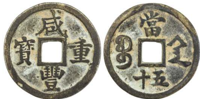
1761. QING: Xian Feng , 1851-1861, AE 50 cash, Xi'an mint, Shaanxi Province, H-22.949, 49mm, cast in 1854, brass ( huang tóng ) color, attractive patina, VF $100 - 150