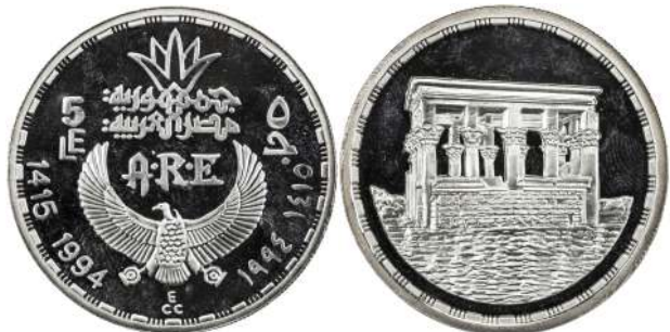
1645. EGYPT: AR 5 pounds , 1994/AH1415, KM—, Philae temple, unlisted by KM, Proof, R $100 - 120