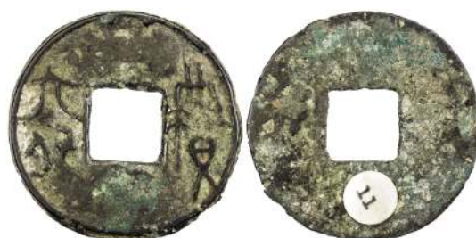
1706. WARRING STATES: State of Qi, 300-220 BC, AE cash (7.59g), H-6.25, yi liu hua ([City of] Yi, [value] six hua) in archaic script, VF, ex Jiùjinshan Collection $200 - 300