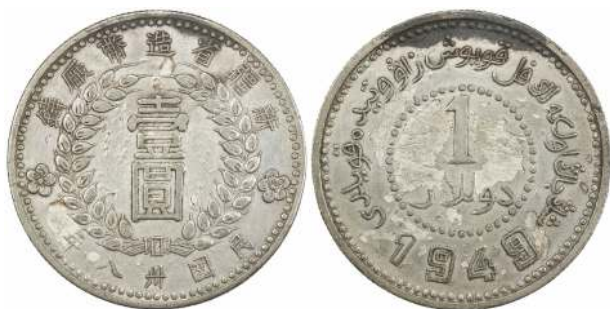
1909. SINKIANG: Republic , AR dollar, 1949, Y-46.2, L&M-842, pointed base 1 variety, lamination defects and light hornsilver, EF$100 - 125