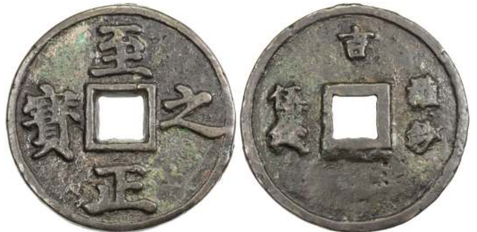
1730. YUAN: Zhi Zheng , 1341-1368, AE 5 qian (mace) (154g), H-19.124, 78mm, ji above, denomination wu qian ("five mace") to left, quan chao ("equivalent in paper money") to right, VF, RRR $2,500 - 3,500

In 1350 chancellor Toqto'a (Tuotuo) attempted to reform the Yuan dynasty currency by printing more paper money and creating large "Zhi Zheng Zhi Bao" copper coins which were inscribed with the promise that these coins were backed in paper money, and that these would be in equal value. As the paper money was made out of inferior material it would often be easily damaged making it hard for the people to redeem. This led to rebellions in the southern regions which in turn caused the Yuan government to quickly print more money in order to finance its military expenditures, leading to a decreasing confidence in paper money causing hyperinflation. Eventually entire carts filled with banknotes were needed for simple transactions leading to the people disregarding paper money as currency and eventually barter had become the norm as coinage had already become a rarity.