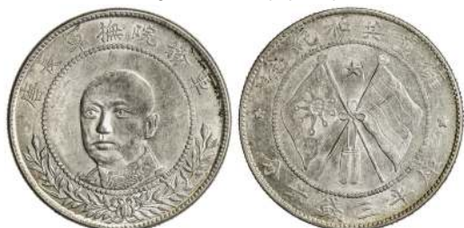
1912. YUNNAN: Republic , AR 50 cents, ND (1917), Y-479.1, L&M-863, General T'ang Chi Yao, PCGS graded MS61 $200 - 300

The East Turkestan Republic's Orders and medals were all instituted in 1945, the same year as the Ili National Army was formed. They are little known and all are extremely rare. This is the first example we have seen with the original ribbon, clipped to the hanger with a old paperclip.