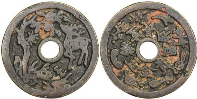
1802. QING: AE charm (25.87g), CCH-812, 45mm, deer and tree // chang ming fu gui jin yu man tan (longevity, wealth and honor and may gold and jade fill your house), VF $75 - 100

Eight Treasure Charm; surrounding the outer rim are eight treasures starting at the one o'clock position and going clockwise are the pearl (flaming pearl), the silver ingot (sycee or yuan bao), the double lozenge, the coral, a single rhinoceros horn, the writing brush and Chinese ink, the precious mirror, and the sceptre (ruyi). The picture of the deer is expressing a wish for a top government office with a high salary, and a wish for longevity. Just below the deer's front hoof is an "upside down" bat. Located at the bottom of the charm and near the tree is the lingzhi or "fungus of immortality". The deer is believed to be the only animal able to find this magical plant.