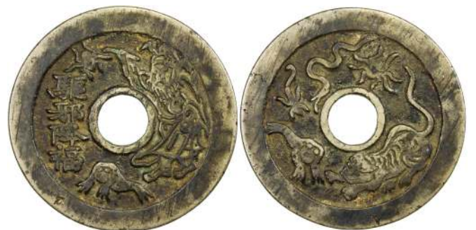
1782. QING: AE charm (16.64g), Mandel-11.2.6, 42mm, "Five Poisonous Creatures" charm, Liu Hai or Zhong Kui standing right, qu xie jiang fu (expel evil and send down good fortune), auspicious spider upper left, toad lower left // the large animal at the right is a tiger or cat and counterclockwise; spider, snake, lizard and the three-legged toad, VF $75 - 100

One of the most dangerous and inauspicious days of the year in ancient China was the 5th day of the 5th month, according to the lunar calendar. This day marked the beginning of summer which by midseason meant dangerous animals and insects, the spread of infectious diseases, and the appearance of evil spirits. Charms of these types were often hung in Chinese homes to protect the family from evil spirits and poisonous animals associated with this unlucky day.