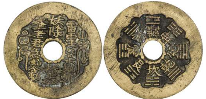
1825. QING: AE charm (18.68g), CCH-1776 var, 42mm, Lei Ling "Daoist curse charm", lei zou sha gui jiang jing / zhan yao chu xie yong bao / shen qing feng / tai shang lao jun ji ji zhi ling which translates as "God of Thunder (Lei) clear out and kill the ghosts and send down purity / Behead the demons / Expel the evil and keep us eternally safe / Let this command from Lao Zi be executed quickly" // eight trigrams with inscription qian kan gen zhen xun li kun dui around, engraved into eight-sided floral shape, a choice example! EF $75 - 100