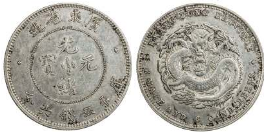
1899. KWANGTUNG: Kuang Hsu , 1875-1908, AR 50 cents, ND (1890-1905), Y-202, L&M-134, lightly toned with majority of luster remaining beneath, cleaned, PCGS graded Genuine AU details $400 - 500