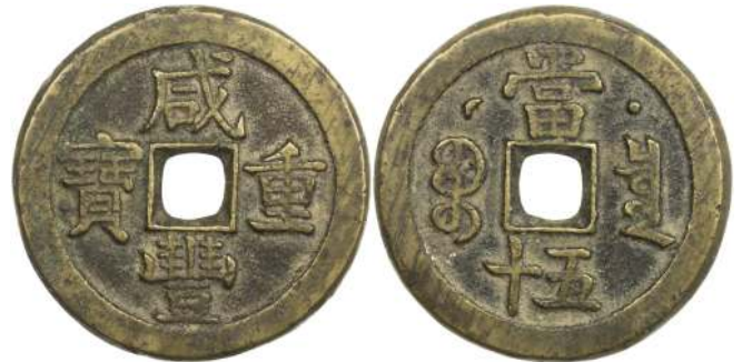
1737. QING: Xian Feng , 1851-1861, AE 50 cash, Board of Revenue mint, Peking, H-22.716, Cr-1-7.2, 42mm, Prince Qing Hui mint, 'sun & moon' above, cast May-August 1854, brass ( huáng tóng ) color, EF $100 - 150