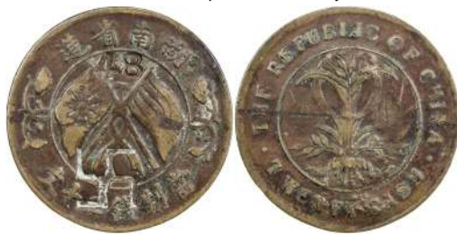
1872. CHINA: AE token, countermarked swastika and number 48 on Republican 20 cash of Hunan Province, perhaps for use as a check or token in a Buddhist temple or monastery, VF $75 - 100