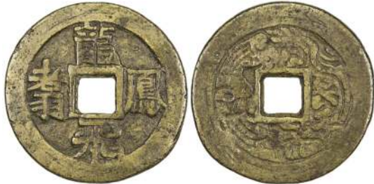
1800. QING: AE charm (12.87g), CCH-696, 34mm, long fei feng zhu (the dragon flies and the phoenix soars) // dragon & phoenix design, F-VF $75 - 100