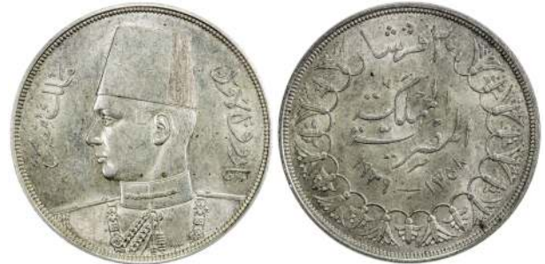
1635. EGYPT: Farouk , 1936-1952, AR 20 piastres, 1939/AH1358, KM-368, PCGS graded AU55 $130 - 170