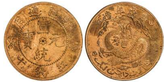
1904. SINKIANG: Hsuan Tung , 1909-1911, AE 10 cash, CD1910, Y-2a, 1960's fantasy restrrike, PCGS graded MS64+ $100 - 150