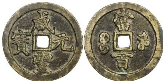
1754. QING: Xian Feng , 1851-1861, AE 100 cash, Kaifeng mint, Henan Province, H-22.849, Cr-11-5, 49mm, cast 1854-55, brass ( huáng tóng ) color, VF $75 - 100