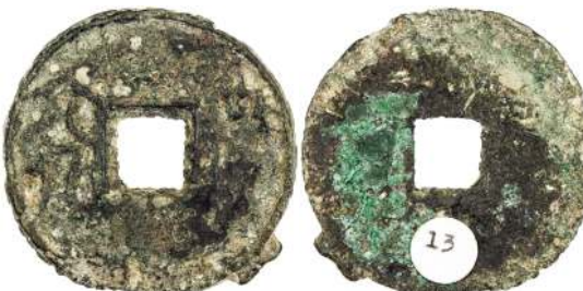
1709. WARRING STATES: State of Qi, 300-220 BC, AE cash (9.98g), H-6.25, yi liu hua ([City of] Yi, [value] six hua) in archaic script, Fine, ex Jiùjinshan Collection $100 - 150