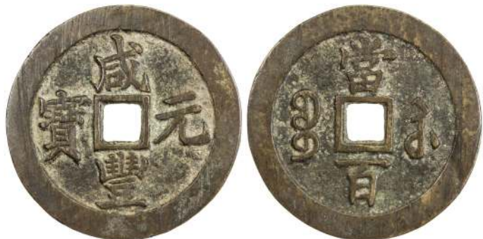
1758. QING: Xian Feng , 1850-1861, AE 100 cash, Suzhou mint, Jiangsu Province, H-22.914, 60mm, brass ( huáng tóng ) color, cast 1854-55, VF $125 - 175