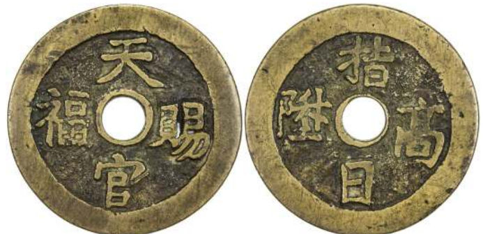
1820. QING: AE charm, CCH-1533 var, 46mm, tian guan ci fu (may the Ruler of Heaven bestow good fortune) // zhi ri gao sheng (rapid and lofty promotion), Fine $100 - 150