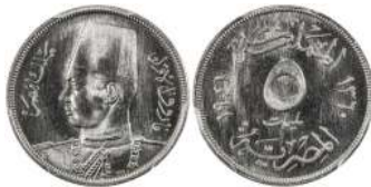
1631. EGYPT: Farouk , 1936-1952, 5 milliemmes, 1941/AH1360, KM-363, PCGS Specimen pop-4/4, total 21, PCGS graded Specimen 65, ex King's Norton Mint Collection $300 - 400