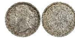
1927. HONG KONG: Victoria, 1841-1901, AR 5 cents, 1872/68-H, KM-5, cleaned, PCGS graded AU details $600 - 800