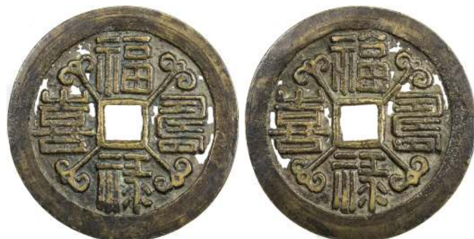
1808. QING: AE charm (33.31g), CCH-865, Vol. 2, 56mm, fu lu shou xi (good fortune, emolument [official salary], longevity and happiness) either side in seal script, several natural casting holes, VF-EF, RR $75 - 100

This example was likely cast in the late Qing Dynasty or early Min Guo (Republic) period.