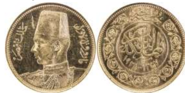
1639. EGYPT: Farouk , 1936-1952, AV 100 piastres, 1938/AH1357, KM-372, NGC graded MS64 $600 - 700