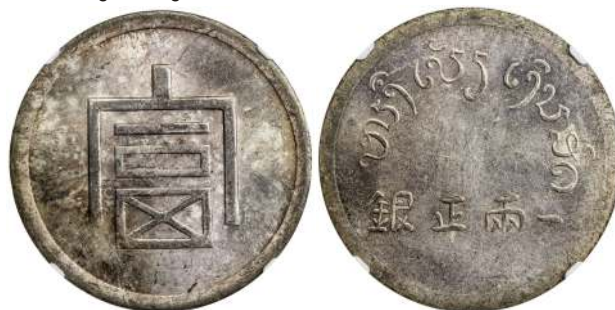
1915. YUNNAN: Republic , AR tael (liang), ND (1943-44), KM-A2a, L&M-433, struck for use in the French Indo-China opium trade, Chinese character fu ("wealth") at center // denomination in Laotian and Chinese, bold strike with frosty luster and light rainbow toning, NGC graded MS64 $2,200 - 2,400