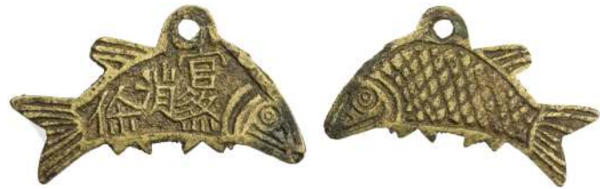
1835. QING: AE charm (10.93g), CCH-2401, 58mm x 36mm, fish-shaped type charm, guan sha xiao chu (dispel life's crises), VF $75 - 100

The peach symbolizes longevity and its wood is also believed to have a special power to keep away evil spirits. Although in the name of the Qing Emperor Dao Guang, this example is was likely cast in the Min Guo (Republic) era.