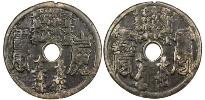
1780. QING: AE charm, Mandel-7.5.6, 63mm, Lei Ling "Daoist curse charm", small crack in flan, very scarce type, VG-F $100 - 150