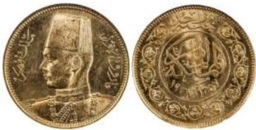
1641. EGYPT: Farouk , 1936-1952, AV 100 piastres, 1938/AH1357, KM-372, in an old NGC holder, NGC graded MS63 $500 - 600