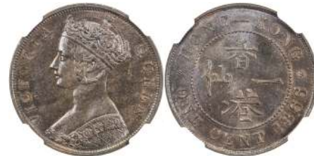
1925. HONG KONG: Victoria, 1842-1901, AR cent, 1866, KM-4.1, NGC graded MS65 BR $100 - 150