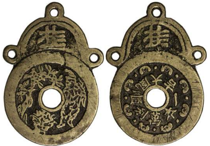
1803. QING: AE charm, CCH-813 cf, 46mm x 65mm, diety at right, flower pot below, tree at right with gua (to hang) above in canopy // yi ben wan li (small investment brings big [10,000 fold] profit), shun feng da ji (may you have a favorable wind and good luck) with eight yuan bao (sycee ingots) around, with gua (to hang) above in canopy, VF, RR $100 - 150

This example was likely cast in the late Qing Dynasty or early Min Guo (Republic) period.