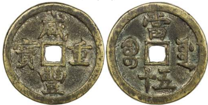
1741. QING: Xian Feng , 1851-1861, AE 50 cash, Board of Works mint, Peking, H-22.760, Cr-2-7.1, 43mm, New branch mint, large size planchet, cast April 1854 to July 1855, brass ( huáng tóng ) color, VF $75 - 100