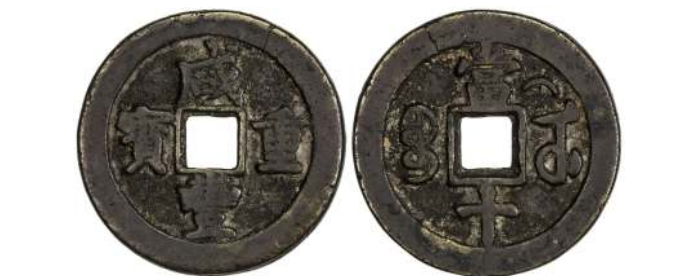
1755. QING: Xian Feng , 1851-1861, AE 10 cash, Wuchang mint, Hubei Province, H-22.858, Cr-13-6.1, with inverted crescent above mint name, cast 1854-56, brass ( huáng tóng ) color, small natural flan crack, Fine $75 - 100