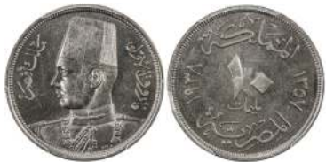
1632. EGYPT: Farouk , 1936-1952, 10 milliemmes, 1938/AH1357, KM-364, PCGS Specimen pop-4/2, total 8, PCGS graded Specimen 65, ex King's Norton Mint Collection $300 - 400