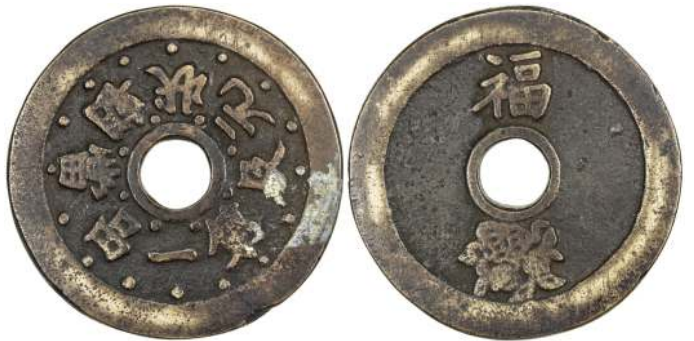
1804. QING: AE charm (33.79g), CCH-824, 44mm, yi pin dang chao zhuang yuan ji di ([May you be] an official of the first degree at the imperial court and first rank at the examination for the Hanlin Academy) // fu (good fortune) above, auspicious symbol below, VF $75 - 100