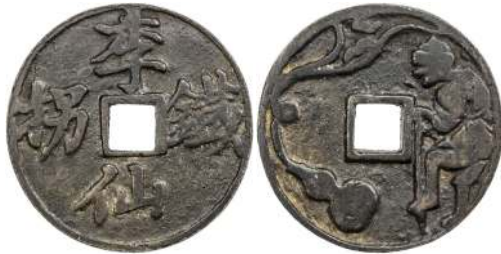
1822. QING: AE charm (11.56g), CCH-1733, li xian tie guai // Li Tieguai, one of the eight immortals, known as "Li with the iron crutch", shown as a crippled beggar who carries a gourd filled with a magic elixir, VF $75 - 100

This example is was cast in the early Min Guo (Republic) era as part of an eight-charm set.