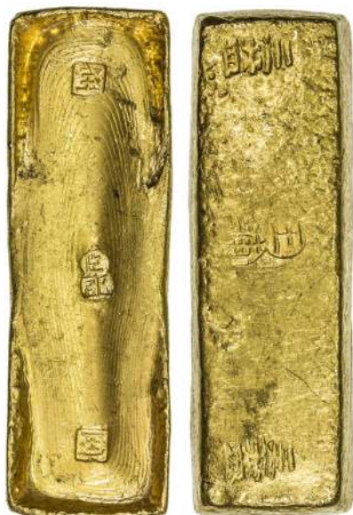
1775. QING: AV rectangular cast ingot (364.81g), 26mm x 79mm x 14mm, undated gold bar circa 1745, weight equal to approximately 10 taels ( liang ), cast in a boat shape with the top having stamped Chinese characters chen ji (assayer name) and bao (precious) twice, the underside has stamped characters san yi , at right and left and wang pu (king's treasure house) at center, EF, RRR $22,000 - 26,000