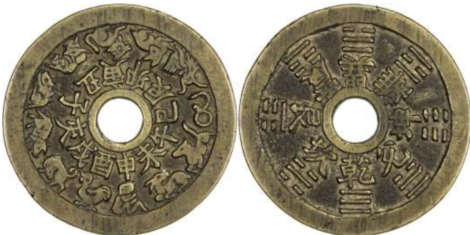
1823. QING: AE charm (22.77g), CCH-1774, 46mm, twelve animals of the Chinese Zodiac, zi chou yin mao chen si wu wei shen you xu hai around // eight trigrams qian kan gen zhen xun li kun dui around, VF-EF $75 - 100

This example is was cast in the early Min Guo (Republic) era as part of an eight-charm set.