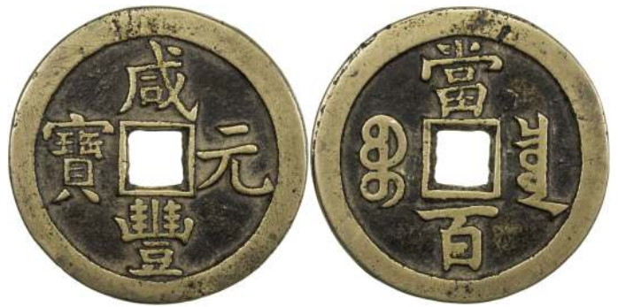
1736. QING: Xian Feng , 1851-1861, AE 100 cash, Board of Revenue mint, Peking, H-22.710, Cr-1-8, 51mm, Prince Qing Hui mint, 'sun & moon' above, cast May-August 1854, brass ( huáng tóng ) color, VF $75 - 100