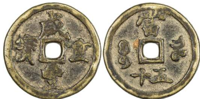
1753. QING: Xian Feng , 1851-1861, AE 50 cash (45.15g), Kaifeng mint, Henan Province, H-22.847, 45mm, brass ( huáng tóng ) color, cast 1854-55, Fine $75 - 100