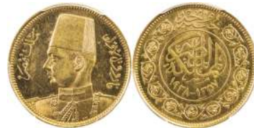
1640. EGYPT: Farouk , 1936-1952, AV 100 piastres, 1938/AH1357, KM-372, PCGS graded MS63 $500 - 600