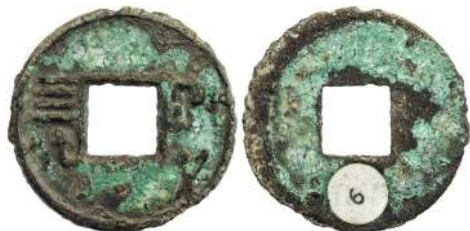
1702. WARRING STATES: State of Qi, 300-220 BC, AE cash (5.63g), H-6.24, yi si hua ([City of] Yi, four hua) in archaic characters, Fine, ex Jiùjinshan Collection $200 - 300