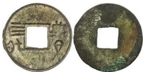
1701. WARRING STATES: State of Qi, 300-220 BC, AE cash (6.78g), H-6.24, yi si hua ([City of] Yi, four hua) in archaic characters, VF, ex Jiùjinshan Collection $350 - 450