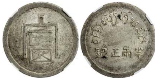
1914. YUNNAN: Republic , AR ½ tael (liang), ND (1943-44), KM-A1.2, L&M-434, struck for use in the French Indo-China opium trade, Chinese character fu ("wealth") at center // denomination in Laotian and Chinese, bold strike with frosty luster and rainbow toning, NGC graded AU55 $550 - 650