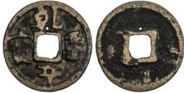
1725. SOUTHERN HAN: Qian Heng , 917-924, AE cash (3.11g), H-15.107, VG-F, RR $100 - 150

The legend translates as "the large coin of the five elements [metal, wood, water, fire, and earth]", issued in 574 by Emperor Wu. They were intended to be worth ten bu quan coins, but illegal coining soon produced specimens of a reduced weight and the authorities banned the use of this coin in 576. (See also lot 1723 above).