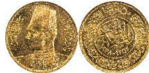
1638. EGYPT: Farouk , 1936-1952, AV 50 piastres, 1938/AH1357, KM-371, NGC graded MS65 $350 - 400