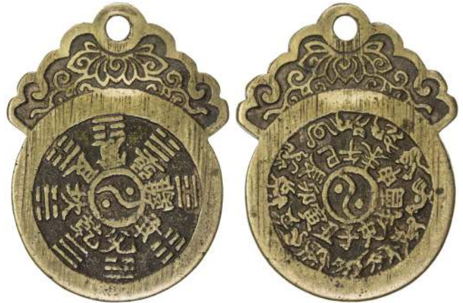
1839. QING: AE charm (21.85g), CCH-2544, 42mm x 56mm, irregular-shaped charm, eight trigrams with inscription qian kan gen zhen xun li kun dui around // twelve animals of the Chinese Zodiac, zi chou yin mao chen si wu wei shen you xu hai around, hanger with floral motif, VF $75 - 100

This example was likely cast in the late Qing Dynasty or Min Guo (Republic) era.