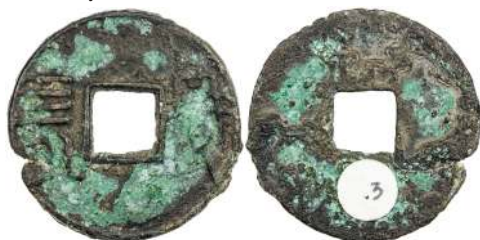
1703. WARRING STATES: State of Qi, 300-220 BC, AE cash (6.83g), H-6.24, yi si hua ([City of] Yi, four hua) in archaic characters, Very Good, ex Jiùjinshan Collection $75 - 100