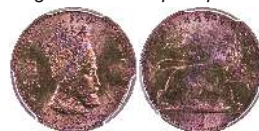
1651. ETHIOPIA: Haile Selassie , 1930-1974, AE matona (cent), EE1923 (1931), KM-27, only 23 examples known, PCGS graded Specimen-67RB, ex King's Norton Mint Collection $250 - 350