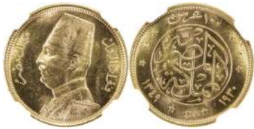
1628. EGYPT: Fuad , 1922-1936, AV 100 piastres, 1930/AH1349, KM-354, NGC graded MS63 $500 - 600