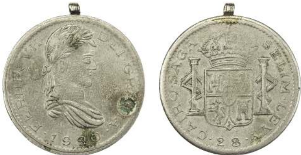
1644. EGYPT: advertising token , 1920, 41mm, Selim Levy, Cairo Saga 28 likely struck in silvered brass, with loop attached, imitating Spanish Colonial 8 reales of Ferdinand VII, VF, R $75 - 100