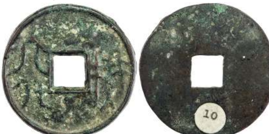
1708. WARRING STATES: State of Qi, 300-220 BC, AE cash (8.68g), H-6.25, yi liu hua ([City of] Yi, [value] six hua) in archaic script, F-VF, ex Jiùjinshan Collection $150 - 250