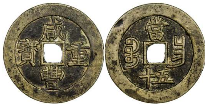
1760. QING: Xian Feng , 1851-1861, AE 50 cash, Nanchang mint, Jiangxi Province, H-22.931, Cr-15-6.1, 52mm, cast 1855-60, brass ( huáng tóng ) color, VF $75 - 100