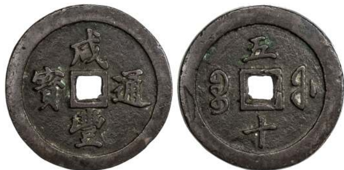
1745. QING: Xian Feng , 1851-1861, AE 50 cash, Fuzhou, Fujian Province, H-22.782, Cr-10-14, 57mm, one dot tong, cast 1853-55, copper ( tóng ) color, VF $300 - 500