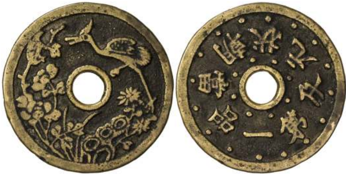
1801. QING: AE charm, CCH-812, 46mm, stork, small bird, flowers // yi pin dang chao ([may you be] an official of the first degree at the imperial court) - zhuang yuan ji di ([may you be] the first rank at the examination for the Hanlin Academy), VF $100 - 150