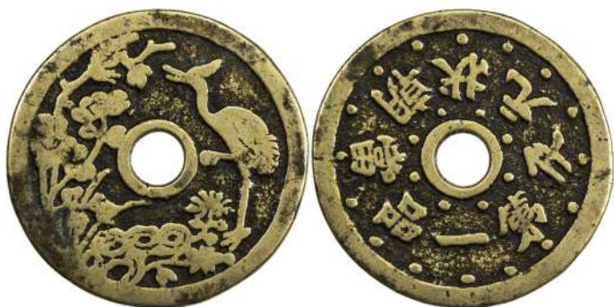
1806. QING: AE charm (24.17g), CCH-835, 45mm, stork, small bird, flowers // yi pin dang chao ([may you be] an official of the first degree at the imperial court) - zhuang yuan ji di ([may you be] the first rank at the examination for the Hanlin Academy), Fine $75 - 100

This example was likely cast in the Qing Dynasty.