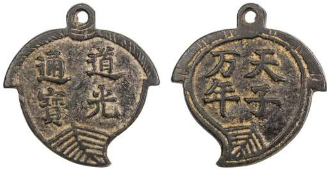
1834. QING: AE charm (29.31g), CCH-2395, 47mm, Peach irregular-shaped type charm, dao guang tong bao // tian zi wan nian (may the Emperor [Son of Heaven] live for a myriad [10,000] of years), VF-EF $75 - 100

The peach symbolizes longevity and its wood is also believed to have a special power to keep away evil spirits. Although in the name of the Qing Emperor Dao Guang, this example is was likely cast in the Min Guo (Republic) era.