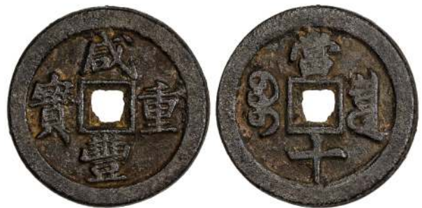
1739. QING: Xian Feng , 1851-1861, iron 10 cash, Board of Revenue mint, Peking, H-22.735, Cr-1-6a, cast in the Dai script of the famous calligrapher Dai Chunshi in 1854-55, VF $75 - 100