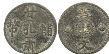
1895. KANSU: Republic , AE 5 cash (4.54g), ND, Y—, struck in or shortly after 1928, the year in which the actual pattern was produced, VF, RR $125 - 175