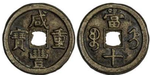
1767. QING: Xian Feng , 1851-1861, AE 10 cash, Baoding mint, Zhihli Province, H-22.1051, Cr-5-5, cast 1854-55, brass (huáng tóng) color, F-VF $75 - 100