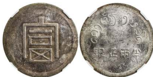
1913. YUNNAN: Republic , AR ½ tael (liang), ND (1943-44), KM-A1.2, L&M-434, struck for use in the French Indo-China opium trade, Chinese character fu ("wealth") at center //denomination in Laotian and Chinese, bold strike with frosty luster and rainbow toning, NGC graded MS61 $700 - 900