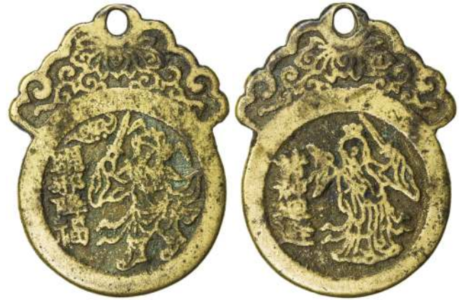
1844. QING: AE charm (28.03g), CCH-2553, 41mm x 55mm, irregular-shaped type charm, Zhong Kui with sword, qu xie jiang fu (expel evil and send down good fortune) // Lu Dongbin with sword, zhu shen hui bi (evade all the spirits), F-VF $75 - 100

This example was likely cast in the late Qing Dynasty.