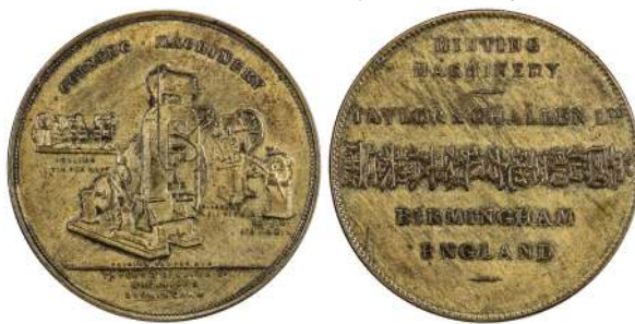
1873. CHINA: AE advertising medal, ND (ca. 1900), CCC-782, 38mm, various minting machinery, COINING MACHINERY above, ROLLING 1 TON PER DAY at left, BLANKING 200 PER MIN, MARKING 600 PER MIN at right, COINING 100 PER MIN below, TAYLOR & CHALLEN LD ENGINEERS BIRMINGHAM in three lines in exergue // MINTING MACHINERY / TAYLOR & CHALLEN LTD / Chinese legend sideways / BIRMINGHAM / ENGLAND, PCGS graded AU58 $400 - 500