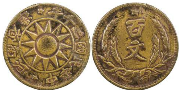
1889. HONAN: Republic , AE 100 cash, year 20 (1931), Y-398, CCC-557, laquered, VF, ex London Coin Auctions 15 July 2001 Lot 445 $75 - 100