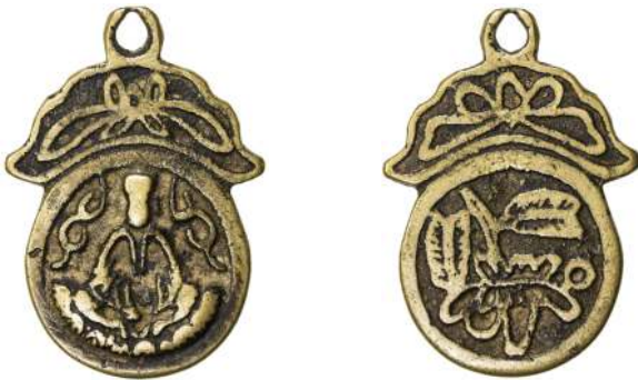
1836. QING: AE charm (32.99g), CCH-2507, 42mm x 60mm, Guanyin (Kwan Yin, Kuan Yin) pendant charm, Kuan-yin seated // plantain or banana leaves shown above and to the left of the lotus , VF $75 - 100