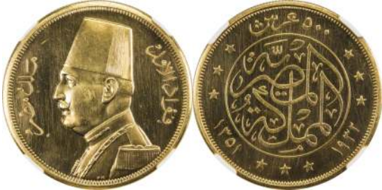
1629. EGYPT: Fuad , 1922-1936, AV 500 piastres, 1932/AH1351, KM-355, NGC graded Proof 62 $4,500 - 5,500