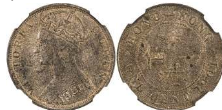
1926. HONG KONG: Victoria, 1842-1901, AE cent, 1901, KM-4.3, NGC graded MS62 BR $75 - 100