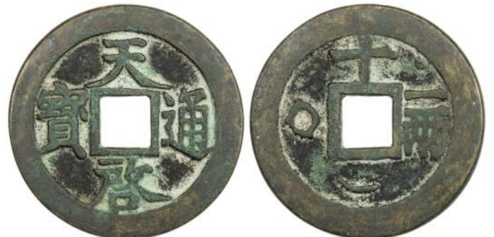
1731. MING: Tian Qi , 1621-1627, AE 10 cash (28.41g), H-20.230, 45mm, shi (10 [cash]) above, yi liang (one ounce) at right, circle at left, crescent below on reverse, VF $200 - 300