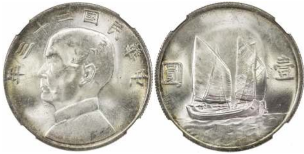
1868. CHINA: Republic , AR dollar, year 23 (1934), Y-345, L&M-110, Sun Yat Sen // Chinese junk, NGC graded MS64 $300 - 400