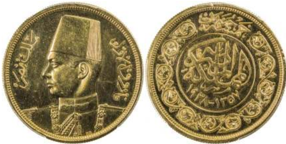
1643. EGYPT: Farouk , 1936-1952, AV 500 piastres, 1938/AH1357, KM-373, rim ding (tiny ding, at the top of the reverse), PCGS graded UNC details $2,400 - 3,800