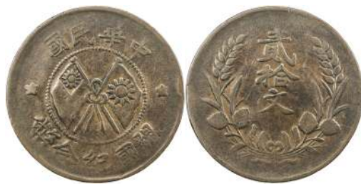
1870. CHINA: Republic , AE 20 cash, ND (1927-28), Hsu-9, CCC-750, Nationalist Commemorative, VF, ex London Coin Auctions 15 July 2001 Lot 448 $75 - 100