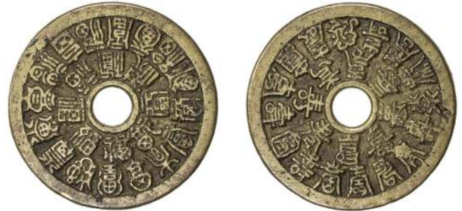
1818. QING: AE charm (30.53g), CCH-1478, 47mm, Fu Shou "good fortune" charm with character fu written 24 times on one side // the "longevity" character shou written 24 times, each character is written in a slightly different way or style, VF-EF $100 - 150

This example was likely cast in the Qing Dynasty. Photo size reduced.