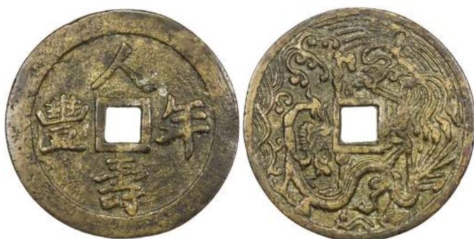
1812. QING: AE charm, CCH-949, 55mm, ren shou nian feng (may the people enjoy a long life and may the harvests be bountiful) // dragon and phoenix design, VF $100 - 150