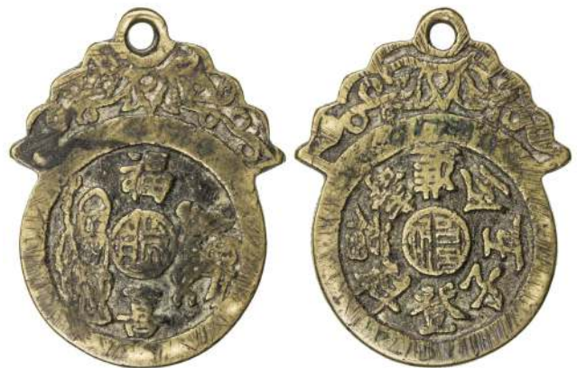
1840. QING: AE charm (29.21g), CCH-2547, 41mm x 54mm, fu lu shou xi (good fortune, emolument [official salary], longevity and happiness), deer and old man // wu zi deng ke fu shou shuang quan , VF $75 - 100