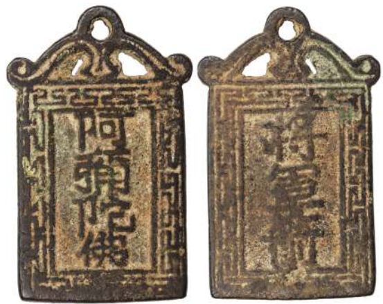
1838. QING: AE charm (23.03g), CCH-2535, 35mm x 57mm, Buddhist irregular-shaped type charm, e mi tuo fo (may Buddha protect) // jiang jun jian , F-VF $75 - 100

This example was likely cast in the late Qing Dynasty or Min Guo (Republic) era.