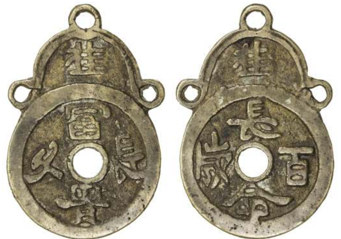
1846. QING: AE charm, CCH-2577, 47mm x 71mm, chang ming bai sui (long life of 100 years), with gua (to hang) above in canopy // fu gui chang jiu (wealth and honor for a long time), with gua (to hang) above in canopy, VF $100 - 150

This old Taoist (Daoist) charm has a single loop at the top and displays two of the "Eight Immortals." On the obverse is the Taoist Immortal Zhong Kui with a sword in his right hand. He is famous as a fearsome slayer of evil demons. On the reverse Lu Dongbin has in his left hand a magic devil-slaying sword which can slay any ghost or demon. In his right hand is a whisk (fly whisk) which allows him to walk on clouds or fly to heaven whenever he wishes.