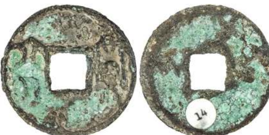
1710. WARRING STATES: State of Qi, 300-220 BC, AE cash (6.51g), H-6.25, yi liu hua ([City of] Yi, [value] six hua) in archaic script, VG-F, ex Jiùjinshan Collection $75 - 100