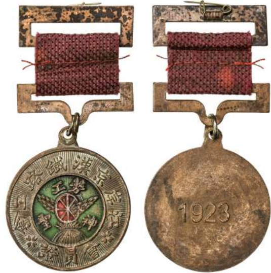
1923. CHINA (PEOPLE'S REPUBLIC): AE medal, 1923 (1953), official restrrike of the original Jiang'an-Beijing-Wuhan Railway Union medal, EF $75 - 100