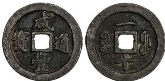
1743. QING: Xian Feng , 1851-1861, AE 10 cash, Fuzhou, Fujian Province, H-22.780, Cr-10-6, one dot tong, cast 1853-55, copper ( tóng ) color, VF $75 - 100