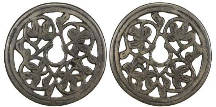
1781. QING: AE charm, Mandel-8.2.6, 58mm, openwork charm, four flower design, F-VF, ex Daniel K. Ching Collection $75 - 100