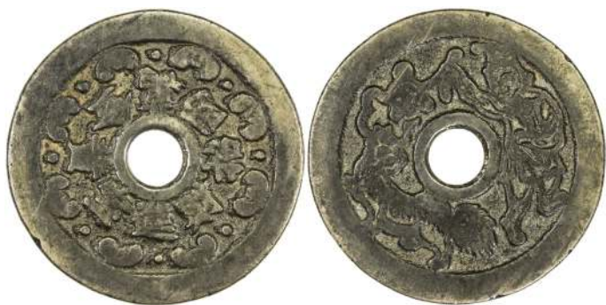
1783. QING: AE charm (21.99g), Mandel-17.8.3, 45mm, huáng jin wàn liang zhao cái jin bao (two million gold fortune treasures), with eight yuanbao (sycee) around // uncertain theme, perhaps boy playing with dragon, VF $75 - 100