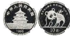
1922. CHINA (PEOPLE'S REPUBLIC): 10 yuan, 1990, KM-277, 1/10 troy ounce pure platinum, Temple of Heaven // panda with branch, NGC graded PF69 UC $125 - 175