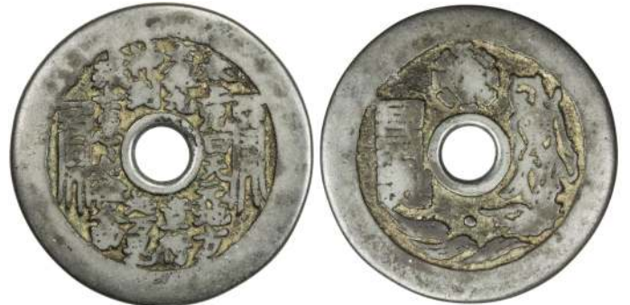
1826. QING: AE charm (27.22g), CCH-1792, 45mm, Xuan Wu "Daoist curse charm", lei zou sha gui jiang jing / zhan yao chu xie yong bao / shen qing feng / tai shang lao jun ji ji zhi ling "God of Thunder (Lei) clear out and kill the ghosts and send down purity. Behead the demons, expel the evil and keep us eternally safe. Let this command from Lao Zi be executed quickly." // Daoist "magic writing" at left, at right is the Daoist god Zhenwu, also known as the Perfected Warrior, Fine $75 - 100

During the Han Dynasty Zhenwu was known as Xuanwu and was depicted as a tortoise encircled by a snake. This symbol represented the north direction. Over the centuries this symbol gradually evolved and by the Song Dynasty had developed into the very popular warrior god Zhenwu associated with healing and protection.