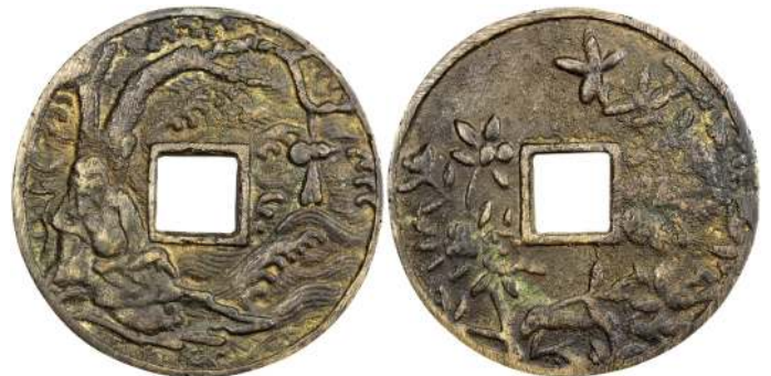
1797. QING: AE charm (41.19g), CCH-559, 55mm, one of the Eight Immortals ( ba xian ) reclining under tree // flowering tree, VF $75 - 100

The Classic Chinese Charm book states this type was cast in the Yuan or Ming Dynasty, but we believe this example is was cast in the early Min Guo (Republic) era.