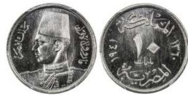
1634. EGYPT: Farouk , 1936-1952, 10 milliemmes, 1941/AH1360, KM-364, PCGS Specimen pop-13/3, total 28, PCGS graded Specimen 65, ex King's Norton Mint Collection $300 - 400