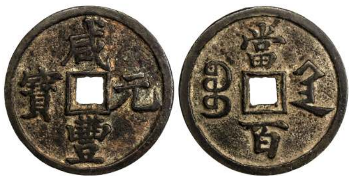
1764. QING: Xian Feng , 1851-1861, AE 100 cash, Xi'an mint, Shaanxi Province, H-22.959, Cr-23-8.1, 59mm, cast 1854-55, brass (huáng tóng) color, F-VF $100 - 150