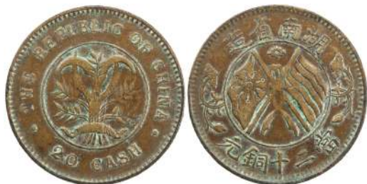
1890. HUNAN: Republic , AE 20 cash, ND (1919), Y-400a, crossed Wuchang Uprising and five-colored flags, with denomination as 20 CASH, VF, R $75 - 100