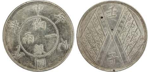
1905. SINKIANG: Republic , AR sar (tael), year 1 (1912), Y-42a, L&M-833, four stripes of arabesques on flags, cleaned, PCGS graded AU details $700 - 800