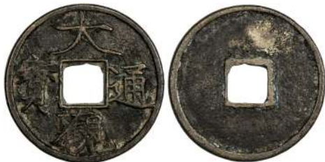
1727. NORTHERN SONG: Da Guan , 1107-1110, AE 2 cash (7.14g), H-16.421, VF, R, ex Jiujinshan Collection $100 - 150

The value 2, 3, and 5 cash are all scarce denominations in bronze for this reign title. (See also lot 1728).