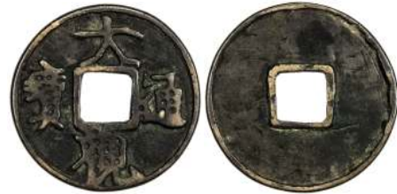
1729. YUAN: Mongol Khans , ca. 1230-1280, AE 2 cash (4.15g), H-19.7, derived from the Northern Song da guan tong bao , but the style of the calligraphy is more correct for this period, as is the casting style and weight, minor tooling in reverse field, F-VF, R, ex Jiujinshan Collection $200 - 300