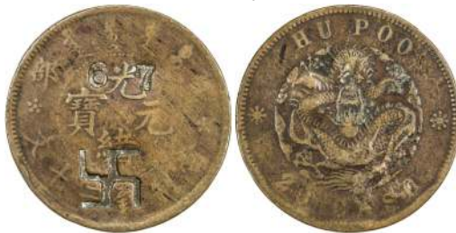
1871. CHINA: AE token, countermarked swastika and number 67 on Imperial 20 cash Board of Revenue, perhaps for use as a check or token in a Buddhist temple or monastery, VF $75 - 100