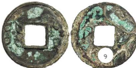
1707. WARRING STATES: State of Qi, 300-220 BC, AE cash (8.98g), H-6.25, yi liu hua ([City of] Yi, [value] six hua) in archaic script, VF, ex Jiùjinshan Collection $200 - 300