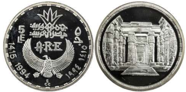
1646. EGYPT: AR 5 pounds , 1994/AH1415, KM—, Khosru temple, unlisted by KM, Proof, R $100 - 120