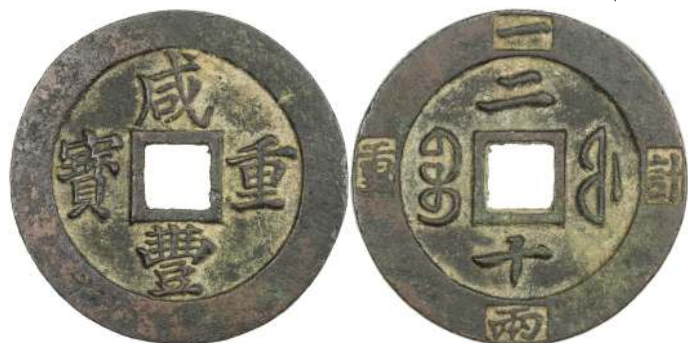
1749. QING: Xian Feng , 1851-1861, AE 20 cash, Fuzhou, Fujian Province, H-22.794, Cr-10-12, 47mm, yi liang ji zhong incuse on rim, cast 1853-55, copper ( tóng ) color, a lovely example! EF $200 - 300