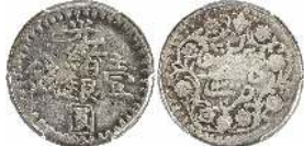
1903. SINKIANG: Kuang Hsu , 1875-1908, AR miscal (mace), Kashgar, AH1310, Y-16, L&M unlisted, type of 682 and 690, guang xu yin yuan yi qian in Chinese // zarb kashgar bir miscal in Uyghur, tooled, PCGS graded VF details $125 - 175