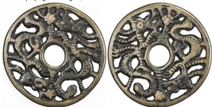
1784. QING: AE charm (34.85g), CCH-16, 58mm, Open Work type charm, double dragon design, VF $75 - 100 This example was likely cast in the Ming dynasty.