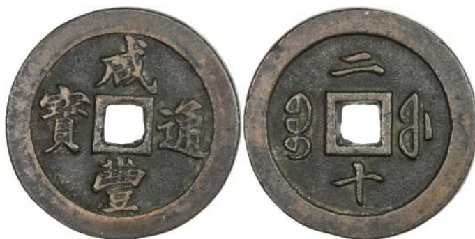
1744. QING: Xian Feng , 1851-1861, AE 20 cash, Fuzhou, Fujian Province, H-22.781, Cr-10-10, 47mm, one dot tong, cast 1853-55, copper ( tóng ) color, VF-EF $75 - 100