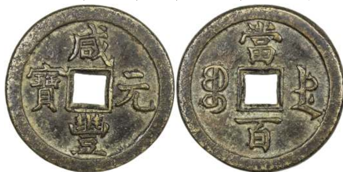
1771. QING: Xian Feng , 1851-1861, AE 100 cash, Chengde mint, Zhihli Province, H-22.1063, Cr-6-5, 48mm, cast 1854-55, brass (huáng tóng) color, VF, S $150 - 250