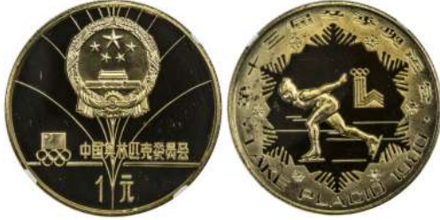
1918. CHINA (PEOPLE'S REPUBLIC): piefort brass yuan, 1980, KM-P8, Lake Placid Winter Olympic Games - Speed Skating, mintage 1,000, NGC graded PF66 Cameo, R $300 - 400