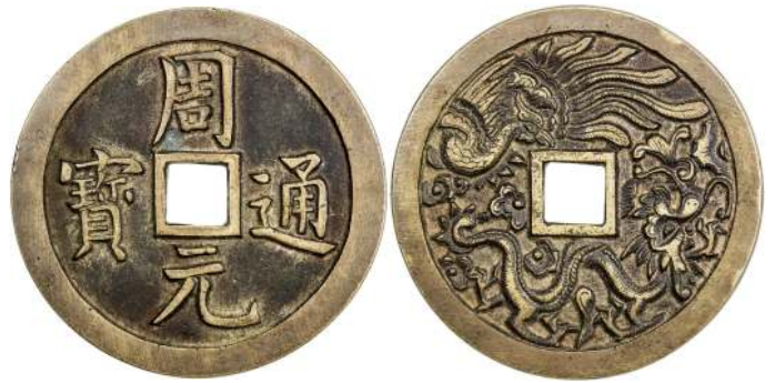
1795. QING: AE charm , CCH-441, 63mm, zhou yuan tong bao // dragon & phoenix type $150 - 250

This example was likely cast in the late Qing Dynasty or early Min Guo (Republic) period.