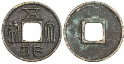
1723. NORTHERN ZHOU: Anonymous , 557-581, AE cash (4.13g), H-13.30, wu xing da bu , EF, ex Jiujinshan Collection $75 - 100