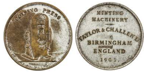
1874. CHINA: AE advertising medal, 1903, 32mm, COINING PRESS with image of same below // MINTING MACHINERY, TAYLOR & CHALLEN LD BIRMINGHAM ENGLAND 1903, nickel plated as made, much still visible, PCGS graded AU58 $200 - 300