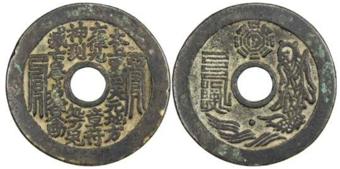
1817. QING: AE charm, CCH-1394 Vol II, 44mm, Lei Ling "Daoist curse charm", tai shang zhou yue tian yuan di fang / liu lu jiu zhang / fu shen dao chu wan gui / mie wang ji ru lu ling which translates as "Lao Zi (Lao-Tzu) curses saying the Heaven is round and the earth is square / The Nine Songs of the Six Temperaments / The spirit of the magic writing will destroy the ten thousand ghosts everywhere / Let it be executed as fast as Lu Ling" // Daoist "magic writing" with unclear meaning at left, on right is the Daoist god Zhenwu, VF-EF $75 - 100

This example is based on an earlier Yuan Dynasty charm, but was likely cast in the Min Guo (Republic) era.