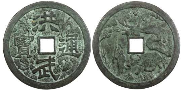
1796. QING: AE charm , CCH-486, 101mm, large size charm, hong wu tong bao surrounded by two fierce dragons // youthful Emperor Tai Zu leading an ox or water buffalo, lovely patina, F-VF, RRR $200 - 300

This example is was likely cast in the Min Guo (Republic) era.