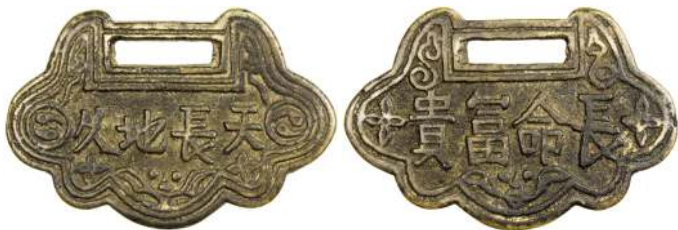
1837. QING: AE charm (22.12g), CCH-2520, 57mm x 38mm, irregular-shaped type charm, chang ming fu gui (longevity, wealth and honor) // tian chang di jiu (as eternal and unchanging as the universe), VF $75 - 100

This example is was cast in the Qing Dynasty.