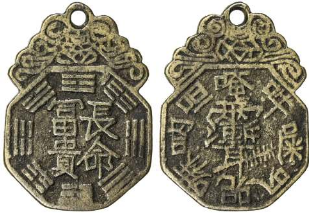
1842. QING: AE charm (27.29g), CCH-2549, 40mm x 55mm, Pendant hexagonal-shaped charm, chang ming fu gui (longevity, wealth and honor) // eight characters around central legend, Fine $50 - 75

This example was likely cast in the late Qing Dynasty.