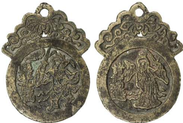
1843. QING: AE charm (19.33g), CCH-2553, 41mm x 57mm, Zhong Kui with sword, qu xie jiang fu (expel evil and send down good fortune) // Lu Dongbin with sword, zhu shen hui bi (evade all the spirits), couple minor casting holes, VF $75 - 100

This example was likely cast in the Qing Dynasty. Photo size reduced.