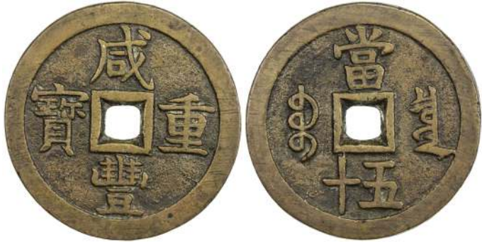
1734. QING: Xian Feng , 1851-1861, AE 50 cash, Board of Revenue mint, Peking, H-22.704, Cr-1-7, 55mm, North branch mint, cast June 1853 to February 1854, brass ( huáng tóng ) color, EF $75 - 100

Likely a contemporary or later Qing Dynasty issue as the fabric and metal are consistent with these periods.