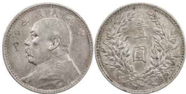
1865. CHINA: Republic , AR dollar, year 3 (1914), Y-329, L&M-63, Yuan Shih Kai, with 'P' counterstamp applied for unknown reasons, EF $100 - 150