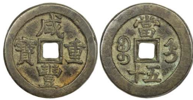
1768. QING: Xian Feng , 1851-1861, AE 50 cash, Baoding mint, Zhihli Province, H-22.1052, Cr-5-6, 43mm, cast 1854-55, brass (huáng tóng) color, VF, S $150 - 250