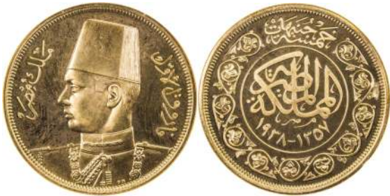
1642. EGYPT: Farouk , 1936-1952, AV 500 piastres, 1938/AH1357, KM-373, NGC graded Proof 64 $4,000 - 5,000