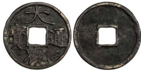
1728. NORTHERN SONG: Da Guan , 1107-1110, AE 2 cash (6.36g), H-16.421, VF, R, ex Jiujinshan Collection $100 - 150

The value 2, 3, and 5 cash are all scarce denominations in bronze for this reign title. (See also lot 1728).