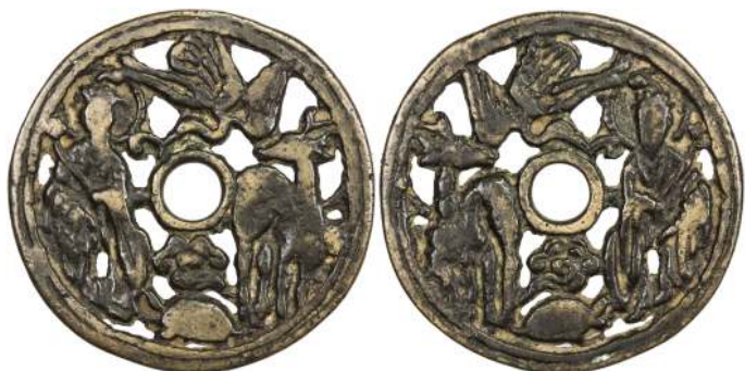
1786. QING: AE charm (29.88g), CCH-61, 51mm, openwork charm featuring xi wang mu (Queen Mother of the West), crane, deer, and turtle with "auspicious cloud", VF, ex Daniel K. Ching Collection $75 - 100 Photo size reduced.