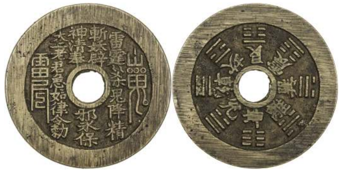
1824. QING: AE charm (21.49g), CCH-1776, 45mm, Lei Ling "Daoist curse charm", lei zou sha gui jiang jing / zhan yao chu xie yong bao / shen qing feng / tai shang lao jun ji ji zhi ling which translates as "God of Thunder (Lei) clear out and kill the ghosts and send down purity / Behead the demons / Expel the evil and keep us eternally safe / Let this command from Lao Zi be executed quickly" // eight trigrams with inscription qian kan gen zhen xun li kun dui around, engraved into eight-sided floral shape, a choice example! EF $100 - 150