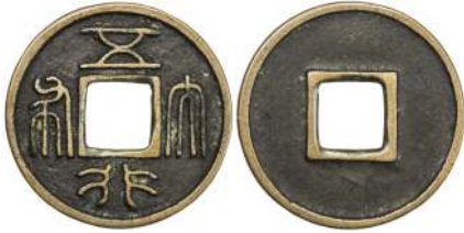
1724. NORTHERN ZHOU: Anonymous , 557-581, AE cash (4.17g), H-13.30, wu xing da bu , EF, ex Jiujinshan Collection $75 - 100

The legend translates as "the large coin of the five elements [metal, wood, water, fire, and earth]", issued in 574 by Emperor Wu. They were intended to be worth ten bu quan coins, but illegal coining soon produced specimens of a reduced weight and the authorities banned the use of this coin in 576. (See also lot 1723 above).