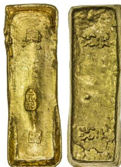
1776. QING: AV rectangular cast ingot (366.90g), 26mm x 79mm x 14mm, undated gold bar circa 1745, weight equal to approximately 10 taels ( liang ), cast in a boat shape with the top having stamped Chinese characters yuan ji (assayer name) and bao (precious) twice, the underside has stamped characters ding yuan , at right and left, EF, RRR $22,000 - 26,000