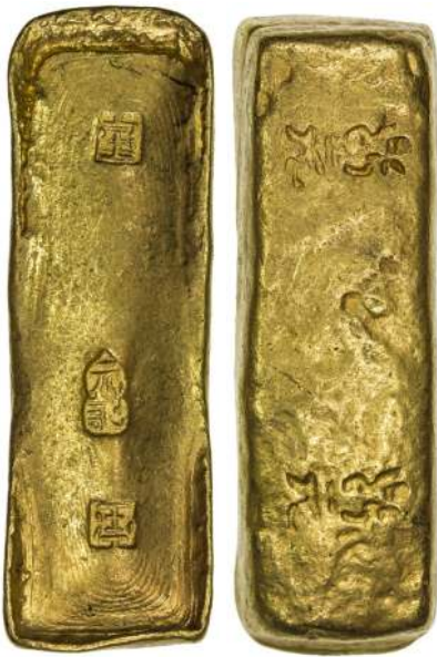
1778. QING: AV rectangular cast ingot (364.71g), 26mm x 79mm x 14mm, undated gold bar circa 1745, weight equal to approximately 10 taels ( liang ), cast in a boat shape with the top having stamped Chinese characters yan ji (assayer name) and bao (precious) twice, the underside has stamped characters ding yuan , at right and left, EF, RRR $22,000 - 26,000

As with lots 1775, 1776 and 1777, this is nearly identical to the bars from the wrecks of the French East India Company vessel de Conty , and to the Dutch East-Indiaman Geldermalsen .