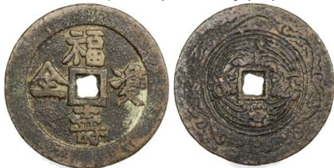
1807. QING: AE charm (36.58g), CCH-850, Vol. 2, 48mm, fu shou shuang quan (happiness and longevity both complete) // two phoenixes, F-VF $75 - 100

This example was likely cast in the Qing Dynasty in Kweichow (Guizhou) Province.