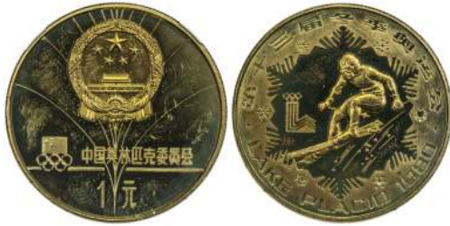
1917. CHINA (PEOPLE'S REPUBLIC): piefort brass yuan, 1980, KM-P7, Lake Placid Winter Olympic Games - Alpine Skiing, mintage 1,000, NGC graded PF64 Cameo, R $300 - 400