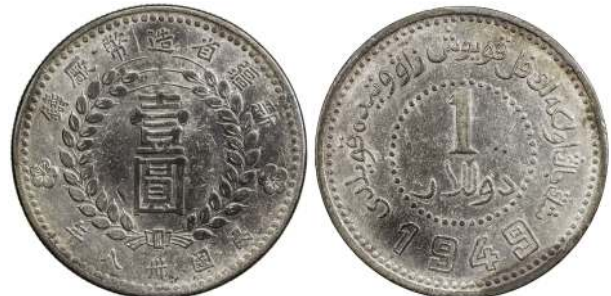
1908. SINKIANG: Republic , AR dollar, year 38 (1949), Y-46.2, L&M-842, pointed base 1 variety, small Chinese characters, cleaned, PCGS graded Genuine EF details $100 - 150