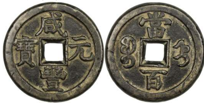
1769. QING: Xian Feng , 1851-1861, AE 100 cash, Baoding mint, Zhihli Province, H-22.1053, Cr-5-7, 48mm, cast 1854-55, brass (huáng tóng) color, VF $100 - 150