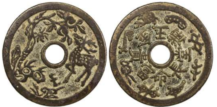
1805. QING: AE charm (25.04g), CCH-835, 46mm, stork and deer facing each other, both representing long life // two bats facing each other, four other symbols, jin yu man tang chang ming fu gui (enjoy long life and prosperity), VF $75 - 100