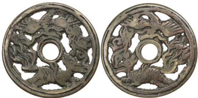
1785. QING: AE charm, CCH-34, 54mm, openwork charm, phoenix design, F-VF $75 - 100 Photo size reduced.