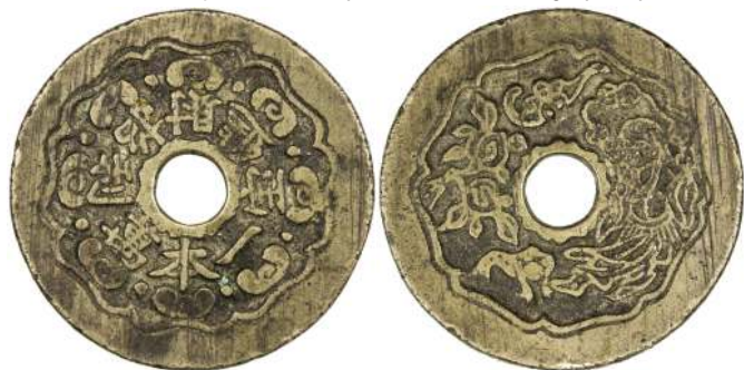
1829. QING: AE charm, CCH-1812, Mandel-17.8.4, 43mm, yi ben wan li zhao cai jin bao (a million lucky treasure), with eight yuanbao (sycee) around // Liu Hai on the right waving a string of coins above his head, the Three-Legged Toad at bottom and lucky symbols include a pair of peaches to the left of the hole, auspicious bat above, F-VF $75 - 100

This example is was likely cast in the late Qing Dynasty.