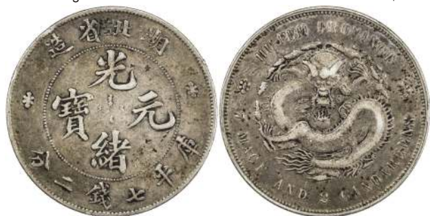
1892. HUPEH: Kuang Hsu , 1875-1908, AR dollar, ND (1895-1907), Y-127.1, L&M-182, several Chopmarks, VF $150 - 250