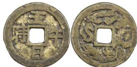
1798. QING: AE charm (7.22g), CCH-660, "Five Poisonous Creatures" charm, wu ri wu shi (Noon of the Fifth Day) // the "five poisons" (snake, scorpion, centipede, toad and spider), Fine $75 - 100