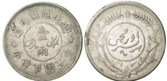
1907. SINKIANG: Republic , AR sar (tael), Urumqi (Tihwa), year 6 (1917), Y-45, L&M-837, five-point rosette atop the wreath, VF-EF $100 - 150