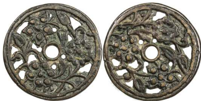
1787. QING: AE charm (21.48g), CCH-67, Vol. 2, 45mm, Open Work type charm, three flowers, VF $75 - 100 This example is was likely cast in the Song or Jin Dynasty.