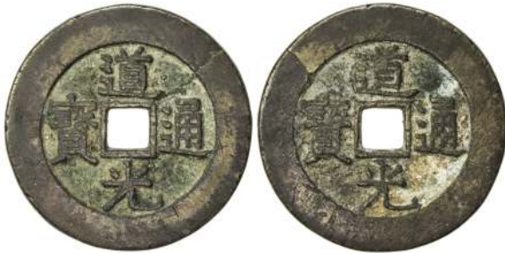
1733. QING: Dao Guang , 1821-1850, AE charm (16.75g), H-22.599var, double obverse type, style of the Fujian mint, flan crack, VF, S $100 - 150

Likely a contemporary or later Qing Dynasty issue as the fabric and metal are consistent with these periods.