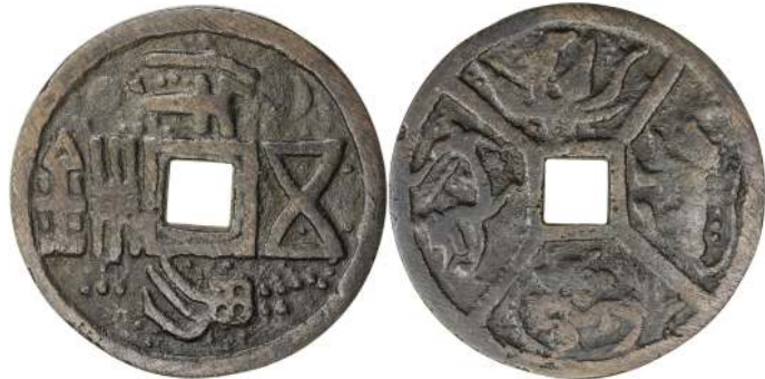
1793. QING: AE charm (42.27g), CCH-425, Vol. 2, 53mm, wu zhu type // four animals in quadrants, VF $75 - 100

In this case, the "boy" on the charm is actually Ming Emperor Tai Zu, who ruled as Hong Wu, who had a very humble early life and for a time was a shepherd boy.