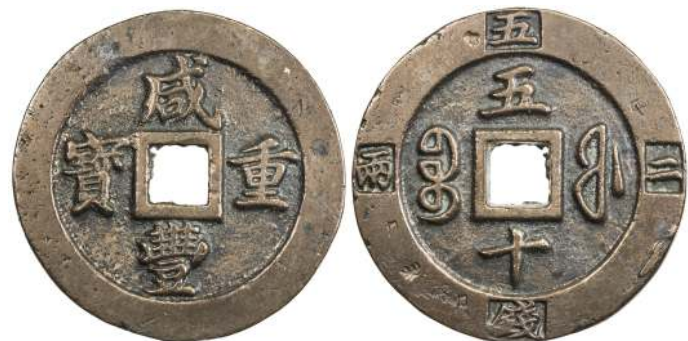
1750. QING: Xian Feng , 1851-1861, AE 50 cash, Fuzhou mint, Fujian Province, H-22.795, 58mm, er liang wu qian (two tael, five mace) incuse around rim, cast 1853-55, copper ( tóng ) color, lightly cleaned, several small chopmarks on rims, still a lovely example, VF-EF $1,000 - 1,400