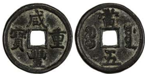
1740. QING: Xian Feng , 1851-1861, AE 5 cash, Board of Works mint, Peking, H-22.750, Cr-2-5, New branch mint, large size planchet, cast 1854-57, brass ( huáng tóng ) color, VF $75 - 100