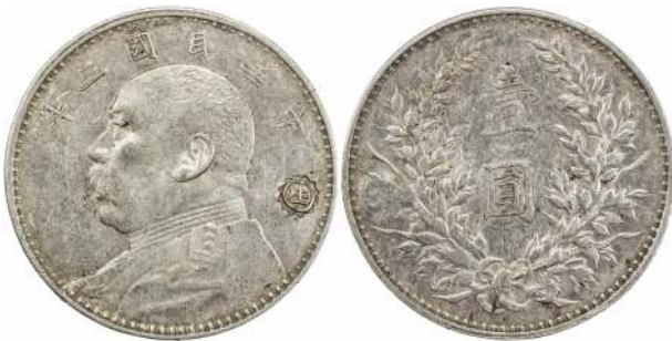
1866. CHINA: Republic , AR dollar, year 3 (1914), Y-329, Yuan Shih Kai, interesting uncertain counterstamp on obverse, EF $100 - 150