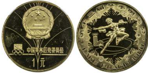
1919. CHINA (PEOPLE'S REPUBLIC): piefort brass yuan, 1980, KM-P9, Lake Placid Winter Olympic Games - Figure Skating, mintage 1,000, NGC graded PF64 Ultra Cameo, R $300 - 400