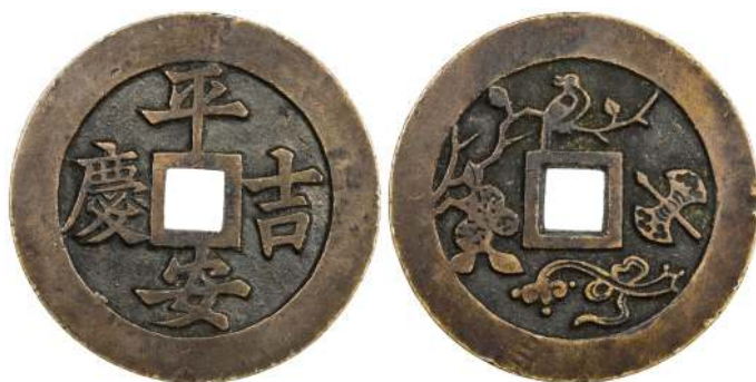
1809. QING: AE charm (15.71g), CCH-904, 50mm, ping an ji qing (peace and happiness) // various auspicious symbols, EF, R $150 - 250

This example was likely cast in the Qing Dynasty.