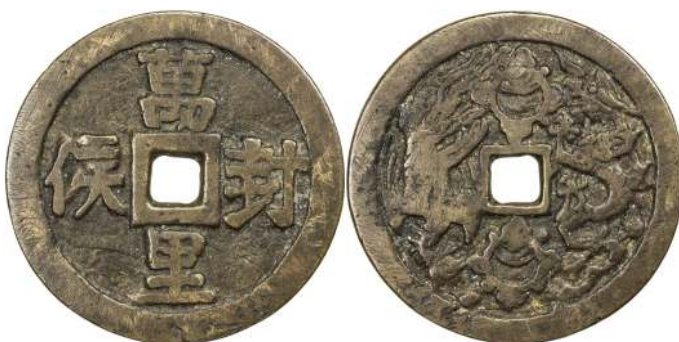
1811. QING: AE charm, CCH-935, 55mm, wan li feng hou // dragon and phoenix design, minor edge casting flaw, Fine $75 - 100