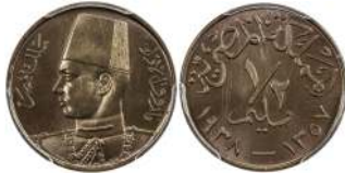
1630. EGYPT: Farouk , 1936-1952, ½ millieme, 1938/AH1357, KM-357, PCGS Specimen pop-0/0, total 25 (plus 1 red), finest known specimen, PCGS graded Specimen 67 RB, ex King's Norton Mint Collection $300 - 400