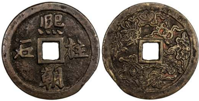
1813. QING: AE charm, CCH-1019, 60mm, xi chao zhu shi // auspicious clouds, cast in Guizhou Province, VF, S $150 - 250