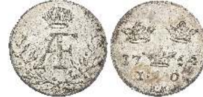
1416. SWEDEN: Adolf Friedrich , 1751-1771, AR öre (1.11g), 1754, KM-472, mint official HM, AU $300 - 350