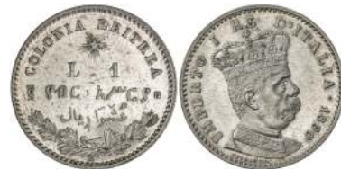
1649. ERITREA: Umberto I , 1889-1900, AR lira, 1890-R, KM-2, AU $100 - 150