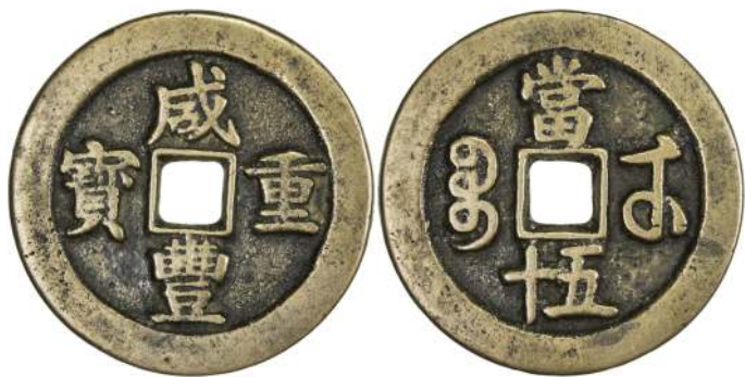
1756. QING: Xian Feng , 1851-1861, AE 50 cash, Wuchang mint, Hubei Province, H-22.859, Cr-13-7, 49mm, cast 1854-56, brass ( huáng tóng ) color, VF $75 - 100