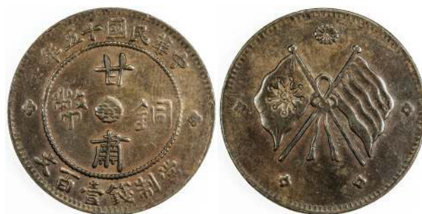
1894. KANSU: Republic , AE 100 cash, year 15 (1926), Y-409, CL-MG.130, crossed Wuchang Uprising and Five-colored flags, PCGS graded AU50 $100 - 150