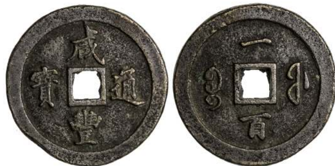
1747. QING: Xian Feng , 1851-1861, AE 100 cash, Suzhou mint, Jiangsu Province, H-22.784, Cr-16-18, 67mm, cast 1853-55, brass ( huáng tóng ) color, small casting flaw on edge, VF $300 - 500