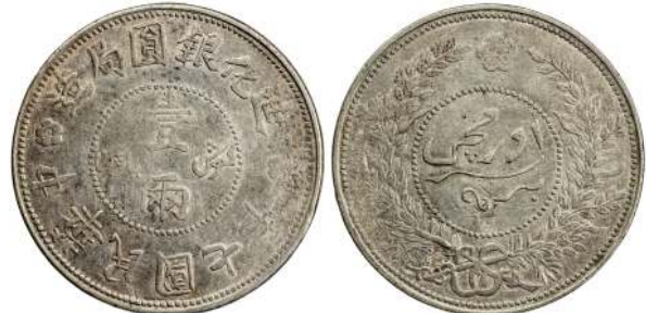
1906. SINKIANG: Republic , AR sar (tael), year 7 (1918), Y-45.2, L&M-839, PCGS graded EF45 $150 - 250