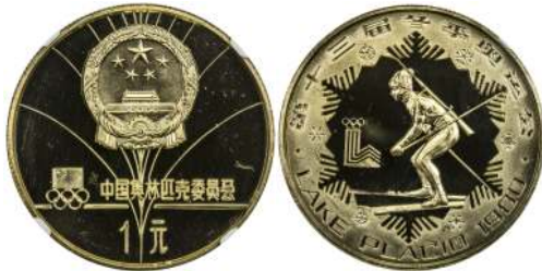
1920. CHINA (PEOPLE'S REPUBLIC): piefort brass yuan, 1980, KM-P10, Lake Placid Winter Olympic Games - Biathlon, mintage 1,000, NGC graded PF66 Cameo, R $300 - 400