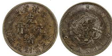
1897. KIRIN: Kuang Hsu , 1875-1908, AE 10 cash, ND (1903), Y-177.3, obverse small stars variety, PCGS graded MS62 BR $100 - 150