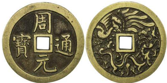
1794. QING: AE charm , CCH-441, 63mm, zhou yuan tong bao , hand carved branches around // dragon and guardian design, EF $75 - 100

This example is based on an earlier very rare Yuan Dynasty charm, but this was cast in the Min Guo (Republic) era. Photo size reduced.