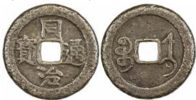
1774. QING: Tong Zhi , 1862-1874, AE cash (9.75g), Jinan mint, Shandong Province, H—, likely a private contemporary casting, interesting heavy thick issue, F-VF $75 - 100