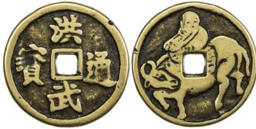
1792. QING: AE charm (20.66g), CCH-354, hong wu tong bao // "boy" riding ox, thick heavy flan, F-VF $75 - 100

Palace cash may or may not be considered a type of amulet. These were made as New Year's gifts to people in the Imperial Palace, usually eunuchs and guards, who often hung the smaller ones below lamps, the larger ones below curtains. Hartill, in "Qing Cash" (Royal Numismatic Society, 2003), agrees they were handed out as gifts in the Palace, but only upon the establishment of each new reign title, and were wrapped in red cloth.