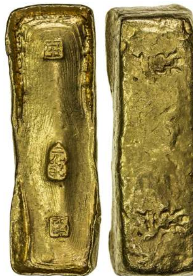
1777. QING: AV rectangular cast ingot (367.51g), 26mm x 79mm x 14mm, undated gold bar circa 1745, weight equal to approximately 10 taels ( liang ), cast in a boat shape with the top having stamped Chinese characters yuan ji (assayer name) and bao (precious) twice, the underside has stamped characters ding yuan , at right and left, EF, RRR $22,000 - 26,000

Lots 1775, 1776 and 1777 are nearly identical to the bars from the wrecks of the French East India Company vessel Prince de conty , and to the Dutch East-Indiaman Geldermalsen .