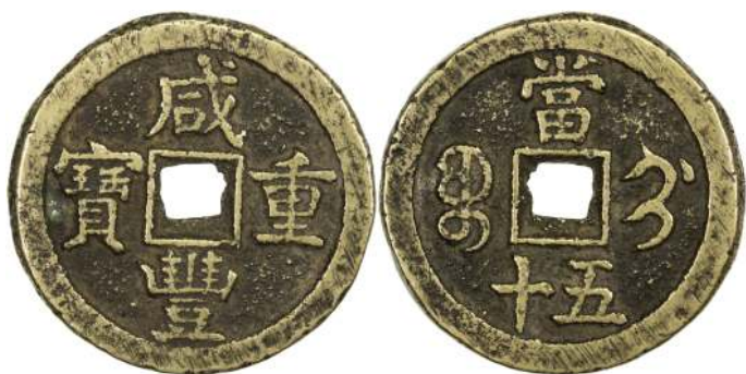
1772. QING: Xian Feng , 1851-1861, AE 50 cash, Jizhou mint, Zhihui Province, H-22.1069, 44mm, cast 1854-55, brass ( huáng tóng ) color, VF, RR $300 - 500