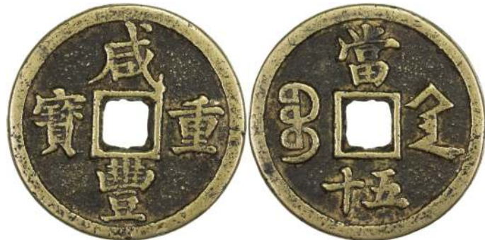
1763. QING: Xian Feng , 1851-1861, AE 50 cash, Xi'an mint, Shaanxi Province, H-22.958, Cr-23-7, 51mm, cast 1854-55, brass ( huáng tóng ) color, VF $100 - 150