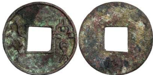
1705. WARRING STATES: State of Qi, 300-220 BC, AE cash (7.21g), H-6.25, yi liu hua ([City of] Yi, [value] six hua) in archaic script, VF-EF, ex Jiùjinshan Collection $250 - 350