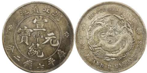
1893. HUPEH: Hsuan Tung , 1909-1911, AR dollar, ND, Y-131, L&M-187, VF $100 - 150