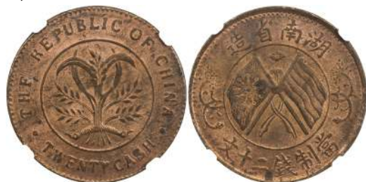
1891. HUNAN: Republic , AE 20 cash, ND (1919), Y-400.2, CCC-181, Duan-937, crossed Wuchang Uprising and five-colored flags, NGC graded MS63 RB $100 - 150