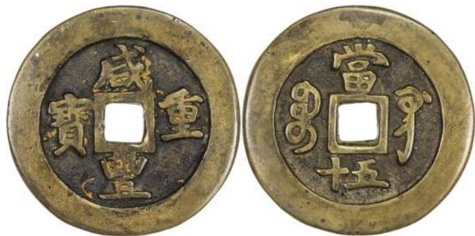
1751. QING: Xian Feng , 1851-1861, AE 50 cash, Gongchang mint, Gansu Province, H-22.808, Cr-14-4, 49mm, straight gong in Manchu script, cast 1854-57, brass ( huáng tóng ) color, VF $75 - 100