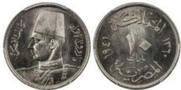
1633. EGYPT: Farouk , 1936-1952, 10 milliemmes, 1941/AH1360, KM-364, PCGS Specimen pop-3/0, total 28, tied for the finest graded by PCGS, PCGS graded Specimen 66, ex King's Norton Mint Collection $350 - 450