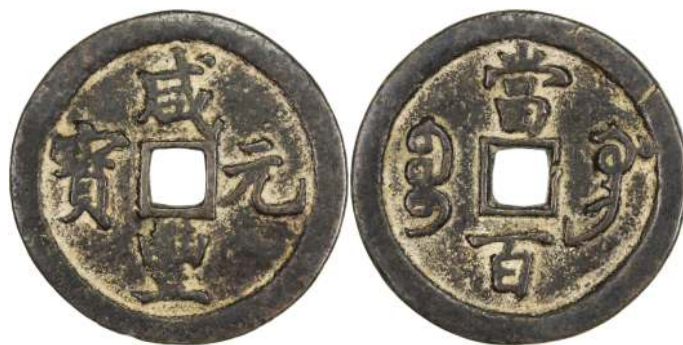
1752. QING: Xian Feng , 1851-1861, AE 100 cash, Gongchang mint, Gansu Province, H-22.809, Cr-14-5, 53mm, curved gong in Manchu script, cast 1854-57, brass ( huáng tóng ) color, VF $75 - 100