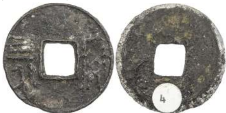
1704. WARRING STATES: State of Qi, 300-220 BC, AE cash (5.32g), H-6.24, yi si hua ([City of] Yi, four hua) in archaic characters, Very Good, ex Jiùjinshan Collection $75 - 100