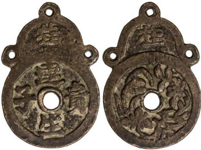
1821. QING: AE charm, CCH-1643 Vol. 2, 48mm x 72mm, lian sheng gui zi (may there be the birth of one honorable son after another), with gua (to hang) above in canopy // floral design, with gua (to hang) above in canopy, VF, RR $100 - 150