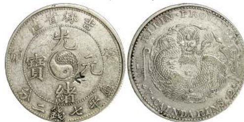
1898. KIRIN: Kuang Hsu , 1875-1908, AR dollar, CD1903, Y-183a.2, L&M-547, 1 chopmark, PCGS graded EF details $500 - 700