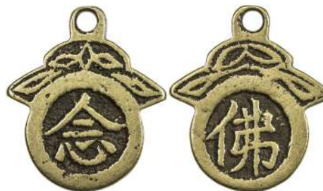
1832. QING: AE charm (9.88g), CCH-2357, pendant-shaped charm, nian fo either side, Fine $50 - 75

This example is was likely cast in the late Qing Dynasty and is often found in Jiangxi Province.