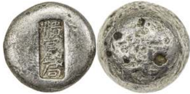
1900. KWEICHOW: AR tael bank ingot (26.71g), Cribb-BMC-Class LI Group B #653, 24mm, Guizhou Xiaoyuanding type, gui zhou guan qian ju (Guizhou official Coin Bureau), VF-EF $150 - 250