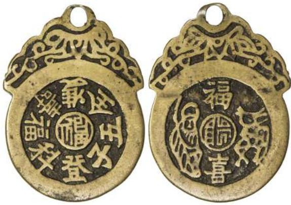
1841. QING: AE charm (16.85g), CCH-2547, 38mm x 54mm, irregular-shaped charm, wu zi deng ke fu shou shuang quan (may your five sons achieve great success in the imperial examinations, happiness and longevity both complete), fu (happiness) at center in seal script // fu (good fortune or happiness) above, xi (which also means happiness) below and shou at center (longevity), written in seal script; the figure to the left is Shou, the God of Longevity, accompanied by a deer, holed as made, Fine $75 - 100