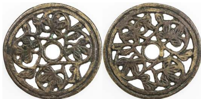
1789. QING: AE charm (24.95g), CCH-108, Vol. 2, 57mm, Open Work type charm, flower and leaf design, couple minor natural cracks, VF $75 - 100 One of the major types of ancient Chinese charms is known as "open-work" money. In Chinese, lou kong qian actually means "hollowed out" money. These charms are also known as ling long qian or "elegant" money. This example was likely cast in the Song or Yuan Dynasty.