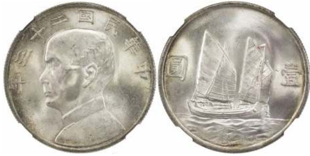
1869. CHINA: Republic , AR dollar, year 23 (1934), Y-345, L&M-110, Sun Yat Sen // Chinese junk, NGC graded MS64 $300 - 400