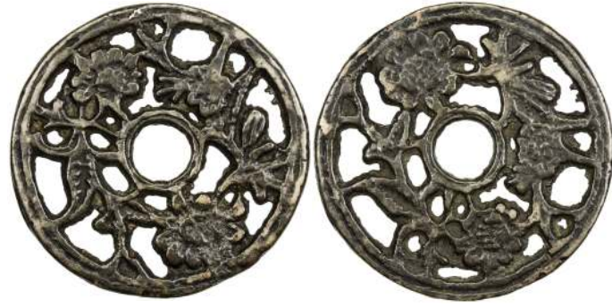
1788. QING: AE charm, CCH-74 Vol. II, 49mm, openwork charm, two flower design, F-VF, ex Daniel K. Ching Collection $75 - 100 Photo size reduced.