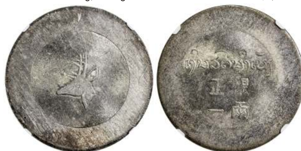
1916. YUNNAN: Republic , AR tael (liang), ND (1943-44), KM-A3, L&M-435, struck for use in the French Indo-China opium trade, small stag's head // denomination in Laotian and Chinese, a superb example with light colorful tone and brilliant luster! NGC graded MS63 $3,300 - 3,500