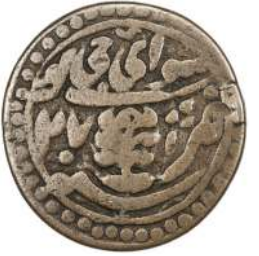
2472. JAIPUR: AE nazarana paisa (16.79g), Sawai Jaipur, year 27, KM-62, in the name of Muhammad Akbar II, bold strike, unpublished year, mount removed, VF, R, ex Paul Stevens Collection $125