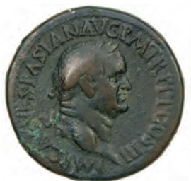
From an old Collection, purchased by the collector in the 1960s with his tag.

ROMAN EMPIRE: Vespasian, 69-79 AD, AR denarius (3.11g), 517. RIC-2, RSC-226, struck AD 69-70, IMP CAESAR VESPASIANVS AVG, laureate head right // IVDAEA beneath captive Jewess sitting right on ground, hands tied before her, trophy of captured arms behind, Very Good