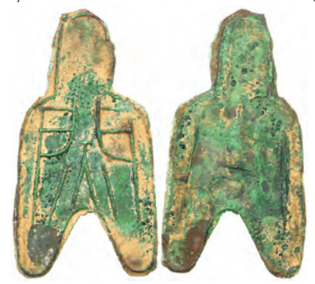
585. WARRING STATES: Anonymous, 350-250 BC, AE spade money (8.07g), H-3.483, round foot spade type, small size, archaic lin obverse, light encrustation, a superb example! VF-EF, RRR $800 - 1,000

This type is represented by the coins of five cities in present-day Shanxi, between the Fen and Yellow River. There are two sizes, the equivalent of the one jin and half jin denominations. They have various numerals on their reverses. One school of thought ascribes them to the states of Qin and Zhao at the end of the Warring States period; another to the State of Zhongshan during the 4th century BC.