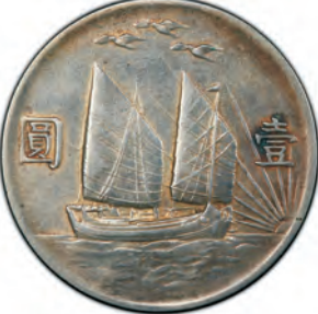
692 CHINA: Republic, AR dollar, year 21 (1932), Y-344, L&M-108, Sun Yat Sen // birds over Chinese junk under sail, cleaned, PCGS graded AU details $2,000 - 3,000