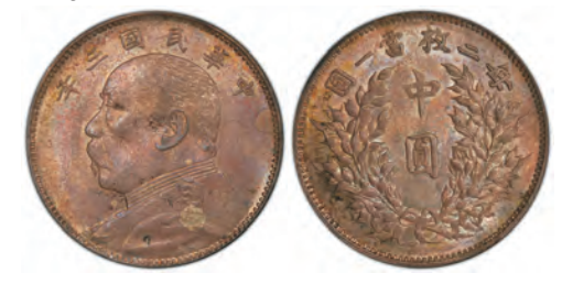
670. CHINA: Republic, AR 50 cents, year 3 (1914), Y-328, L&M-64, an attractively toned mint state example, PCGS graded MS61 $800 - 1,000