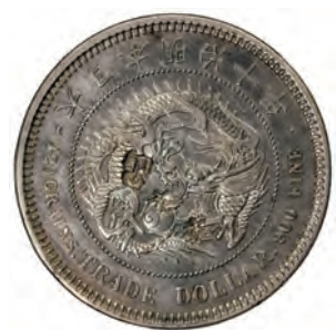
A very rare coin and even more rare with a Chinese chopmark. This is the first example of this type and date we have ever encountered chopmarked.