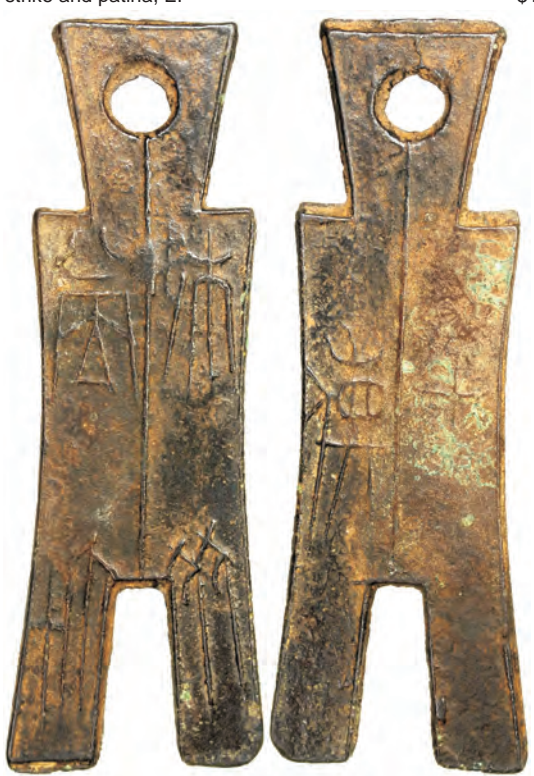
583. WARRING STATES: State of Chu , 350-250 BC, AE spade money (34.23g), H-3.470, 35x102mm, large flat-handle square-foot spade type, pei bi dang jin on obverse, shi huo on reverse in archaic script, a superb example for this rare type! $1,500 - 2,000

The State of Chu was an ancient Chinese state in the Yangtze valley during the Zhou Dynasty. Originally Chu was considered a viscountcy, but starting from King Wu in the early 8th century BC, the rulers of Chu declared themselves kings on an equal footing with the Zhou rulers. Originally known as Jing and then as Jingchu, Chu occupied vast areas of land at its height, including most of the present-day provinces of Hubei and Hunan, along with parts of Chongqing, Guizhou, Henan, Anhui, Jiangxi, Jiangsu, Zhejiang, and Shanghai. The hao in the reverse inscription shi hao probably refers to ten ant nose type coins. These spades are thick and robust with well-developed rims all the way around, usually crudely cast with a large round hole in the top.