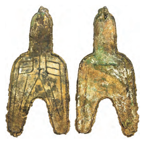
584. WARRING STATES: Anonymous, 350-250 BC, AE spade money (14.21g), H-3.482, round foot spade type, large size, archaic lin obverse, tiny natural casting hole at top, still a superb example! VF-EF, RRR $1,000 - 1,500