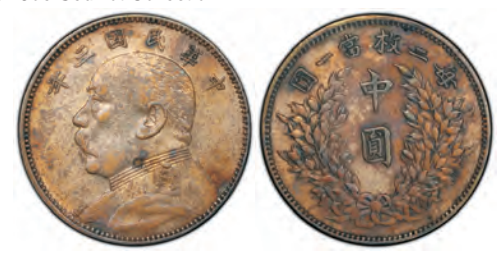
672. CHINA: Republic, AR 50 cents, year 3 (1914), Y-328, L&M-64, Yuan Shi Kai in military uniform, cleaned and partially retoned, PCGS graded XF Details $700 - 90