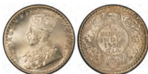
949. BRITISH INDIA: George V, 1910-1936, AR 1/4 rupee, 1930(c), KM-518, S&W-8.170, a fantastic lustrous example! PCGS graded MS66 $150 - 250