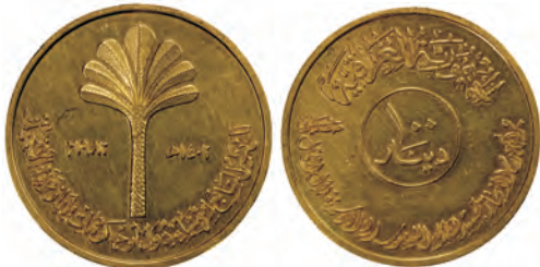
1052. IRAQ: AV 100 dinars , 1982/AH1402, KM-158, Nonaligned Nations Conference in Baghdad, surface hairlines as usual, cleaned, mount removed (probably originally in proof), VF-EF $1,400 - 1,500