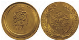
1145. TURKEY: Republic, AV 50 kurush (3.59g), Ankara, 1927, KM-841, mintage of only 2,116 pieces, EF, Scarce $220 - 260