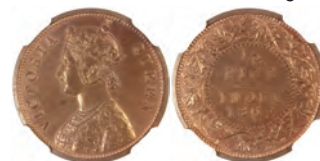
928. BRITISH INDIA: Victoria, Queen, 1837-1876, AE ½ pice, 1862(c), KM-466, Prid-709, S&W-4.175, variety A/I, proof restrike, cleaned, NGC graded Proof details $180 - 220