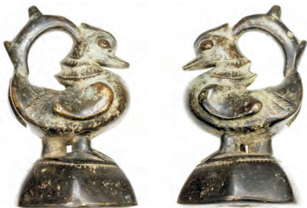
1002. BURMA/MYANMAR: AE opium weight (1292g), late 18th-early 19th century, Gear period C, group 2, 112mm tall, bird-type with handle on hexagonal base, cast to a standard of 80 kyat, Choice VF, R $200 - 250