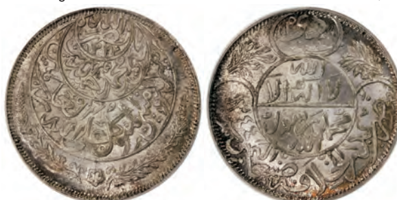
1153. YEMEN: Yahya b. Muhammad, 1904-1948, AR imadi riyal, San'a, AH1344, Y-7, an amazing example! PCGS graded MS67 $150 - 250

Several die varieties exist as these were likely struck over a number of years with a frozen date.