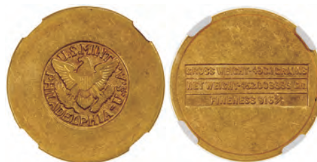
1126. SAUDI ARABIA: AV 4 pounds , ND (1945-46), KM-34, struck at the United States Mint in Philadelphia, obverse scratched, AU details $1,800 - 2,000

Issued to pay the Saudi Arabian government for oil rights and struck with the same gold content as four British sovereigns.