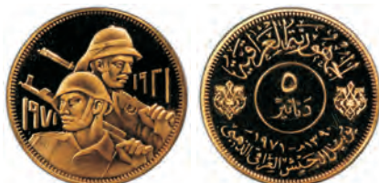
1054. IRAQ: Republic , AV 5 dinars, 1971/AH1390, KM-134, Iraqi Army 50th Anniversary, PCGS graded Proof 69 Cameo $750 - 850