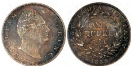
922. BRITISH INDIA: William IV, 1830-1837, AR rupee, 1835(c), KM-450.7, 'R.S.' incused on truncation, thin letters variety, a lovely toned mint state example! NGC graded MS63 $150 - 250