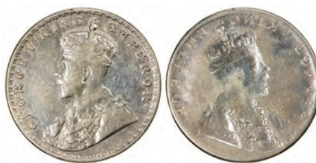
951. BRITISH INDIA: George V, 1910-1936, AR rupee, ND, KM-524, obverse mirror brockage error, F-VF, R $140 - 180