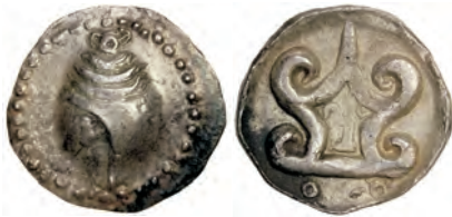
989. BURMESE KINGDOMS: HAMSAVATI: ca. 5th century, AR unit (9.86g), Mahlo-15b, conch shell, with tentacles at the top, open to the left // sriavatsa, ankusa & crescent inside, 2 annulets below, without celestial symbols, superb quality, EF $200 - 300