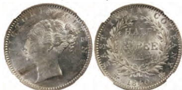
923. BRITISH INDIA: Victoria, Queen, 1837-1876, AR ½ rupee, 1840(c), KM-455.2, S&W-2.32, East India Company issue, continuous legend type, crescent on left ribbon bow, a lovely mint state example! NGC graded MS63, RR $1,500 - 2,500