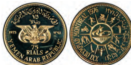
1154. YEMEN: Arab Republic, AV 75 rials, 1975/AH1395, KM-21, XXI Summer Olympics - Montreal, mintage of only 500 coins in proof! PCGS graded Proof 67 Deep Cameo, R $1,000 - 1,200

Several die varieties exist as these were likely struck over a number of years with a frozen date.