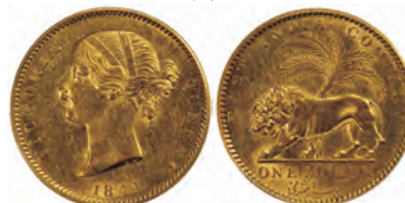
925. BRITISH INDIA: Victoria, Queen, 1837-1876, AV mohur, 1841(c), KM-462.1, S&W-3.7, variety with large date, plain '4', and dot after date, attractively lustrous, PCGS graded AU53 $2,200 - 2,400