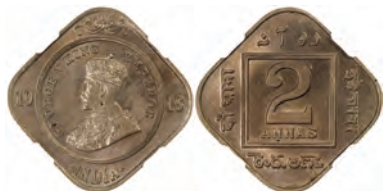
947. BRITISH INDIA: George V, 1910-1911, 2 annas, 1918(c), KM-516, a wonderful mint state example! NGC graded MS64 $125 - 175