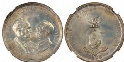
1123. PHILIPPINES: Commonwealth , AR 50 centavos, 1936-M, KM-176, Establishment of the Commonwealth - Murphy and Quezon, a wonderful example! NGC graded MS64 $200 - 300