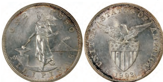
1121. PHILIPPINES: U.S. Territory , AR peso, 1903, KM-168, Philadelphia Mint, attractive peripheral toning, early-style NGC slab, NGC graded AU58 $180 - 240