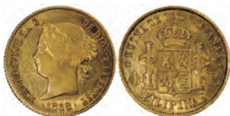
1119. PHILIPPINES: Isabel II , 1833-1868, AV 4 pesos, 1868, KM-144, hairlines and scratches, VF-EF $400 - 450