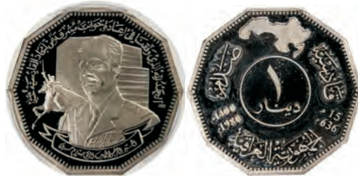
1059. IRAQ: Republic , 1 dinar, 1980/AH1400, KM-149, Battle of al-Qadisiyyah, bust of Saddam Hussein, PCGS graded Proof 65 Deep Cameo $200 - 300