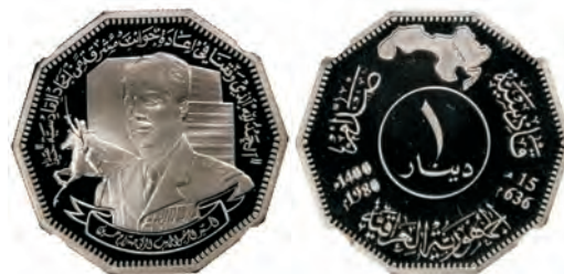
1058. IRAQ: Republic , dinar, 1980/AH1400, KM-149, Battle of Qadisiyyah, bust of Saddam Hussain, 10-sided, NGC graded Proof 69 Ultra Cameo $200 - 300