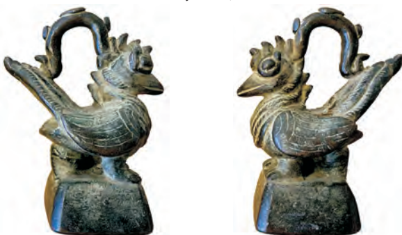
1005. BURMA/MYANMAR: AE opium weight (4161g), 176mm tall, bird-type with handle on square base with Burmese inscription, cast to a standard of 250 kyat, possibly a mid-20th century imitation, Choice VF $100 - 150