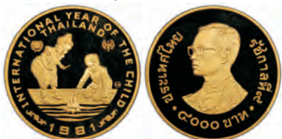
1144. THAILAND: Rama IX, 1946-2016, AV 4000 baht, 1981/BE2524, Y-153, International Year of the Child, mintage of only 3,963 pieces, PCGS graded Proof 69 DCAM, Scarce $1,000 - 1,100