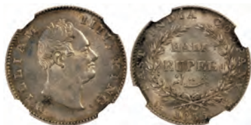
921. BRITISH INDIA: William IV, 1830-1837, AR ½ rupee, 1835(c), KM-449.3, S&W-1.54, East India Company issue, 'F' incuse on truncation, 19 berries in wreath, a lovely mint state example! NGC graded MS63, RR $3,000 - 4,000