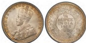
948. BRITISH INDIA: George V, 1910-1936, AR 1/4 rupee, 1928(b), KM-518, S&W-8.166, a fantastic lustrous example! PCGS graded MS66 $150 - 250