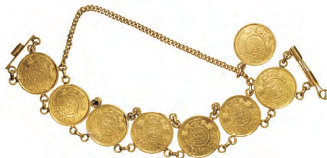
1128. SAUDI ARABIA: AV coin bracelet (80.55g), composed of 8 AV guineas (KM-36, AH1370, all AU or better) concatenated with gold chains and fastened with a split pin $4,500 - 5,000