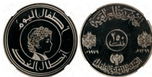
1057. IRAQ: Republic , 250 fils, 1979/AH1399, KM-144, Schön-50, International Year of the Child, reported mintage of only 10,000 pieces, proof-only issue, NGC graded Proof 68 Ultra Cameo $250 - 350