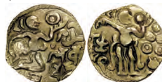
1009. CEYLON (MEDIEVAL): Anonymous, ca. 990-1070, AV stater (4.38g), Mitch-825, king running, holding conch, legend sri lanka vighu to left // king standing, holding flower, bold strike, slightly debased gold, well-centered, EF $300 - 400