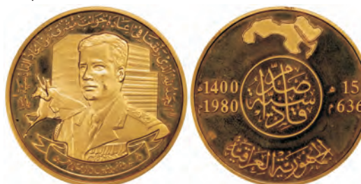
1060. IRAQ: Republic , AV 100 dinars, 1980/AH1400, KM-M2, Battle of al-Qadisiyyah, bust of Saddam Hussein, Proof, RR $2,400 - 2,800