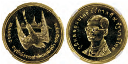
1143. THAILAND: Rama IX, 1946-2016, AV 5000 baht, BE2517 (1974), Y-104, Conservation Series - White-eyed River Martin, mintage of only 2,602 pieces, NGC graded MS66, Scarce $3,000 - 3,500