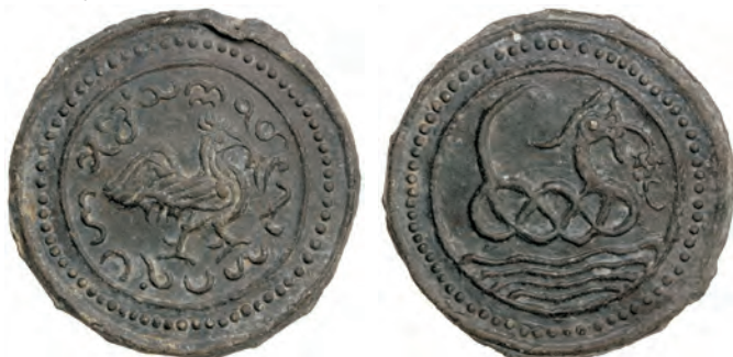
992. BURMESE KINGDOMS: TENASSERIM-PEGU: Anonymous, 17th-18th century, cast large tin coin (65.64g), Robinson-18 (Plate 10.1), 69.7mm, mythical hintha bird facing right, Burmese legend around, which means "city of great happiness" // knotted dragon above the sea, wonderfully bold example! EF-AU, RRR $400 - 500 Three examples have been sold at our Auctions 33, 35, and 38, and this piece is also from the same mold. This is perhaps the finest of all four pieces.