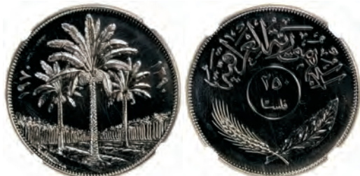
1053. IRAQ: Republic , 250 fils, 1970/AH1390, KM-130, Schön-36, F.A.O. Issue-Agrarian Reform Day, very lustrous, mintage of only 1,000 pieces, NGC graded Proof 68, R $300 - 400