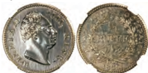
920. BRITISH INDIA: William IV, 1830-1837, AR ¼ rupee, 1835(c), Prid-92, KM-448., S&W-1.70, variety C/IV, proof restrike, a lovely lustrous example! NGC graded Proof 63 $750 - 950