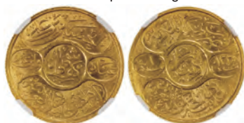
1124. HEJAZ: al-Husayn b. 'Ali , 1916-1924, AV dinar hashimi, Makka al-Mukarrama (Mecca), AH1134 year 8, KM-31, one-year type, a very lustrous example! NGC graded MS63 $1,000 - 1,200