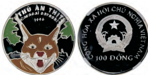
1152. VIET NAM: Socialist Republic, AR 100 dong, 1996, KM-48, Caracal, with colored enamel, NGC graded Proof 68 Ultra Cameo $175 - 275