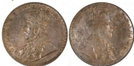
950. BRITISH INDIA: George V, 1910-1936, AR rupee, ND, KM-524, obverse mirror brockage error, deeply toned, ANACS graded AU58 $200 - 300