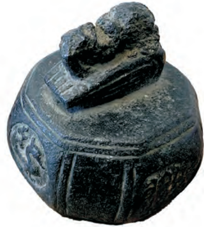
999. BURMA/MYANMAR: AE opium weight (1123g), mid-16th century, Gear period K/L, group 6, cf. p.77, 65mm wide, cast to a contemporary standard of 80 kyat, hintha bird (top parts obliterated) on drum-shaped hexagonal base embossed with hintha bird (front and back), Mon inscriptions (left), and the letter gha followed by numerals (right), VF, R $300 - 400