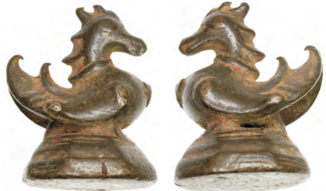
1000. BURMA/MYANMAR: AE opium weight (306.56g), mid-late 18th century, Gear period E, group 3, 60mm tall, bird-type with trefoil on chest, on octagonal base with horizontal lines and 9-rayed star sign, cast to a standard of 20 kyat, coated with traces of vermilion powder, VF $100 - 150