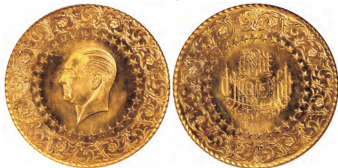
1147. TURKEY: Republic, AV 500 kurush, 1970, KM-874, Ziyet Death of Kemal Ataturk series, a wonderful mint state example! NGC graded MS64 $2,000 - 2,400