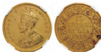
953. BRITISH INDIA: George V, 1910-1936, AV 15 rupees, 1918(b), KM-525, S&W-8.2, Prid-26, Bombay mint restrike issue, a stunning & rare restrike proof! NGC graded Proof 63 $5,000 - 6,000