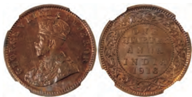
944. BRITISH INDIA: George V, 1910-1936, AE 1/4 anna, 1916(c), KM-512, rare date, NGC graded MS64 BN, R $130 - 170