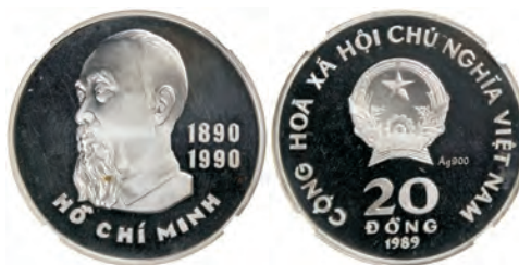
1151. VIET NAM: Socialist Republic, AR 20 dong, 1989, KM-40a, 100th Anniversary of the Birth of Ho Chi Minh, NGC graded Proof 64 Ultra Cameo $180 - 260