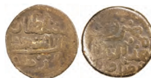
1011. MACASSAR: Malik as-Sa'id, 1639-1653, tin pitis (2.63g), ND, Millies-282, cf. Zeno-203309, Jawi legend in 3 lines, sultan / malik al-sa'id / firman // masruf / haza al-balad / rasas ("small tin money of this city"), decent example for this very rare ruler, Fine, RR $150 - 200