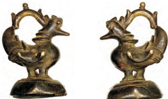
1004. BURMA/MYANMAR: brass opium weight (1530g), late 18th-early 19th century, Gear period C, group 2, 133mm tall, bird-type with handle on hexagonal base (cracked and chipped on bottom), cast to a standard of 100 kyat, VF, R $150 - 200