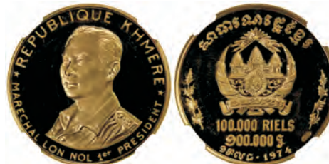
1007. CAMBODIA: Khmer Republic, AV 100,000 riels, 1974, KM-66, bust of President Lon Nol left, mintage of only 100 coins of this rare type! NGC graded Proof 68 Ultra Cameo, RR $1,500 - 1,700