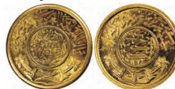
1127. SAUDI ARABIA: 'Abd al-'Aziz b. Sa'ud , 1926-1953, AV guinea, Makka al-Mukarrama (Mecca), AH1370, KM-36, actually struck at the Paris Mint in France, BU $450 - 550

Issued to pay the Saudi Arabian government for oil rights and struck with the same gold content as four British sovereigns.