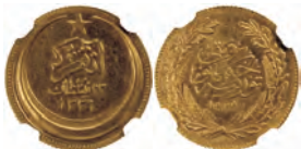
1146. TURKEY: Republic, AV 50 kurush, 1929, KM-841, scarce type, a lovely lustrous example! NGC graded MS63, Scarce $250 - 350