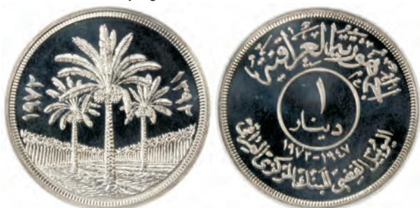
1056. IRAQ: Republic , AR dinar, 1972/AH1292, KM-137, 25th Central Bank Anniversary, PCGS graded Proof 68 Cameo $180 - 220