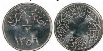
1125. SAUDI ARABIA: Abd Al-Aziz Bin Sa'ud , 1926-1953, 1/2 ghirsh, AH1356, KM-20.1, PCGS graded Specimen 67, RR, ex King's Norton Mint Collection $250 - 350