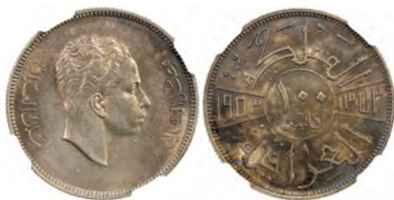
1051. IRAQ: Faisal II , 1939-1958, AR 100 fils, 1953/AH1372, KM-115, NGC graded MS61, R $260 - 325