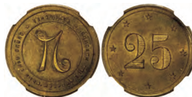
1006. CAMBODIA: 25 centimes token, ND (1860-1906), KM-Tn4, Lec-104, brass token struck for the Royal Palace in Phnom Penh, a lovely mint state example! NGC graded MS63 $600 - 800