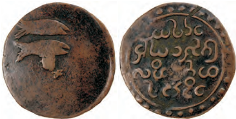
998. BURMA/MYANMAR: Bodawpaya , 1782-1819, AE ¼ pe (pice) (9.30g), CE1143 (1782), KM-2.1, Robinson-8.3, two fish // Burmese text, without the center hole, first struck in 1797, some central weakness due to die-damage on the obverse die (resembling a "pregnant" fish!), unusually well-preserved without any surface damage, choice VF, R $180 - 240

The heavy weight of this relatively thin piece indicates that it is largely lead, with little or no tin.