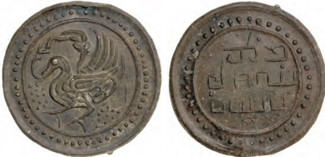
990. BURMESE KINGDOMS: TENASSERIM-PEGU: Anonymous, 17th-18th century, cast large tin coin (40.31g), Robinson-, 66.7mm; mythical hintha bird facing left, tail rising above, holding a leaf branch in its beak, 12 pellets below the beak & 10 pellets beneath the tail // stylized Burmese text, based on Robinson text B1, but with square Burmese letters, one additional symbol above, finest casting quality and perfect preservation, AU, RR $240 - 300