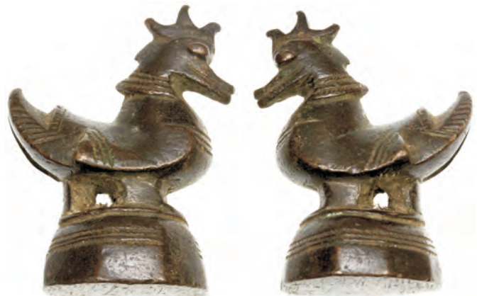
1001. BURMA/MYANMAR: AE opium weight (159.44g), late 19th century, Gear period A, group 1, 53mm tall, bird-type on hexagonal base with horizontal lines and bird sign, cast to a standard of 10 kyat, attractive example, VF-EF $100 - 150

NOTE: Many of these Burmese opium weights have reduced image sizes. Please read the description carefully to see the actual size. Many are quite large!