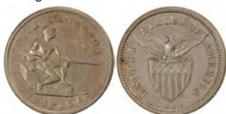
1122. PHILIPPINES: U.S. Territory , 5 centavos, 1918-S, KM-173, lightly cleaned reverse, mule with 20 centavos reverse, VF, R $225 - 325