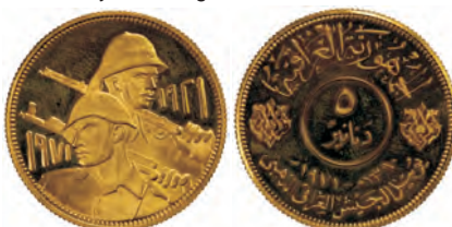
1055. IRAQ: Republic , AV 5 dinars, 1971/AH1390, KM-134, Iraqi Army 50th Anniversary, light obverse hairlines, Proof $750 - 850