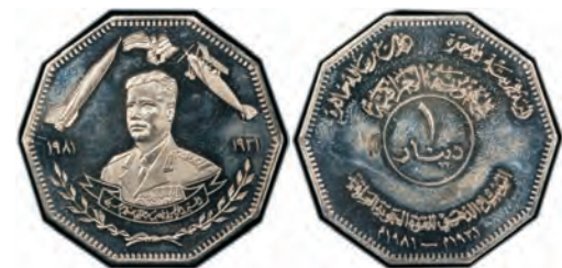
1061. IRAQ: Republic , 1 dinar, 1981, KM-153, 50th Anniversary of the Iraqi Air Force, PCGS graded Proof 65 Deep Cameo $150 - 250