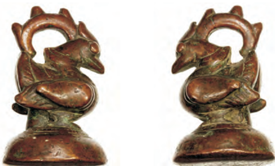
1003. BURMA/MYANMAR: AE opium weight (795.00g), early 19th century, Gear period B, group 2, 60mm tall, bird-type with handle on hexagonal base, cast to a standard of 50 kyat, possibly a local issue, VF $150 - 200