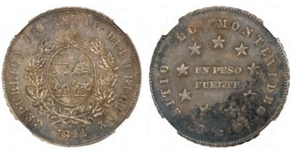
URUGUAY: Republic, AR peso fuerte, 1844, KM-5, Peso del Sitio issued during the Siege of Montevideo, PCGS graded MS61 $1,200 - 1,500

1843 and 1851 during the Uruguayan Civil War. The "Peso del Sitio" was the first and only silver coin minted at Uruguay. As city was under siege, the silver was provided by citizens and this is the reason of the low mintage.