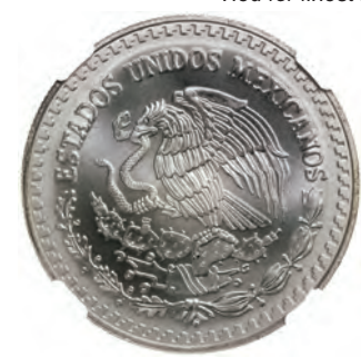
Tied for finest known at NGC.