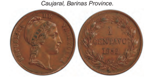
VENEZUELA: Republic, AE centavo, 1852, Y-6,

This imitation cob-type coin was minted from 1817 to 1824 by General José Antonio Páez in the South-west Venezuela in