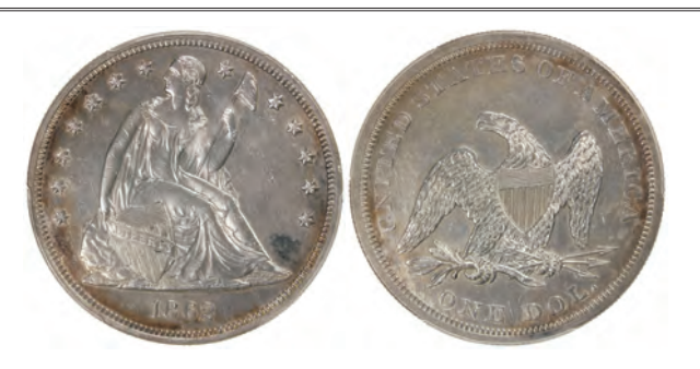
1595. UNITED STATES: AR dollar, 1862, Liberty Seated type, low mintage of only 11,540, cleaned, PCGS graded UNC details $1,500 - 2,000

The 1862 silver dollar is just as rare as its low mintage suggests. There was little demand for silver coins during 1862, as the introduction of non-redeemable notes by both North and South during the Civil War drove such pieces from circulation. They remained at a premium to paper currency for the next 14 years, this disparity reaching its apex during 1864, when the paper dollar was worth just half the value of gold or silver coin.