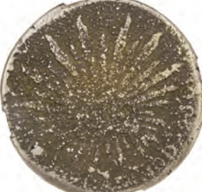
1558. MEXICO: Revolutionary Issue, AR peso, Sinaloa, ND (ca. 1915), KM-768, sand cast using a regular 8 reales KM-377, crude as always, graded genuine by NGC (no numerical grade)