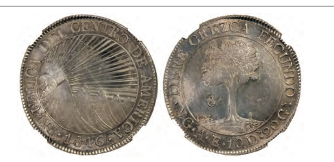
1504. CENTRAL AMERICAN REPUBLIC: AR 8 reales, 1846/2-NG, KM-4, assayer AE, struck only as overdate, AE/MA with CREZCA over CRESCA, scarce overdate variety and this a wonderful well-struck lustrous example! NGC graded MS64 $3,000 - 5,000