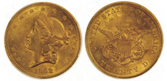
603. UNITED STATES: AV 20 dollars, 1852, Liberty Head type, very scarce in mint state quality! PCGS graded MS61, Scarce $4,500 - 5,500