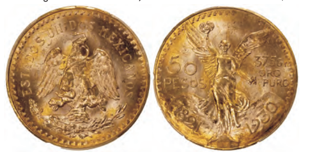
1569. MEXICO: Estados Unidos, AV 50 pesos, 1930, KM-481, "Centenario" type first issued for the 100th Anniversary of Independence from Spain, a superb quality example! PCGS graded MS65 $2,400 - 2,600