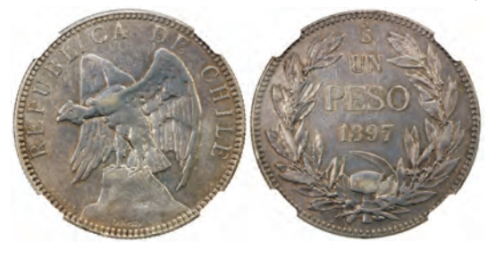
1508. CHILE: Republic, AR peso, 1897, KM-152.1, EI-142, lightly cleaned, starting to retone, key date, NGC graded AU details, RR $800 - 1,000