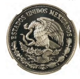
Tied for finest known at NGC.