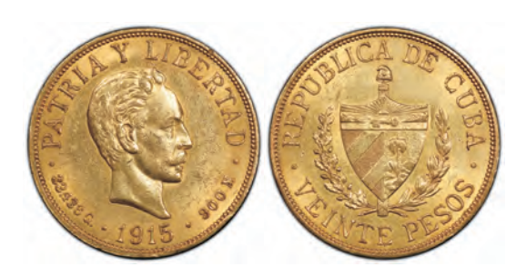
1511. CUBA: Republic, AV 20 pesos, 1915, KM-21, PCGS graded AU58