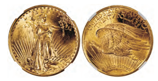
1604. UNITED STATES: AV 20 dollars, 1924, Saint-Gaudens type, NGC graded MS62 $1,900 - 2,200