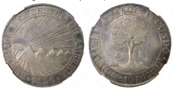
1502. CENTRAL AMERICAN REPUBLIC: AR 8 reales, Nueva Guatemala mint, 1826-NG, KM-4, assayer M, CRE(S/C)CA variety, a wonderful example, seldom encountered in this choice condition, NGC graded AU53 $1,000 - 1,200