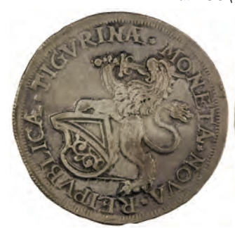
Tied with only one other example for finest graded at NGC (top pop).